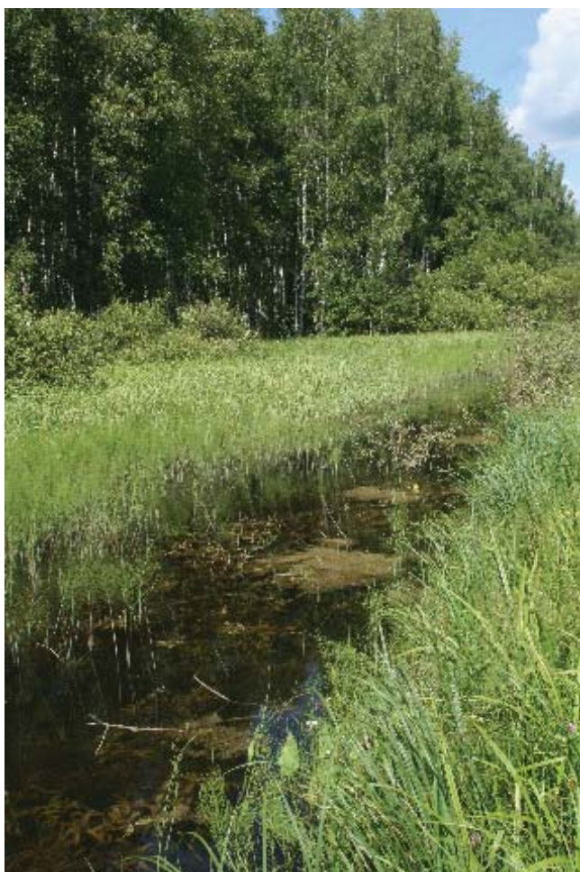
Figure 6. A long roadside swamp at the Kyshtovka village northern margin (Loc. 3a), a habitat of Lestes dryas , L. sponsa , L. virens , L. macrostigma (?stray), Coenagrion ecornutum , C. puella , Aeshna juncea , Libellula quadrimaculata , Sympetrum flaveolum , S. sanguineum , 16.07.2015.