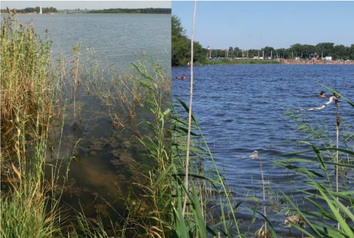
Figure 8. The south-western bank of Lake Pestroe at the Petropavlovsk southern suburbs (Loc. 9). 28.06.2015 (right) and 16.08.2015 (left).