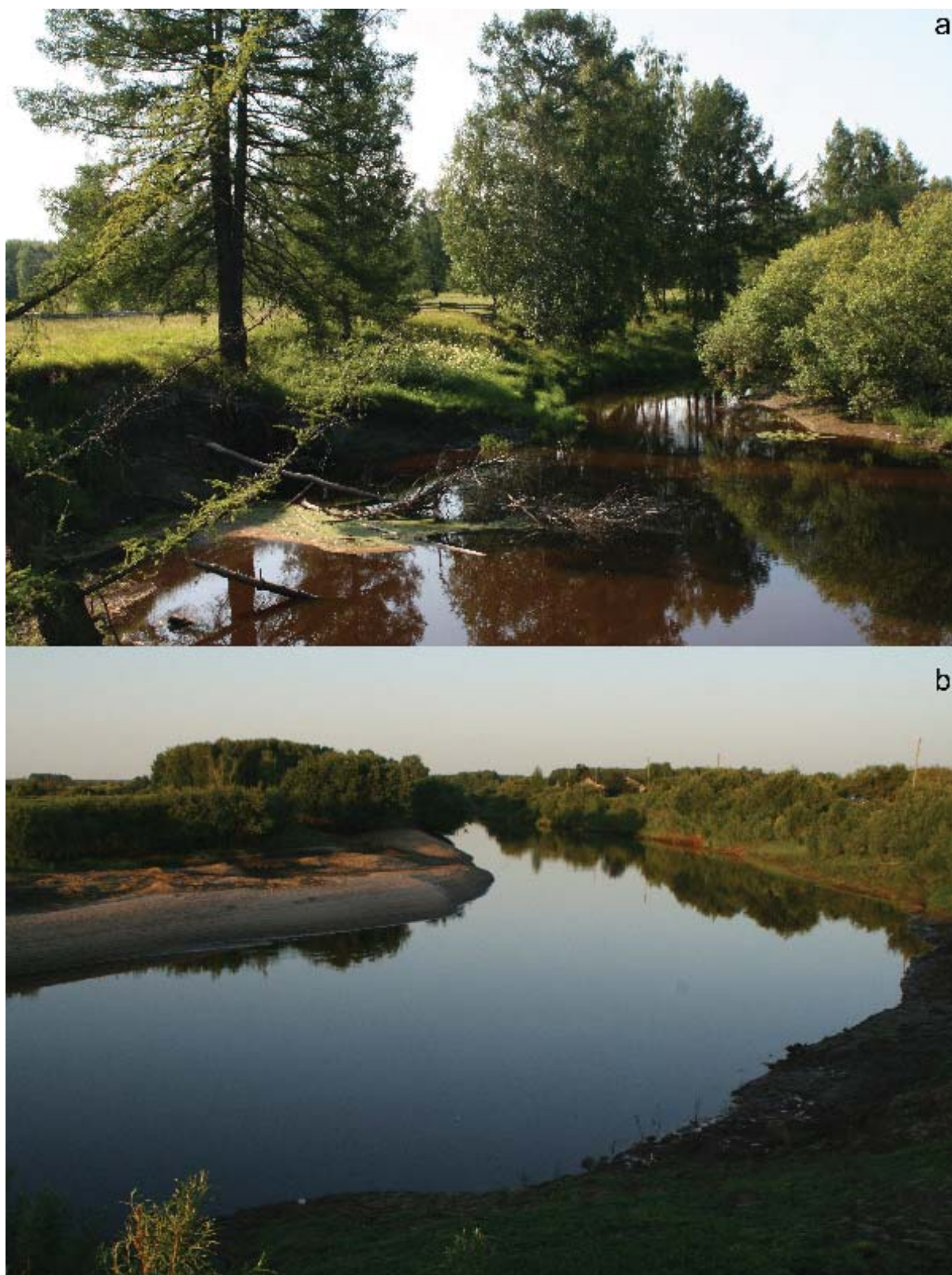
Figure 2. The rivers of Kyshtovka District of Novosibirsk Province: a – the Uy River at Orlovka village (Loc. 1), 16.07.2015; b – the Tara River at Kyshtovka village (Loc. 4), 14.07.2015.

pine ( Pinus sylvestris L.) with admixture of Siberian larch ( Larix sibirica Ledeb.) in the upper layer; and Siberian spruce ( Picea obovata Ledeb.) with admixture of Siberian