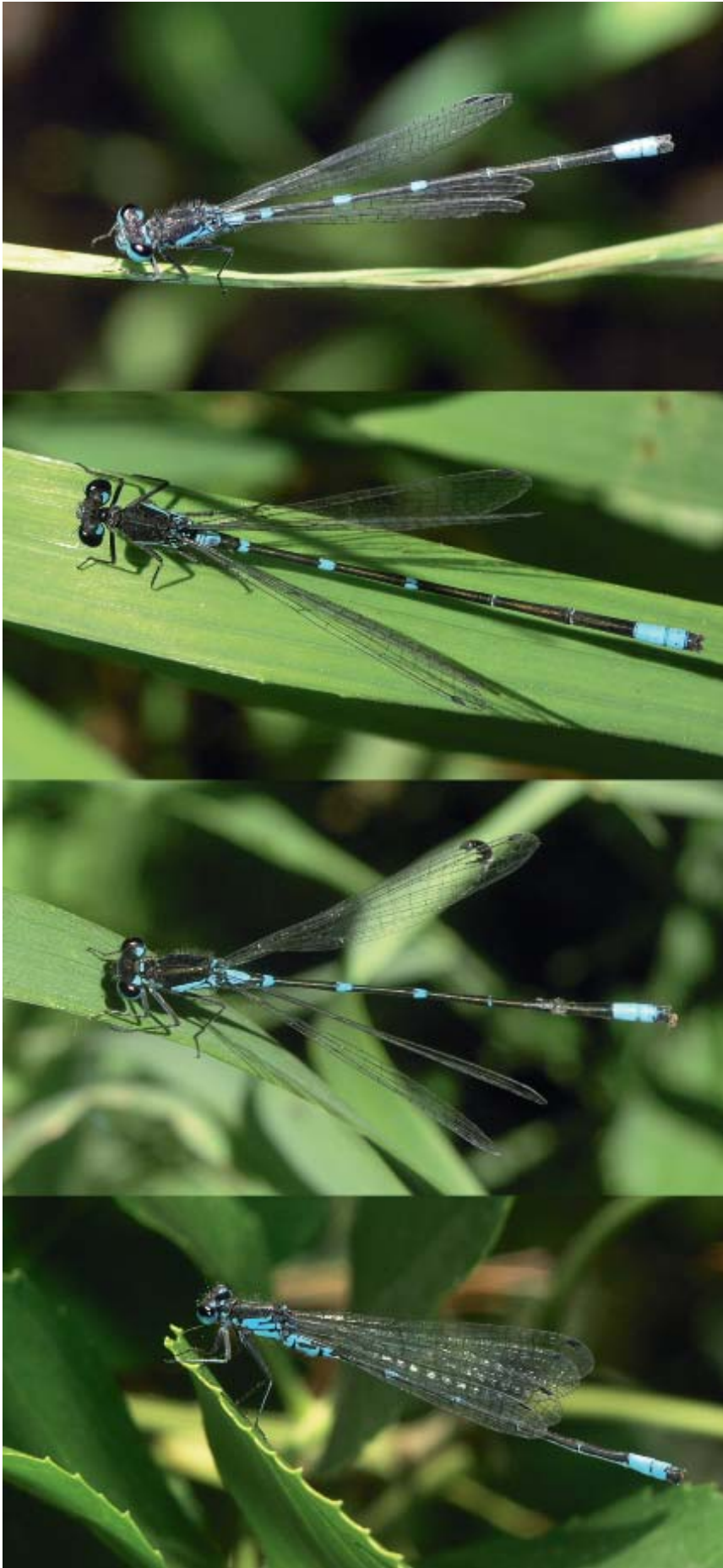
Figure 10. Four different males of Coenagrion pulchellum sibiricum at the eastern bank of the Kamenka oxbow lake of the Ishim floodplain (Loc. 7). 28.06.2015 (left).