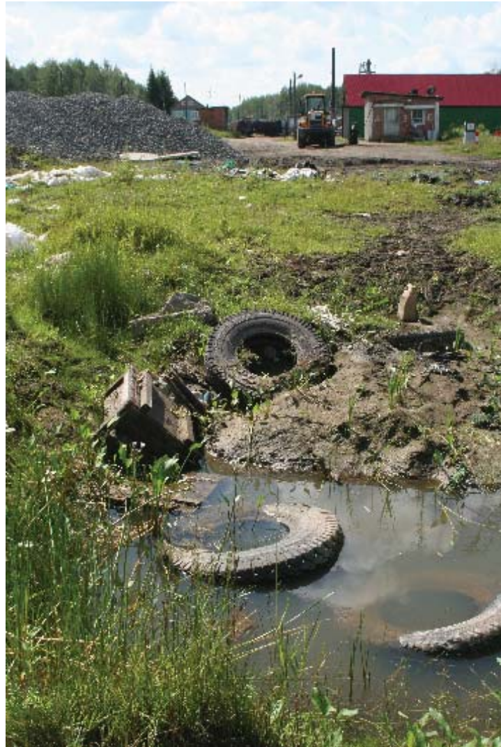
Figure 8. A small water-filled hole at the Kyshtovka village northern margin (Loc. 3c), a habitat of Lestes dryas and L. macrostigma , 16.07.2015.

Locality 3c. 600-700 m from Loc. 3a, ca 300 m from Loc. 3b. A flooded and garbage-strewn man-made hole (3x5 m) at a construction site, with Juncus sp., Eleocharis sp., A. plantago-aquatica and Butomus umbellatus L. (Fig. 8). 56°34'36" N, 76°36'04" E. 95 m a.s.l.