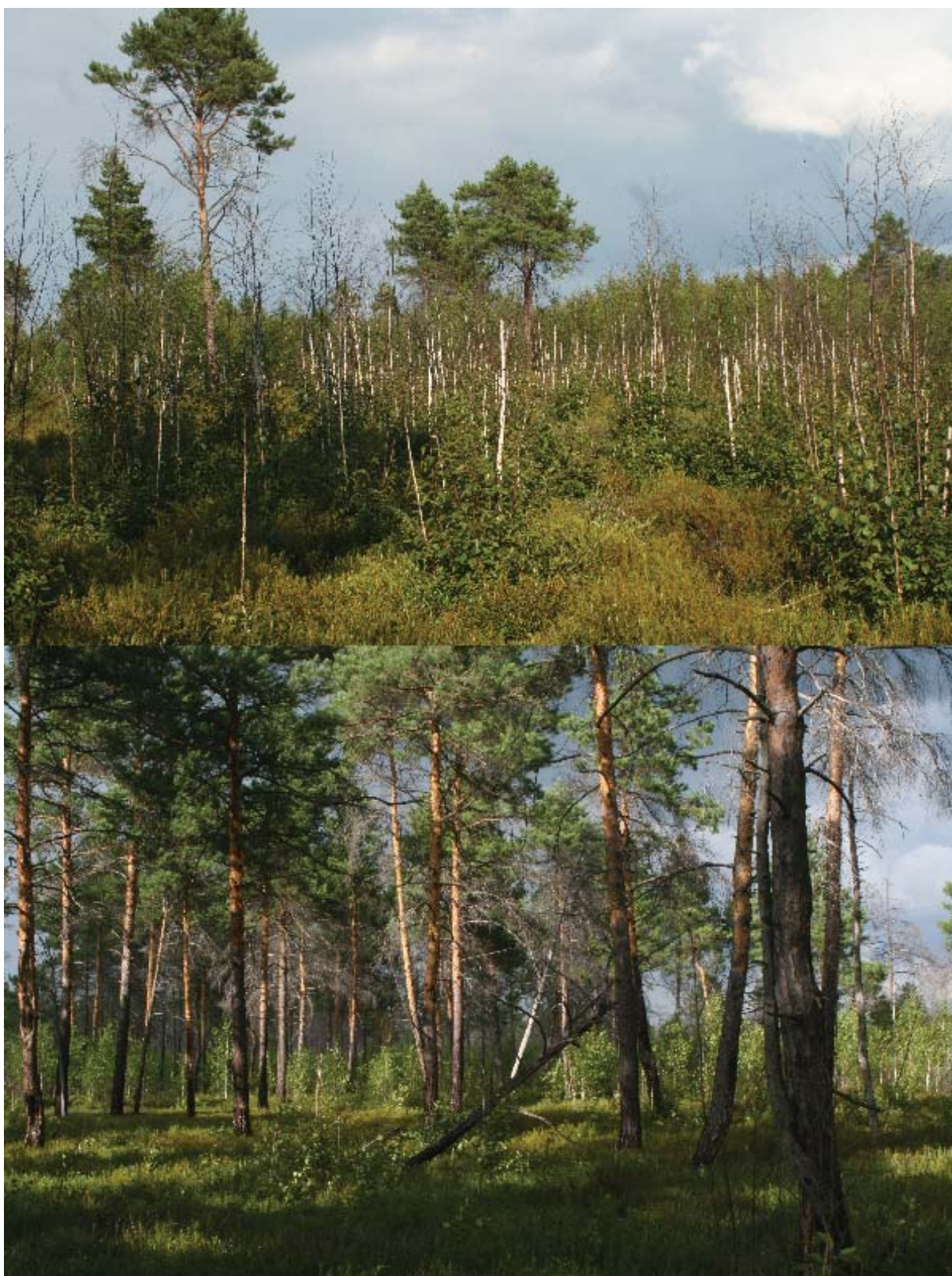
Figure 5. A round raised peat-moss bog (local ryam) (Loc. 6) inside the Paganay Bog at Usmanka village, a foraging habitat of Lestes dryas , L. virens , L. barbarus , Sympetrum flaveolum , S. vulgatum . 15.07.2015.