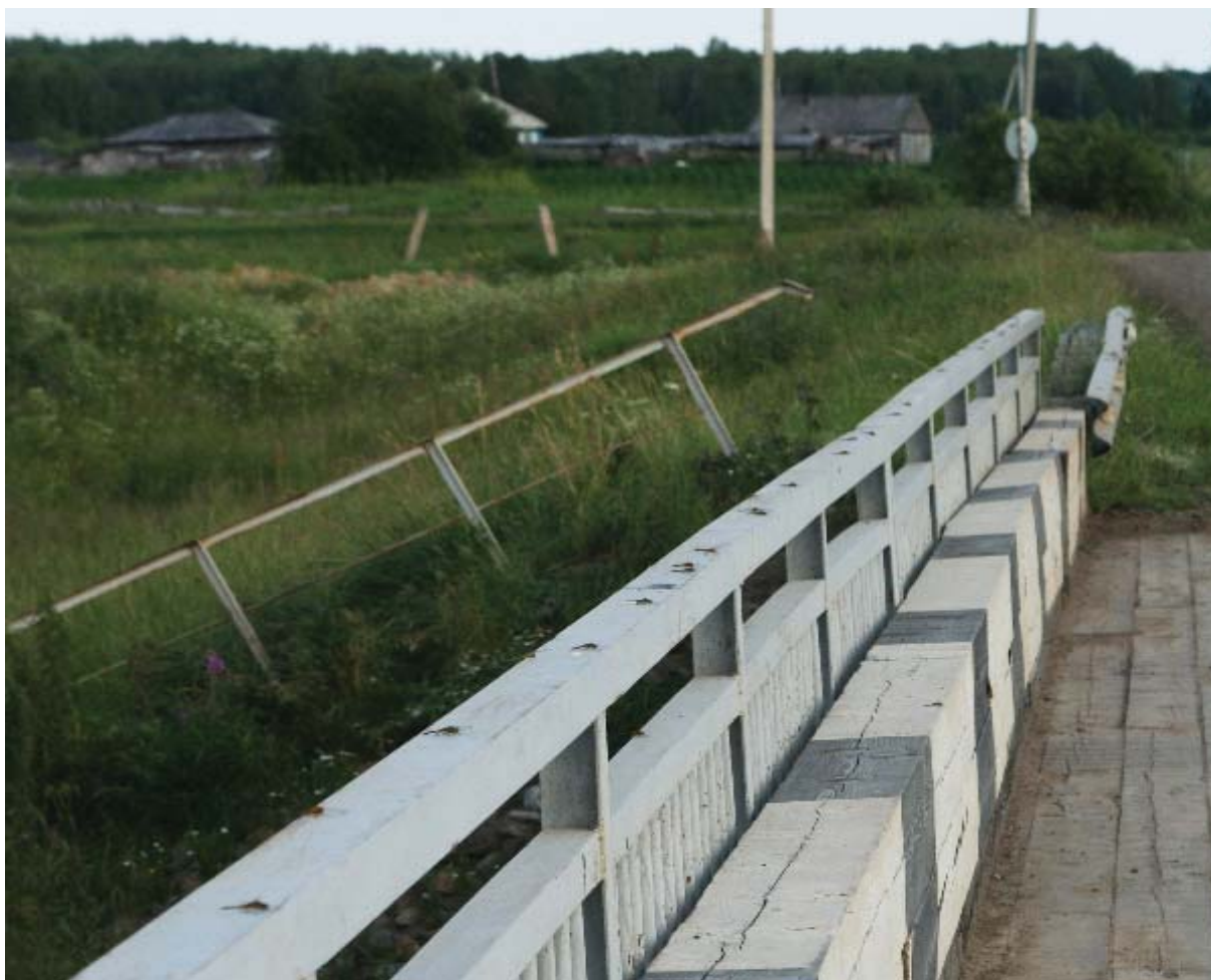
Figure 11. Sympetrum flaveolum perching at a railing of a bridge across the Uy River in Orlovka village (Loc. 1), 16.07.2015.

An abundance of these dragonflies at a waterless peat-moss bog was quite surprising. They perhaps migrated there for feeding from the surrounding shallow reed swamps, where this species would find its preferred breeding habitat, but where I failed to observe any individual.