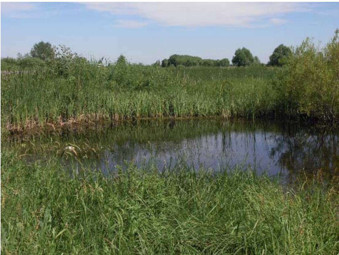
Figure 4. A small roadside swamp in the Petropavlovsk north-eastern environs (Loc. 4). 27.06.2015.