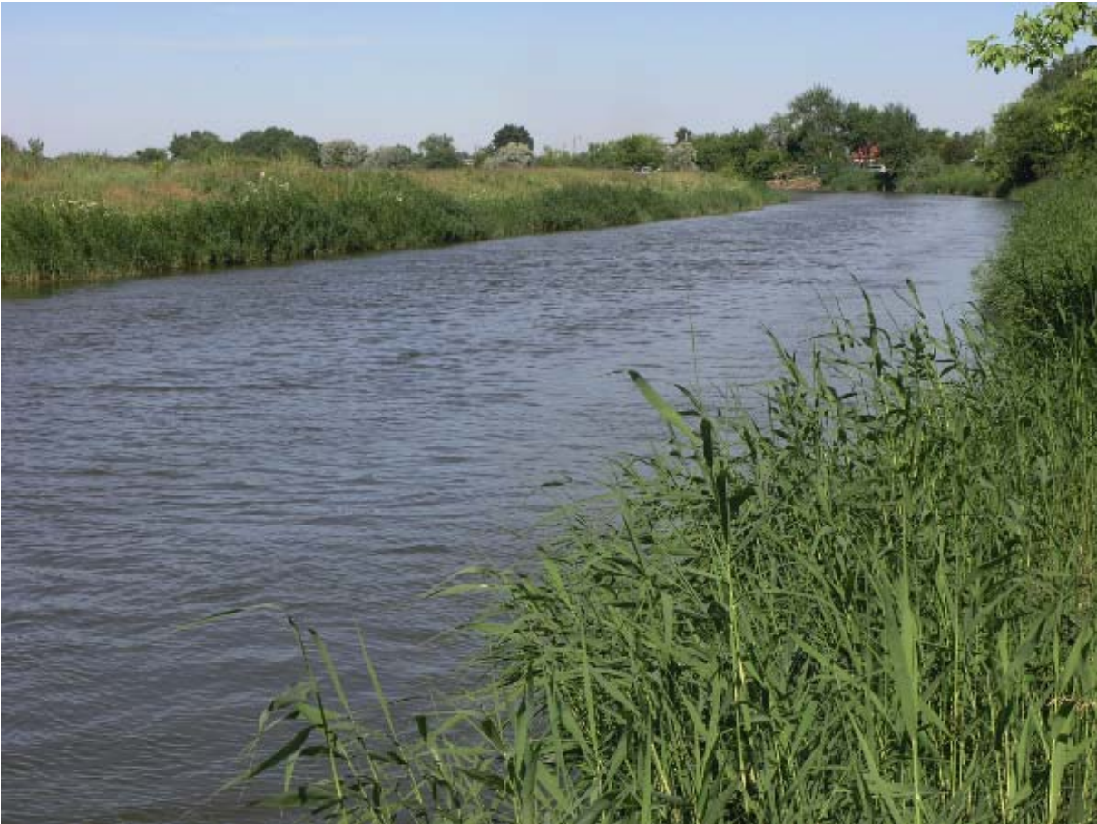
Figure 5. A warm-water channel from the power station to Lake Bol'shoe Beloe (Loc. 5a). 27.06.2015.