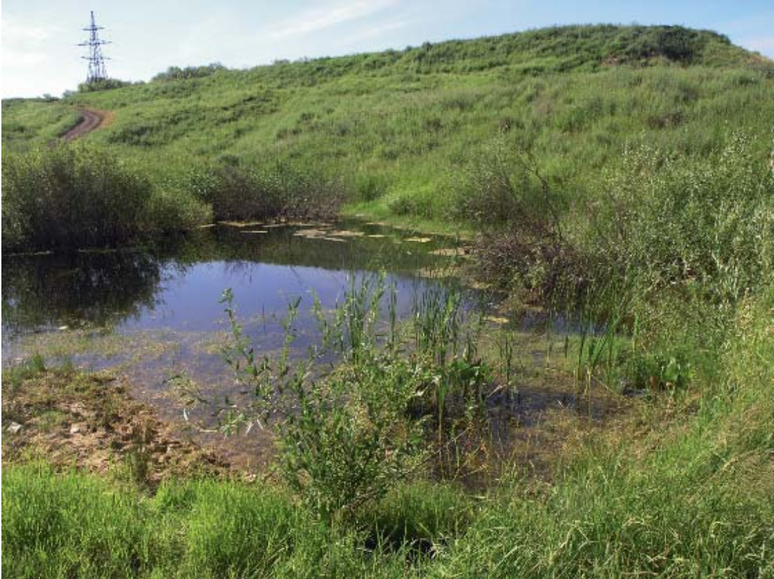
Figure 3. A pool in a fold of the Ishim Right bank (Loc. 1b). 28.06.2015.