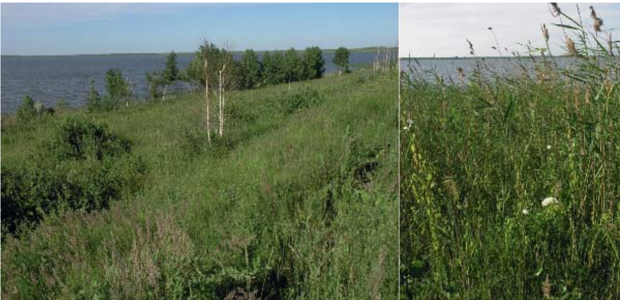
Figure 6. The south-eastern bank of Lake Bol'shoe Beloe (Loc. 6). 27.06.2015.