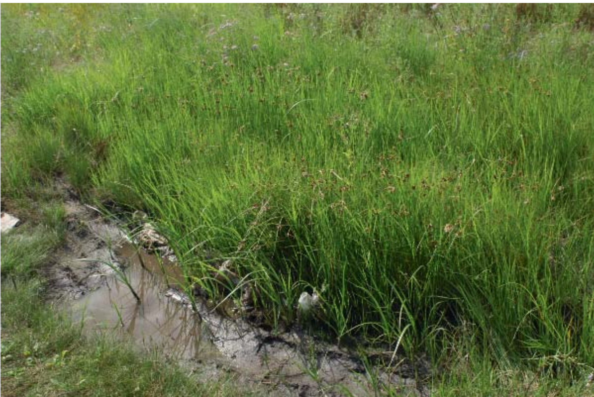
Figure 9. A small marsh with Juncus sp. and Carex sp. at the south-western bank of Lake Pestroe at the Petropavlovsk southern suburbs (Loc. 9), a habitat of Lestes dryas and Sympetrum pedemontanum . 16.08.2015 (left).