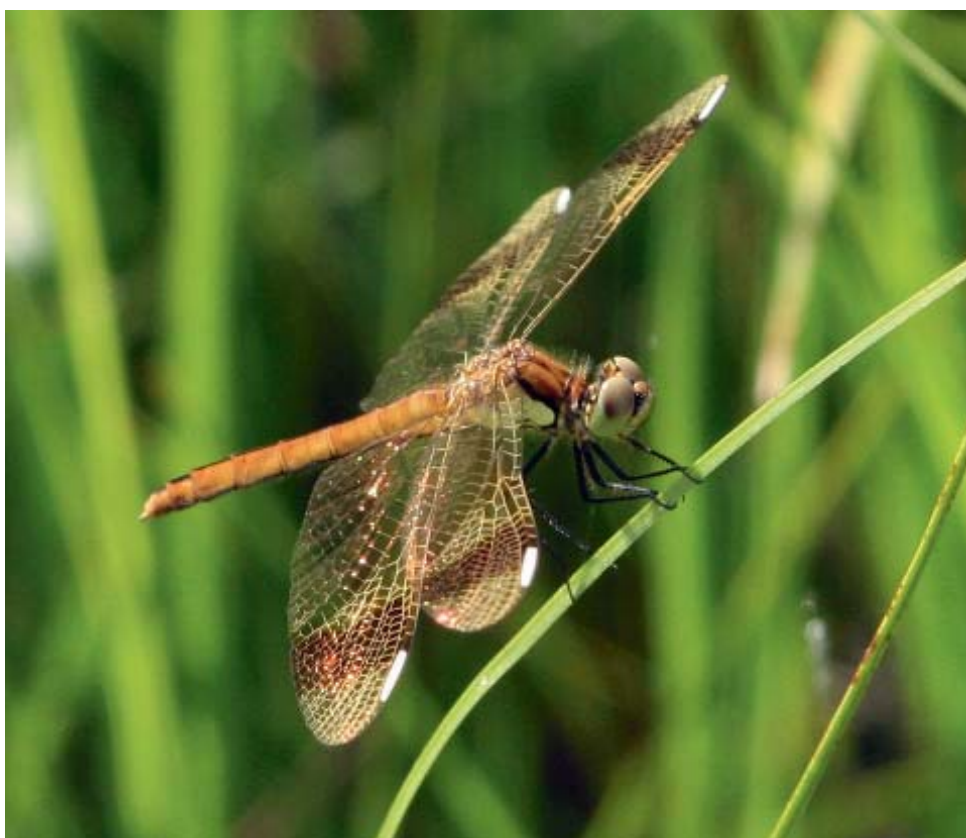
Figure 13. A female of Symptetrum pedemontanum at a small sedgy marsh (Fig. 9) at Lake Pestroe SW bank (Loc. 9), 16.08.2015.