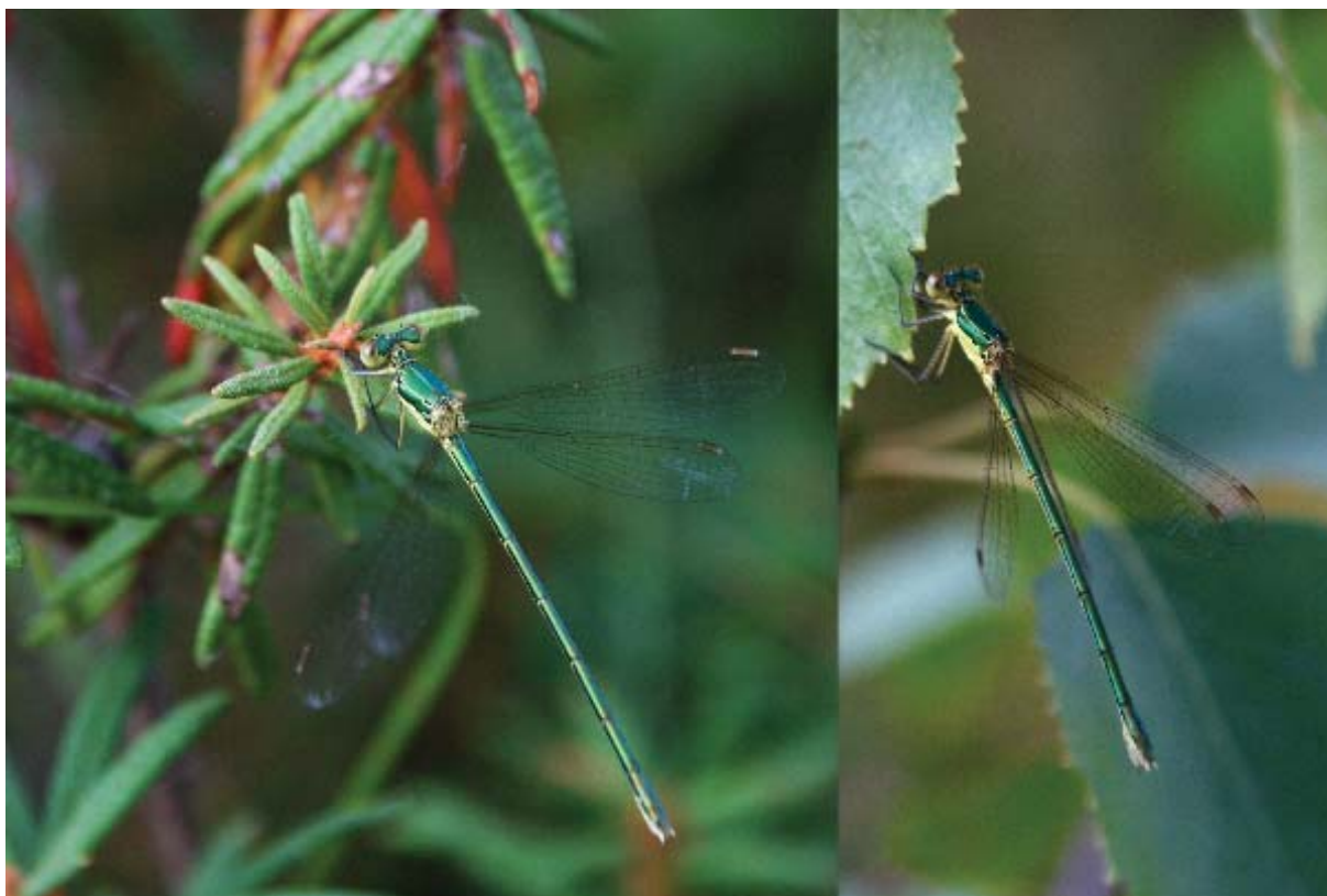
Figure 10. A female of Lestes virens at the raised peat-moss bog with pine (Loc. 6) 3.7 km NE Usmanka village, 15.07.2015.

Loc. 3a: numerous teneral ind., 1 ♂ collected. Loc. 3b: many teneral ind. Loc. 6: 1 ♀ photographed (Fig. 10), several ind. seen. Sympecma paedisca (Brauer, 1877) Loc. 2: 1 ♂ (on the floating bog) released. Loc. 3b: 1 ind seen. Loc. 6: 1 ind. seen.