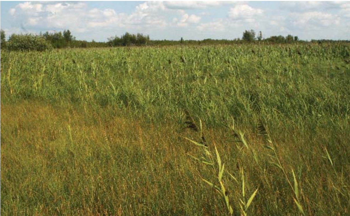
Figure 3. A reed swamp margined by a damp sedge meadow (Loc. 5) at the major Paganay Bog near Usmanka village, a habitat of Lestes dryas , L. barbarus , Coenagrion puella , Aeshna serrata , Sympetrum flaveolum , 15.07.2015.