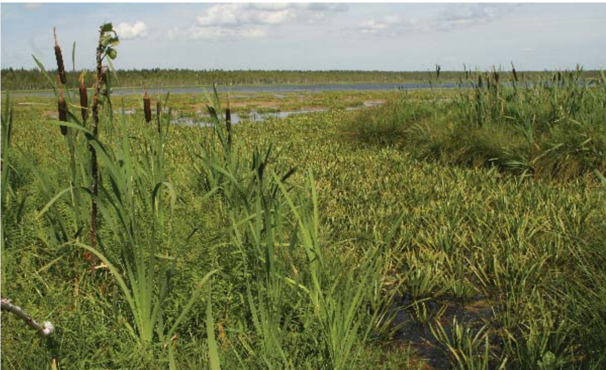
Figure 4. The western water margin of the large Lake Kyshtovo (Loc. 2) at Kyshtovka village, a habitat of Lestes dryas , Sympecma paedisca , Enallagma cyathigerum risi , Aeshna grandis , Libellula quadrimaculata , Sympetrum flaveolum , S. danae , 14.07.2015.