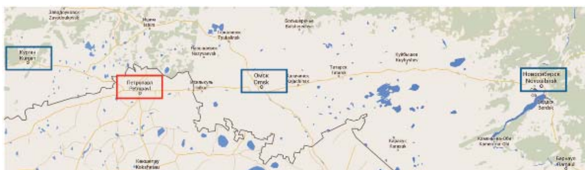
Figure 1: Cities involved in this study or discussion: Blue frame: Kurgan, Omsk, Novosibirsk (Russia); red frame Petropavlovsk (Kazakhstan)

and serving as provincial centres: Kurgan (55°25-30' N, 65-90 m a.s.l., 326 thousand people), Petropavlovsk (54°50-55' N, 95-145 m a.s.l., 208 thousand people), Omsk (54°54'-55°05' N, 70-125 m a.s.l., 1 million 173 thousand people), and Novosibirsk (54°50'-55°07'°N, 90-220 m a.s.l., 1 million 567 thousand people)(Figure 1). These cities respectively reside on the banks of the major rivers of Tobol, Ishim, Irtysh and Ob', and are separated by distances of 273, 278 and 610 km. Presently three of these cities, Kurgan, Omsk and Novosibirsk are in Russia while Petropavlovsk is the northernmost city of Kazakhstan. (Recently Petropavlovsk, named after saints Peter and Paul, was officially renamed to Petropavl but the original Russian name is still in the predominant use even locally.) It would be very interesting to compare data on local fauna and flora of the immediate environs of these four cities to observe an effect of longitude. Unfortunately, they are too unevenly explored.