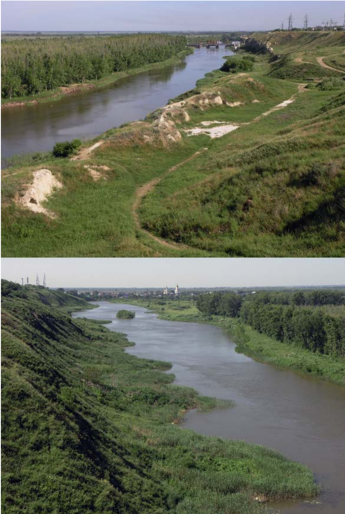
Figure 2. The Ishim River in the northern part of the city of Petropavlovsk (Loc. 1a). 26.06.2015.