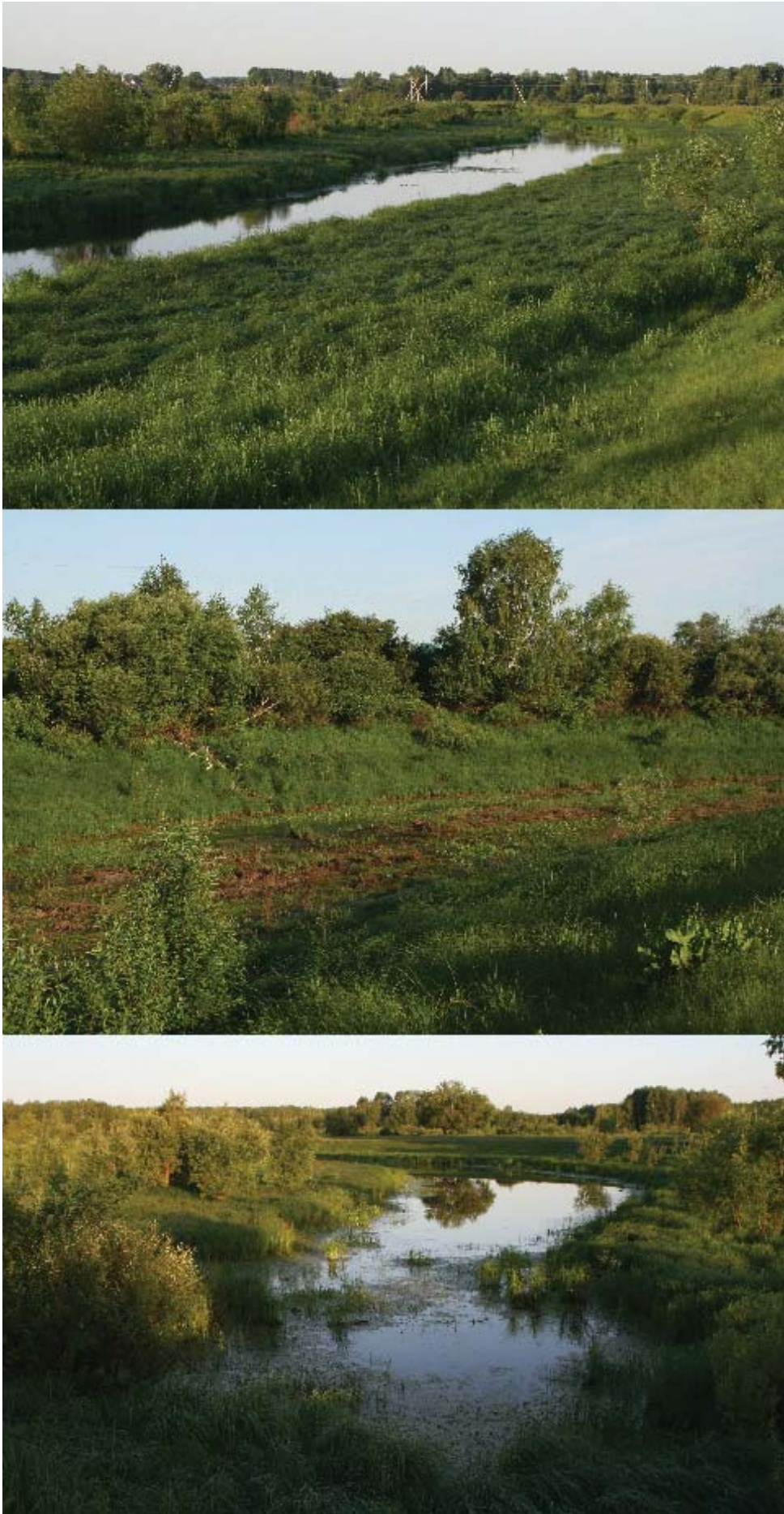
Figure 9. The Tara River right bank oxbows at Kyshtovka village (Loc. 4), habitats of L. sponsa , Aeshna grandis , Somatochlora metallica , ? S. flavomaculata , Libellula quadrimaculata , Symptetrum flaveolum , S. vulgatum , 14.07.2015.