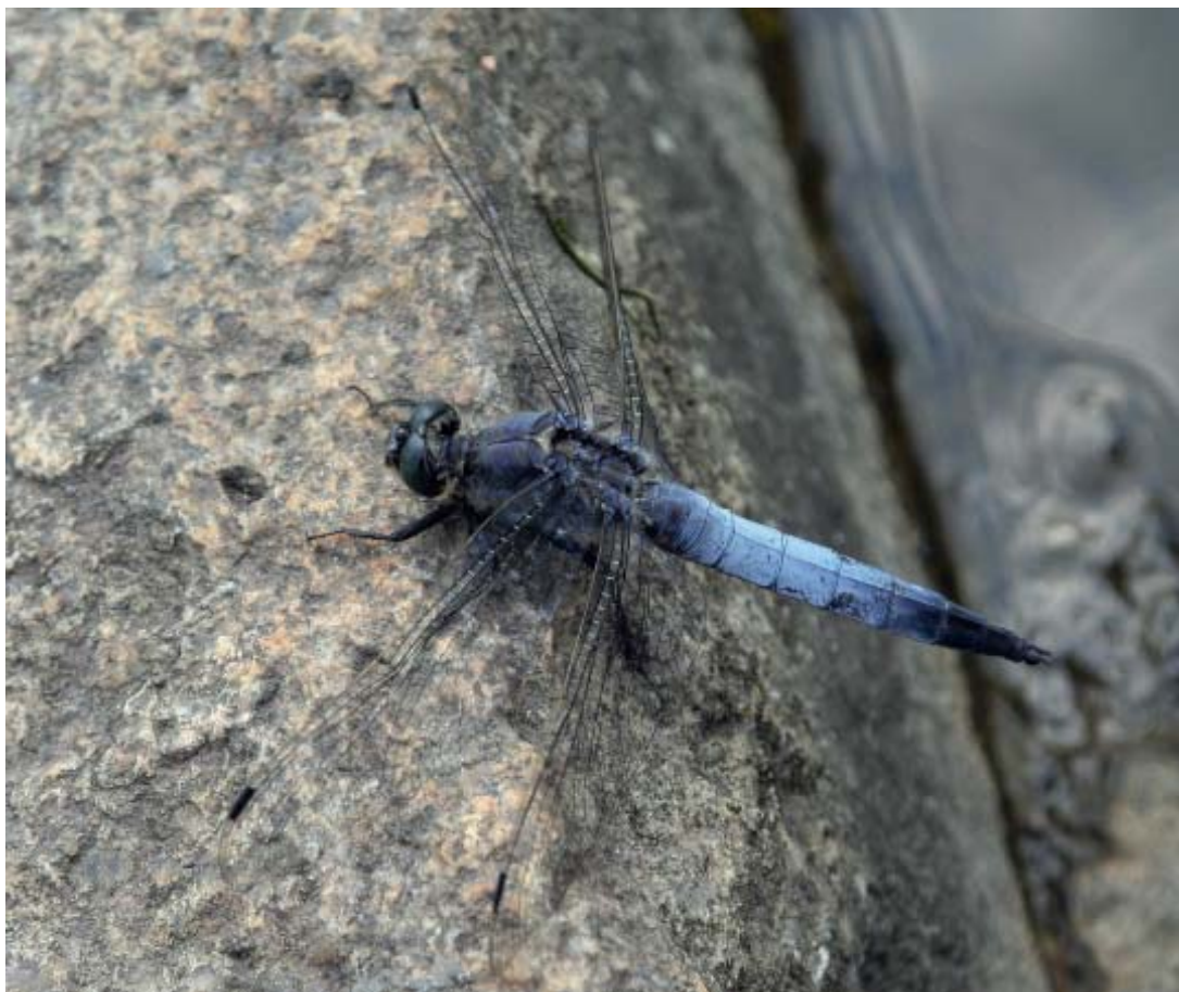
Figure 12. A male of Orthetrum cancellatum at Lake Pestroe SW bank (Loc. 9), 16.08.2015.