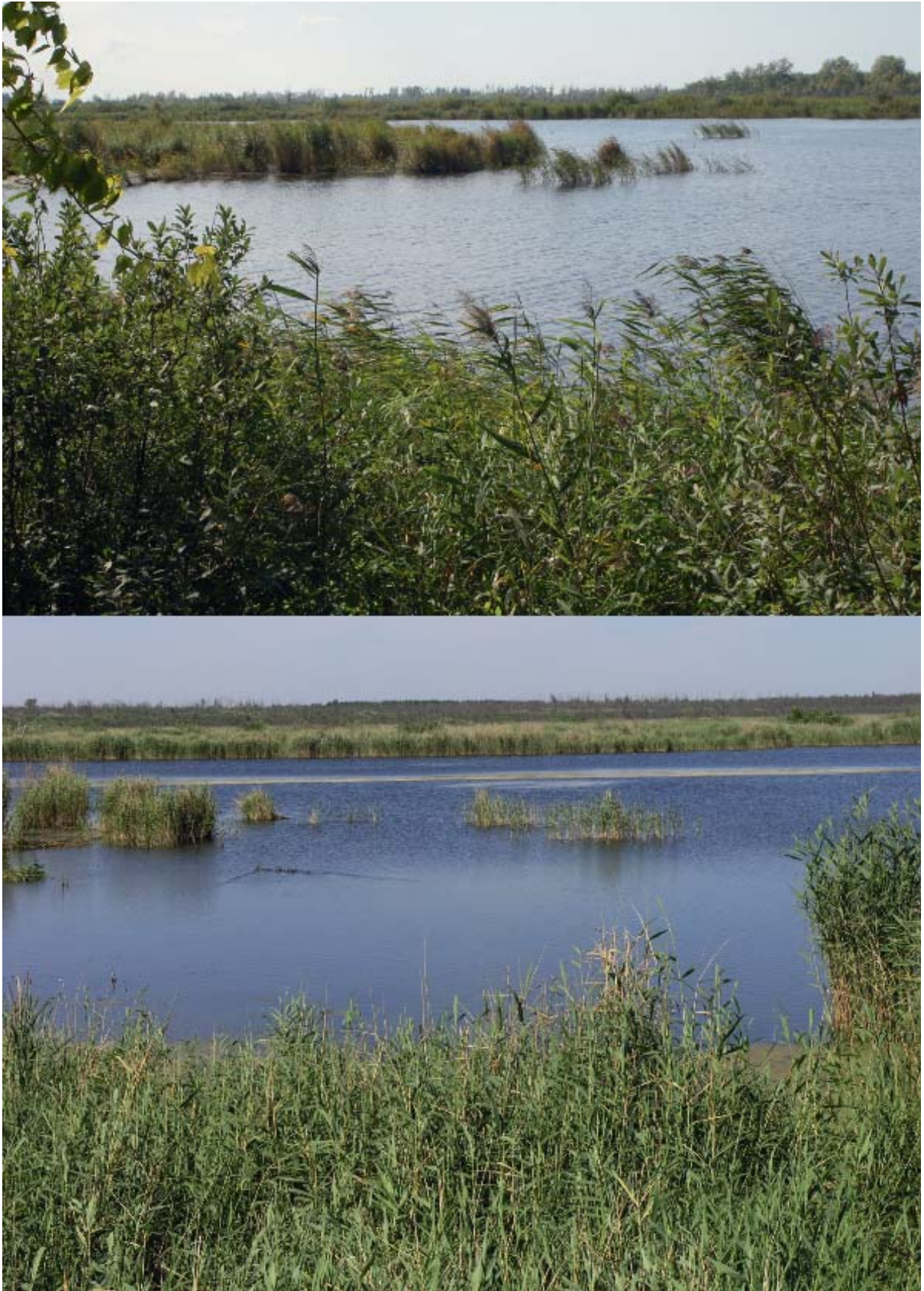
Figure 7. The eastern bank of the Kamenka oxbow lake of the Ishim floodplain (Loc. 7). 28.06.2015 (below) and 16.08.2015 (above).