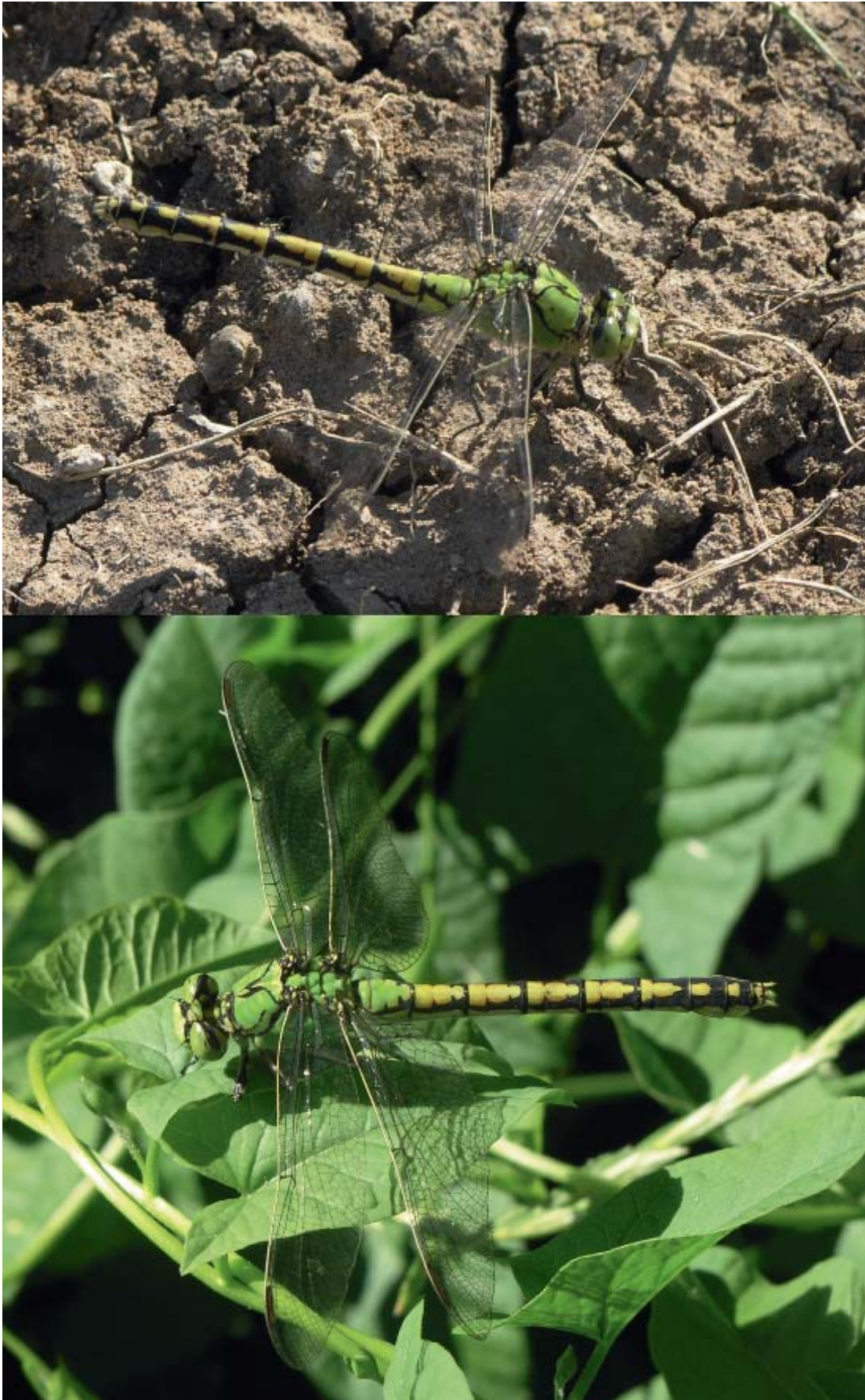
Figure 11. Ophiogomphus cecilia is well camouflaged at any background: females at the Ishim River right bank (Loc. 1a, 28.06.2015 and Loc. 1c, 26.06.2015, respectively).