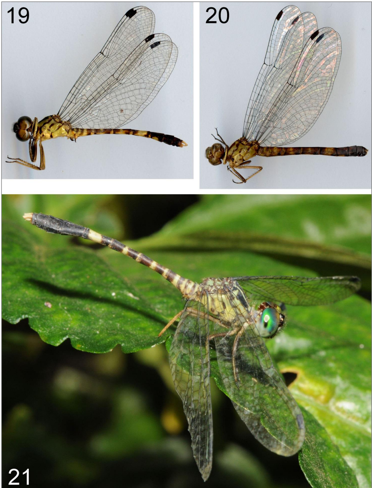
Figs 19-21. Microtrigonia curvata sp. nov., lateral: (19) ♂; (20) ♀; (21) ♂ in life.

labrum (Fig. 13) (line of delimitation almost straight or very widely curved) and dorsal half of anterior frons shiny black; apical portion of mandibles reddish brown to reddish