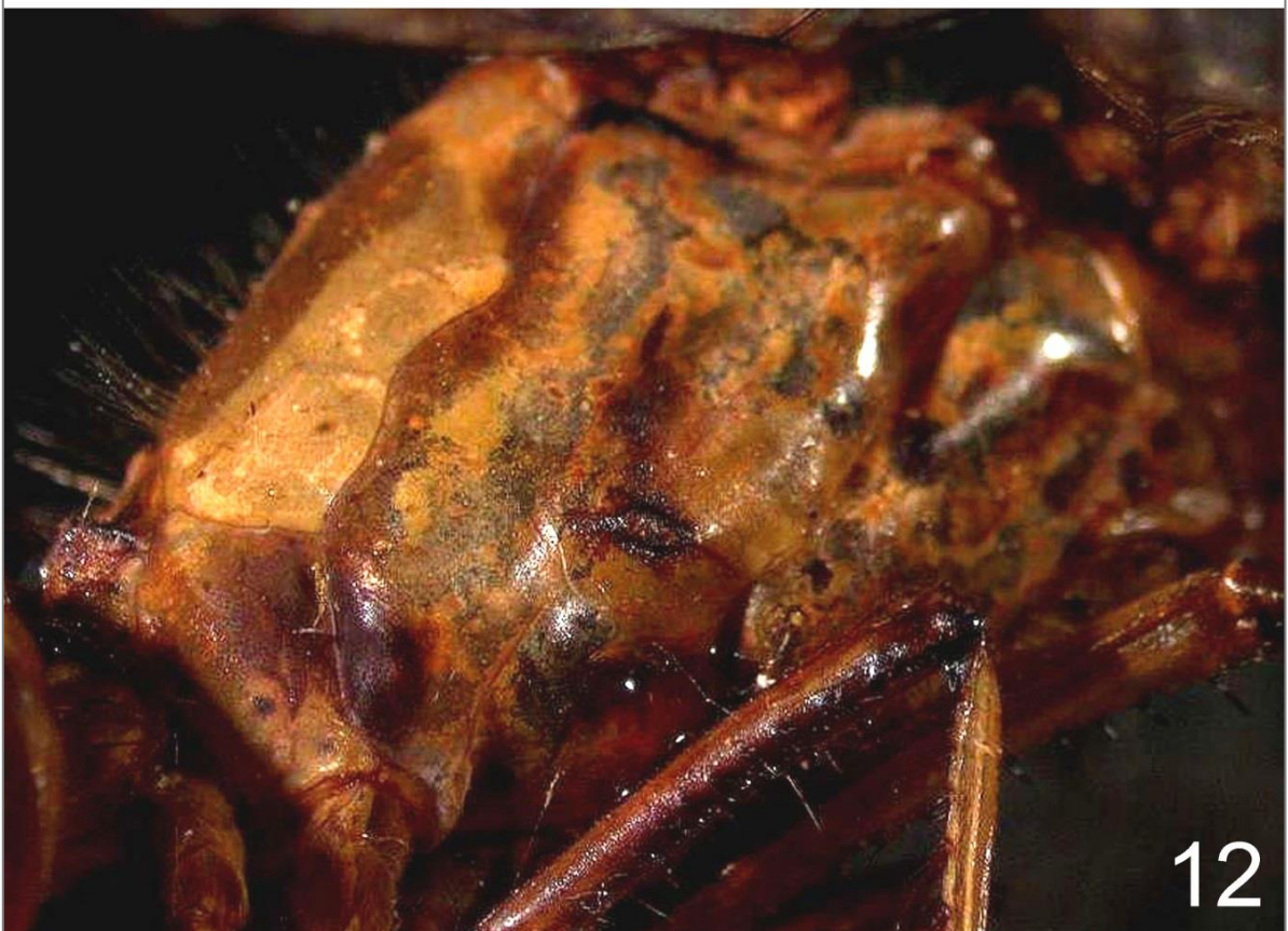
Figs 11-12. Microtrigonia petaurina Lieftinck, Holotype ♀: (11) head, frontal; (12) synthorax, lateral.