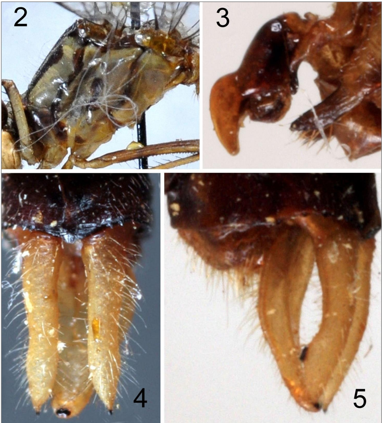
Figs 2-5. Microtrigonia marsupialis Förster, Holotype ♂: (2) synthorax, lateral; (3) secondary genitalia, lateral; (4, 5) anal appendages: (4) dorsal; (5) lateral.