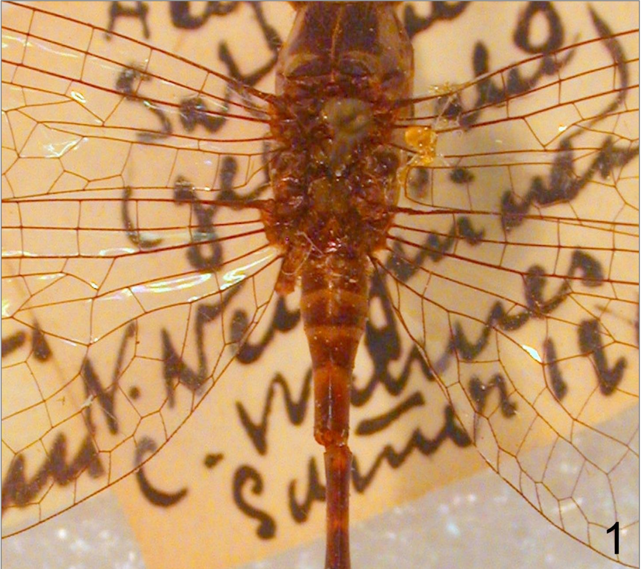
Fig. 1. Microtrigonia marsupialis Förster, Holotype ♂, basal portion of wings, dorsal.

dreieck trapezförmig ist)“, which translated means, 'in the submedian space the only (one) normal cross-vein (same in hindwing the subtriangle of which is trapezi-form)'. This has caused some confusion because generally the proximal side of the subtriangle is counted as the second Cuq, and this explains why Lieftinck's (1933) and Michalski's (2012) keys to the identification of adult Microtrigonia are not working. In addition, the statement “Male type lost, not illustrated” in Michalski (2012) is incorrect.