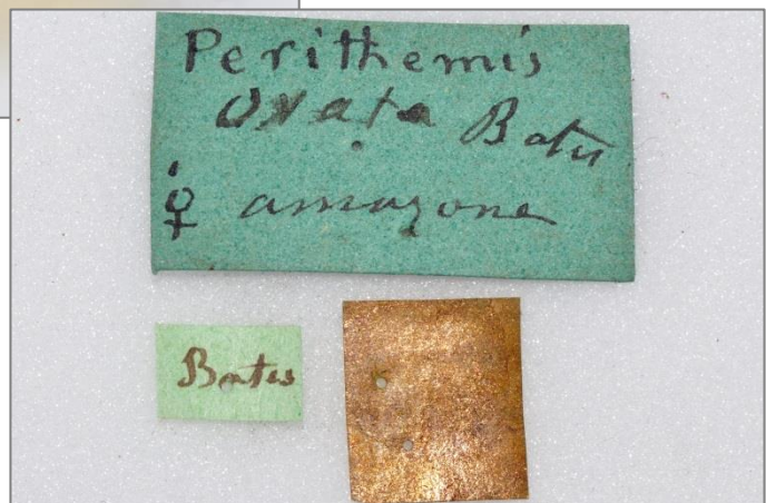
Fig. 6: Female Perithemis bella Kirby, 1889 collected by Henry Walter Bates. Originally labeled as Perithemis ovata Bates (manuscript name) by M. E. de Selys Longchamps.