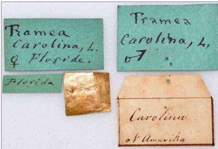
Fig. 7: Original labels by M. E. de Selys Longchamps of two Tramea carolina (Linnaeus, 1763) specimens at the UMB. Left side from the duplicate collection sent in April 1875 to Bremen and on the right side a specimen just re-determined by Selys (Label above by Selys, below of an unknown person).