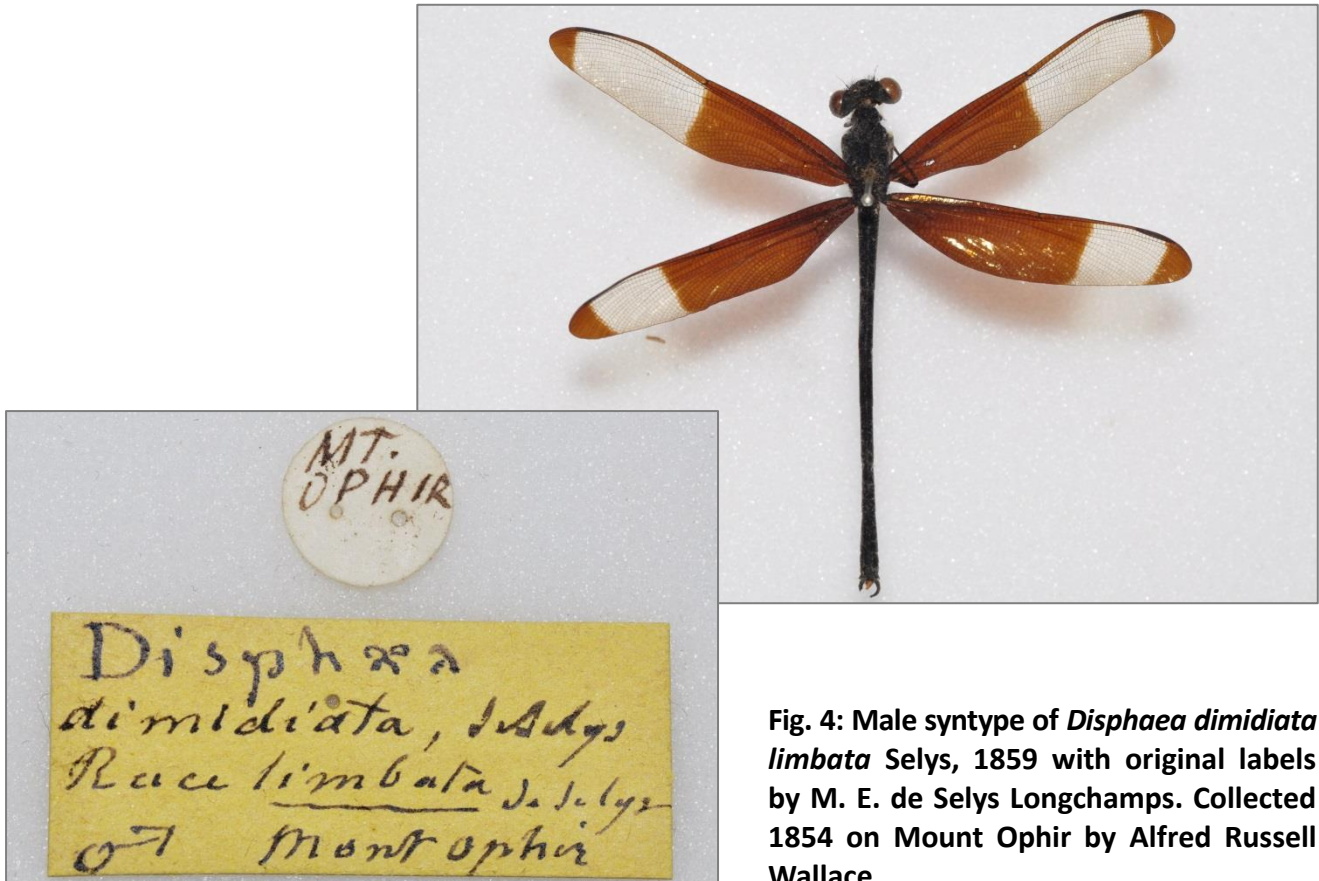
Fig. 4: Male syntype of Disphaea dimidiata limbata Selys, 1859 with original labels by M. E. de Selys Longchamps. Collected 1854 on Mount Ophir by Alfred Russell Wallace.