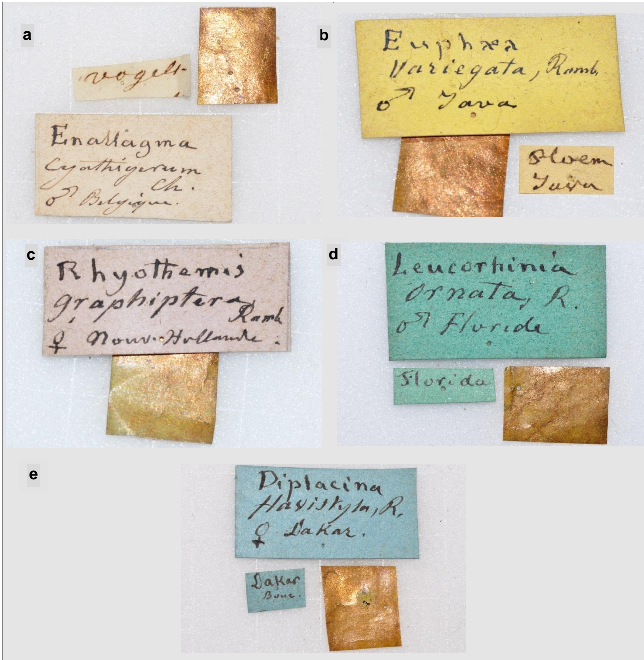
Fig. 1: Original labels of M. E. de Selys Longchamps (a = Europe, b = Asia, c = Australia, d = America, e = Africa).

(Natural Science Association Bremen) was established in 1864 and cared for the collections until they were transferred to the urban property of the city of Bremen in 1875. Presently there are more than 3000 Odonata in the entomological collection.