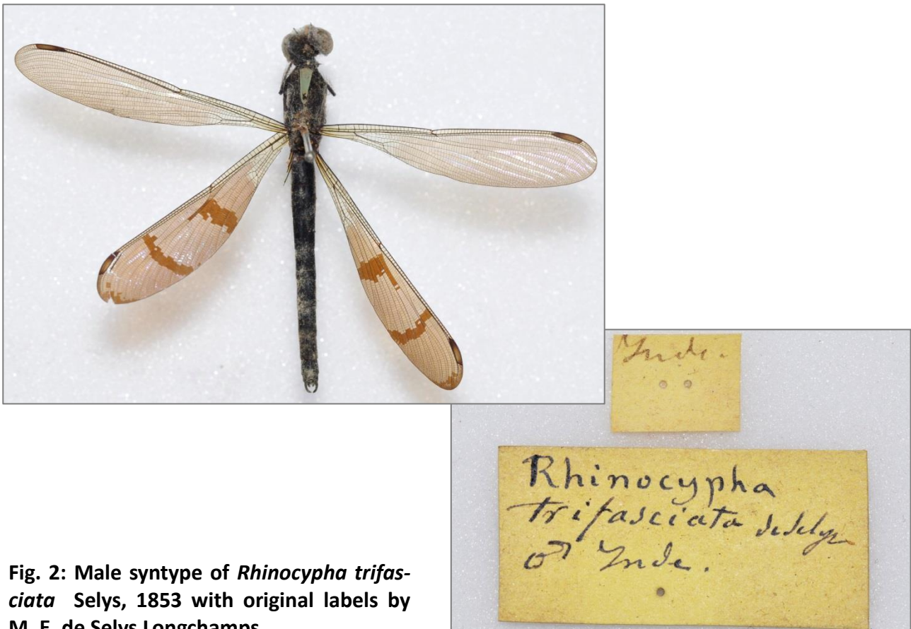
Fig. 2: Male syntype of Rhinocypha trifasciata Selys, 1853 with original labels by M. E. de Selys Longchamps.