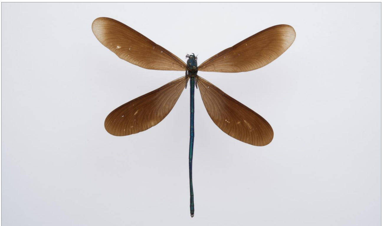
Fig. 1: Male Matrona basilaris from Hong Kong preserved at the Übersee-Museum Bremen (Germany).