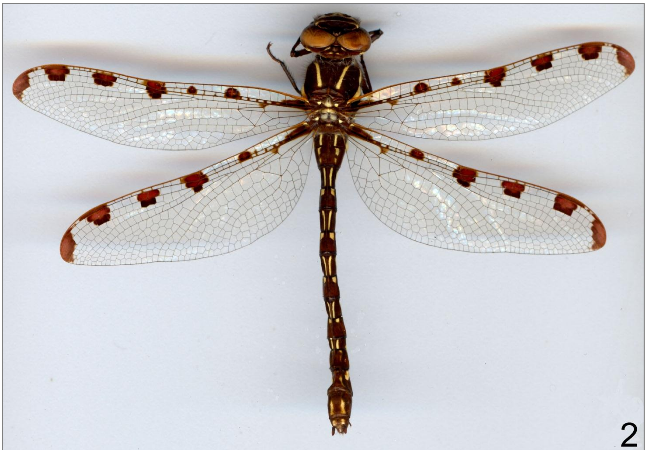
Figure 2: Austropetalia patricia Tillyard, female specimen, dorsal view.

duced or lacking pale markings on labrum, vertex and abdominal segment 10, and the black, tapered pterostigma. It is interesting that A. annaliese is apparently closer to A. tonyana from the Australian Alps and further south than to A. patricia which is centered in the Blue Mountains. It is probably geographically separated from A. patricia only by the Hunter River valley, whereas a large area between somewhat north of Canberra and the Hunter River valley (= approximate distributional range of A. patricia ) apparently separates it from A. tonyana . Both, the northern limit of the southern highlands and the southern margin of the northern tablelands of New South Wales are regions where ecological and physiographic boundaries are known to coincide with taxonomic discontinuities in numerous Australian freshwater insects including Odonata (Watson & Theischinger 1984), but usually with the immediate neighbour species most closely related to each other.