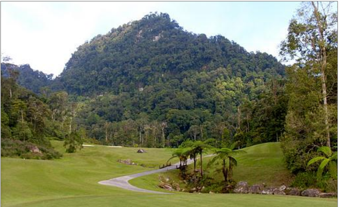
Fig. 2: Golf course with view to Mt Penrissen ( http://lh6.ggpht.com/-PHc7cvQwas4/TpZTRCarOqI/AAAAAAAAAP0s/olbAFvmu0sc/penrissen%2525202.JPG ).