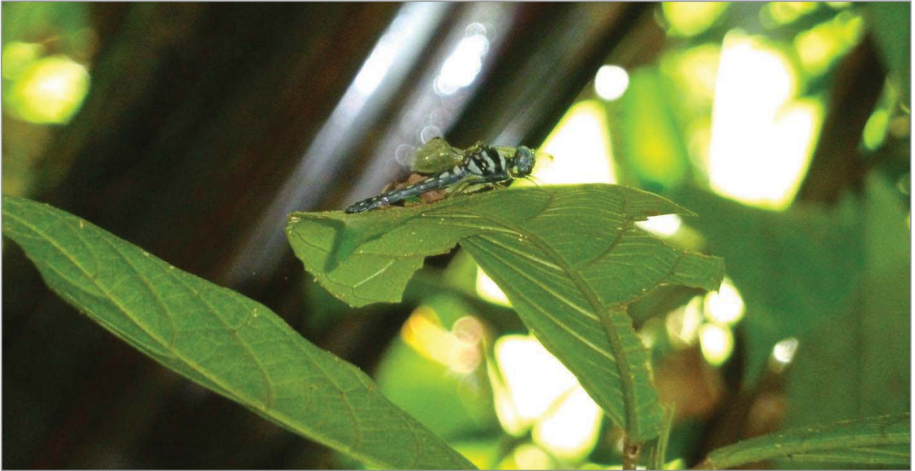
Figure 45. Diplacina lisa female.