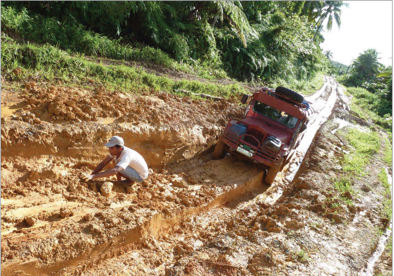
Figure 5. Traveling on poorly maintained road. Note the difference between road in mining area and government managed road like this.