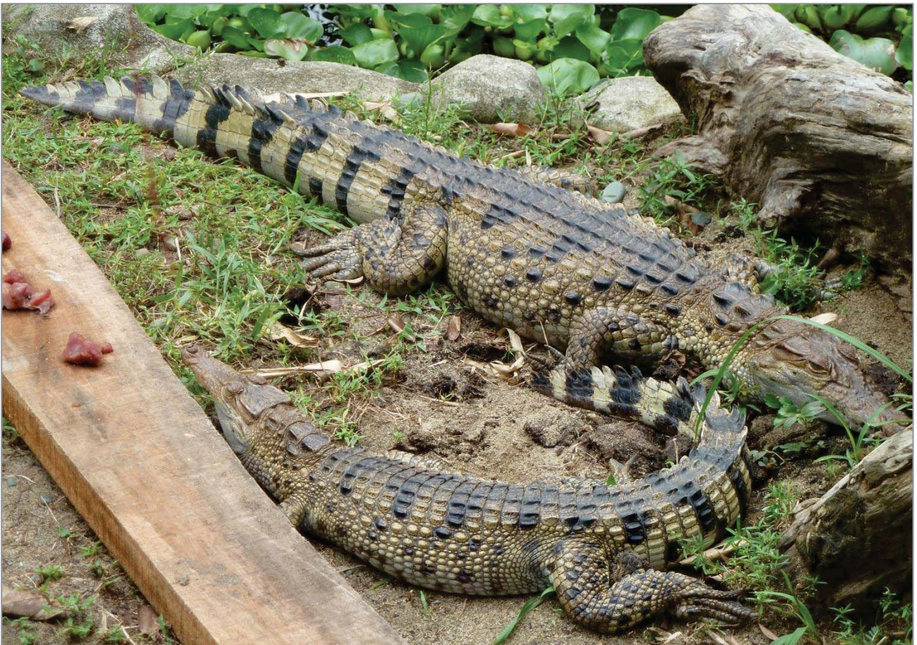
Figure 15. Crocodylus mindorensis (Philippine crocodile).