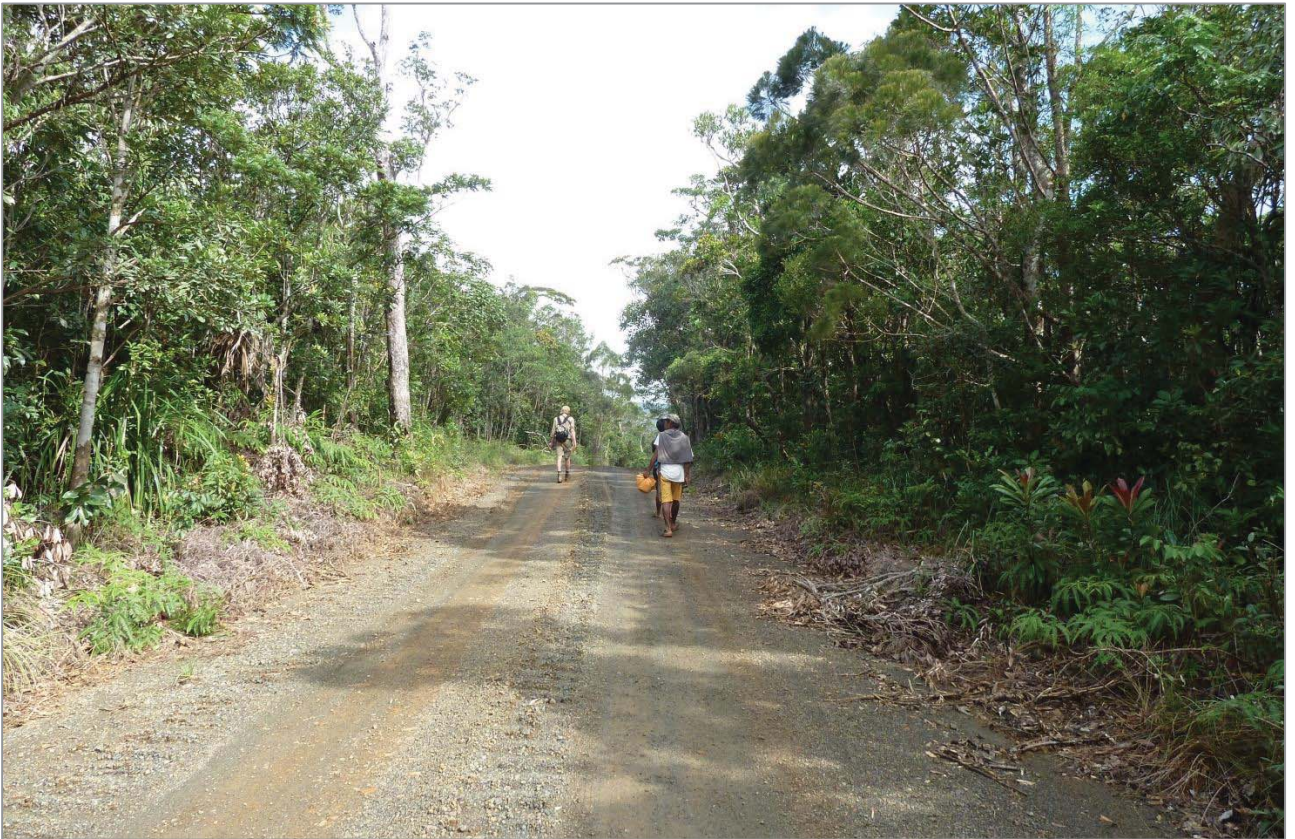
Figure 7.a – b. New road constructions. This opens the mountain and allows the flow of settlers thus facilitating the rapid destruction of the forest.