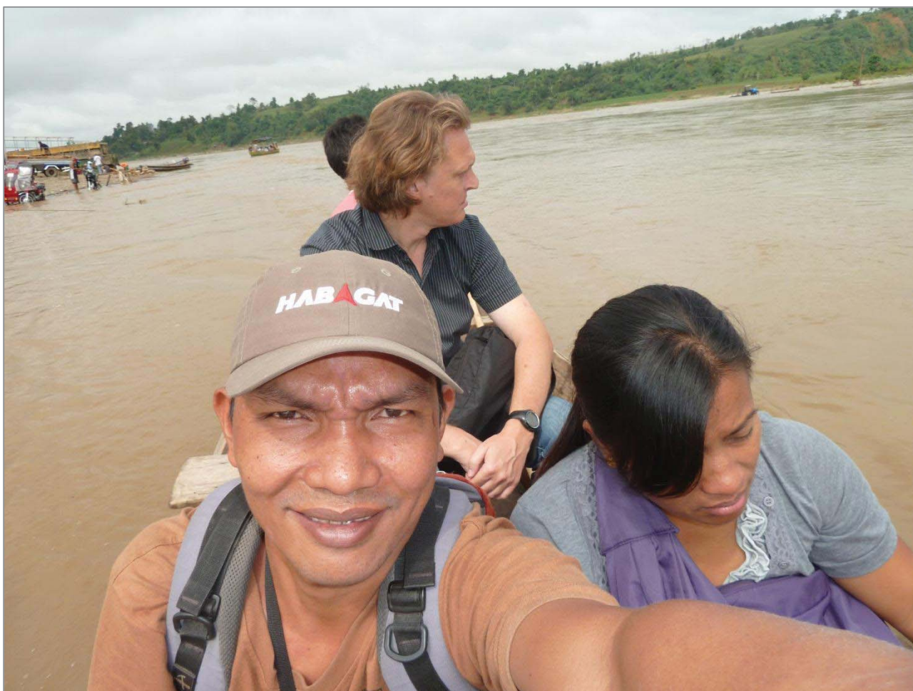
Figure 12. Third author in front while the second author at the back crossing the river in San Mariano.

The second author is presently working on the conservation of some threatened vertebrate species particularly the Philippine Crocodile ( Crocodylus mindorensis ) (Figure