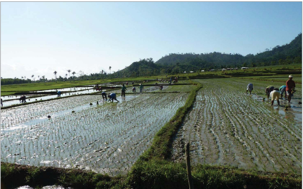
Figure 6. Converting swamp into rice fields.