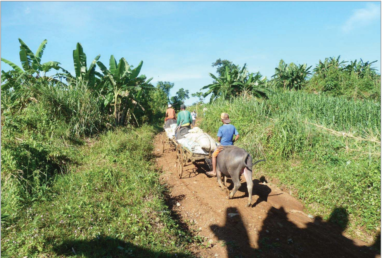
Figure 4. a - b. Traveling on top of water buffalo.