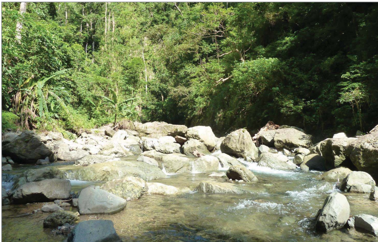
Figure 17. River in Dinapigue, Isabela Province.