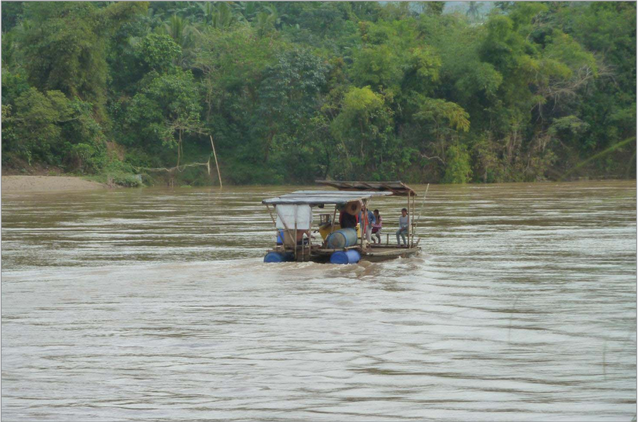
Figures 3 a. Traveling on modified boat on one of the tributaries of Cagayan River.