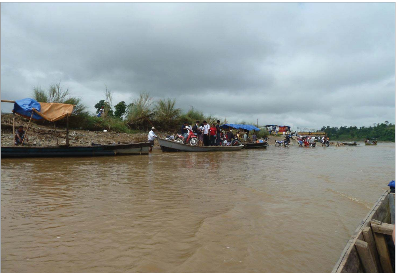
Figures 3 b. Modified wharf in the river.