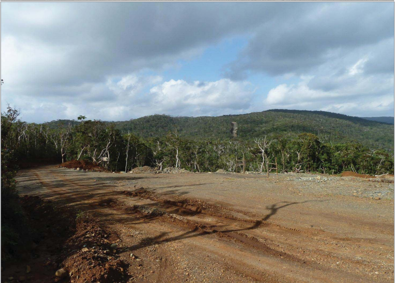
Figure 9. a. Mining road, b. mining road cut through the ultramafic forest.