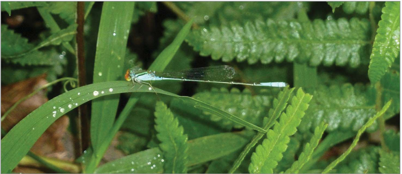
Figure 41. Pseudagrion r. rubriceps male.

Recorded: Dilasag swamp, Dilasag, Aurora, Luzon Is.