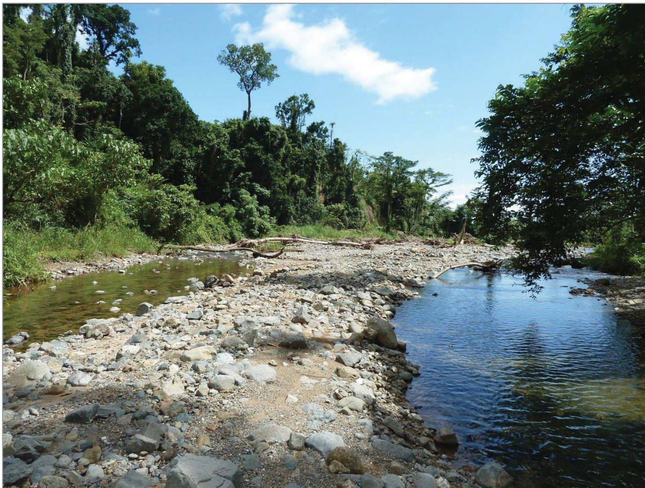
Figure 28. Preferred habitat of Neurobasis luzoniensis .

Habitat (Figure 28): This species is found on open to partly open streams and rivers. Trees around the stream bank do not shade the stream thus the water is exposed to full sunlight. The water is usually shallow and males are frequented perching on protruding rocks along the waterways. The females on the other hand are seen along the nearby vegetation.