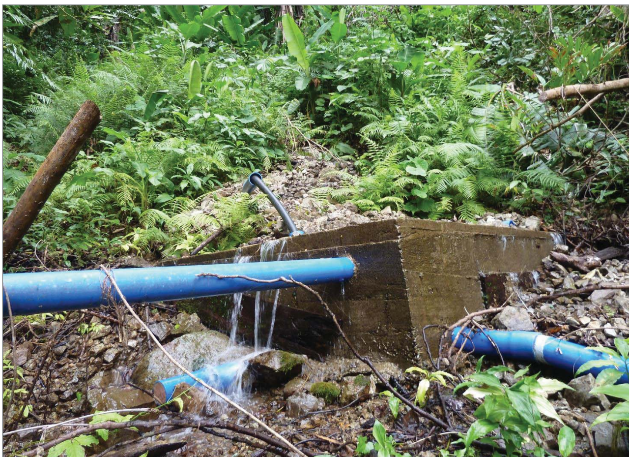
Figure 18: Head waters of Dibulo falls.