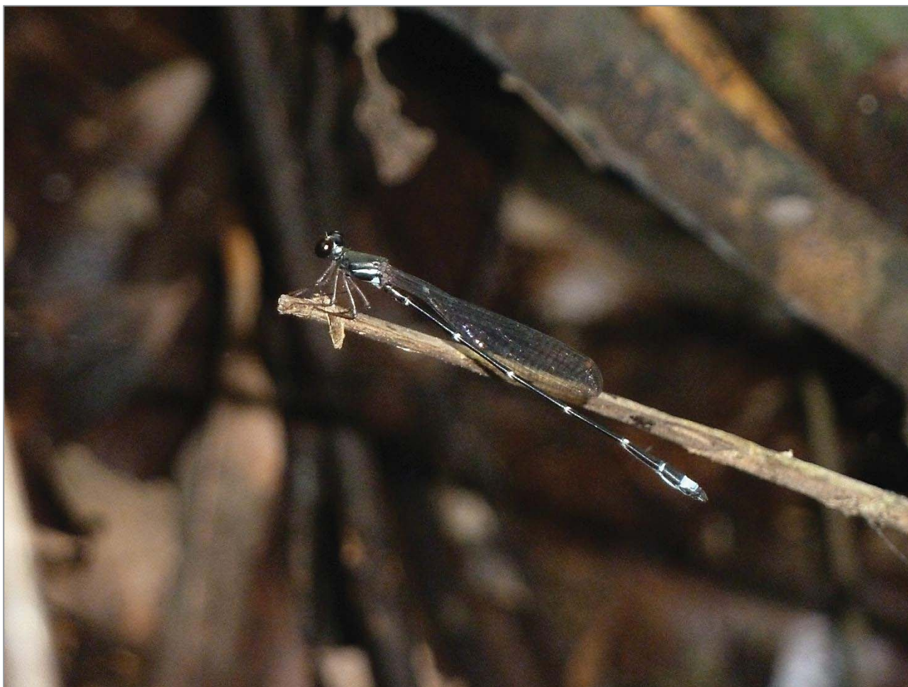
Figure 30. Drepanosticta hamalaineni male.

Remark: This species was previously only known from the type material collected in Palanan (Dipinantahikan area, Dipagsangaan, 16°53'39"N, 122°20'47"E). This locality is situated north of Dinapigue of about 25km. The present data provides an extension of the known range.