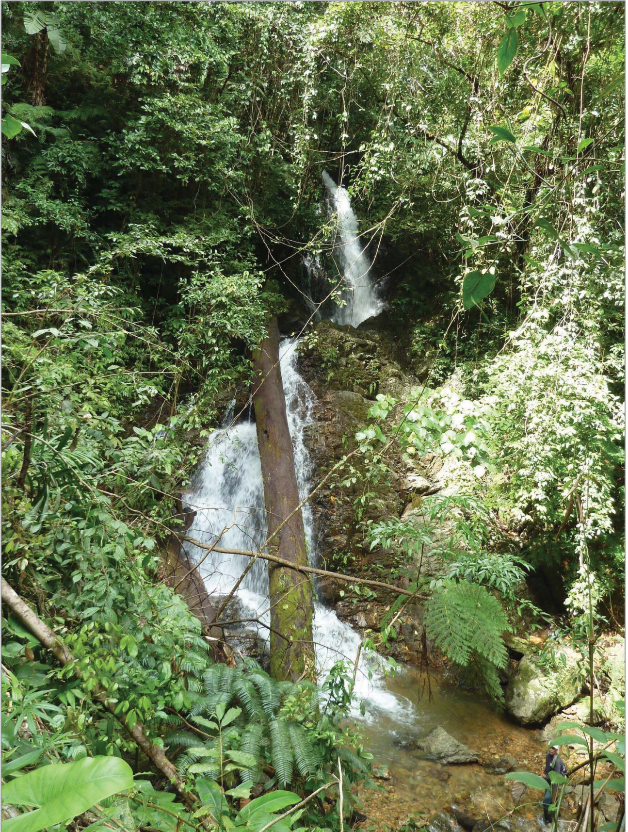
Figure 23: Head water of Malat River, Burdeos, Polillo island.