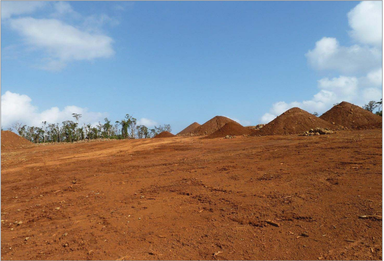
Figure 10. Nickel Ore stockpile.