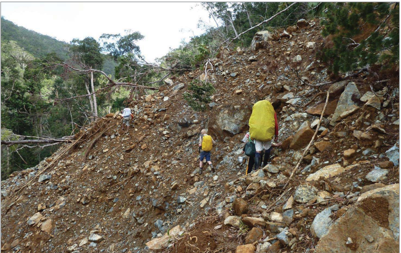
Figure 2. Trekking across steep slope of ultramafic forest.