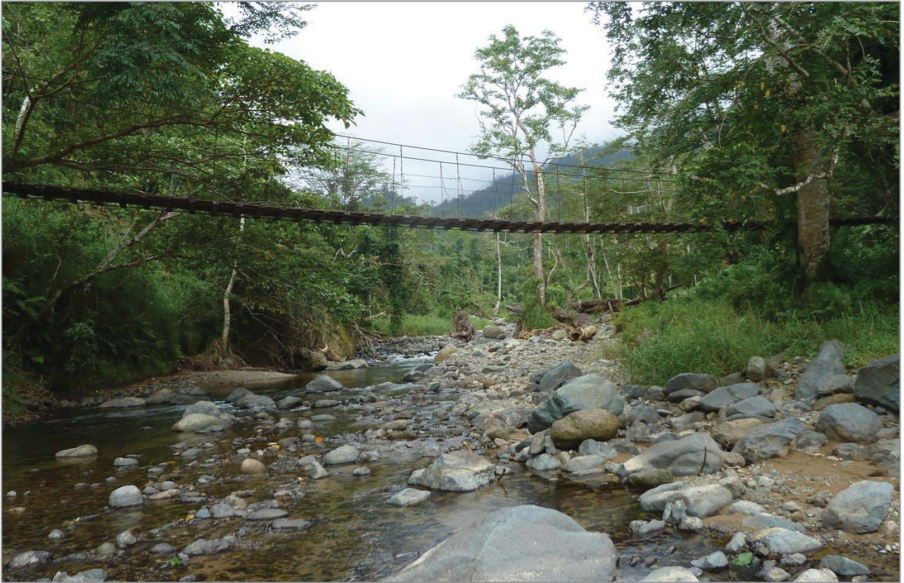
Figure 19: Shallow river in Casiguran, Aurora Province.