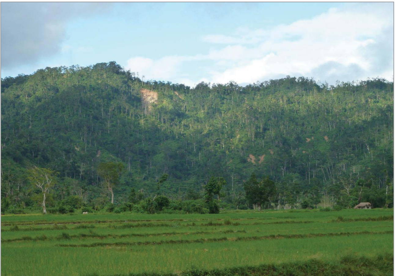
Figure 20: Rice field in Casiguran, Aurora province.