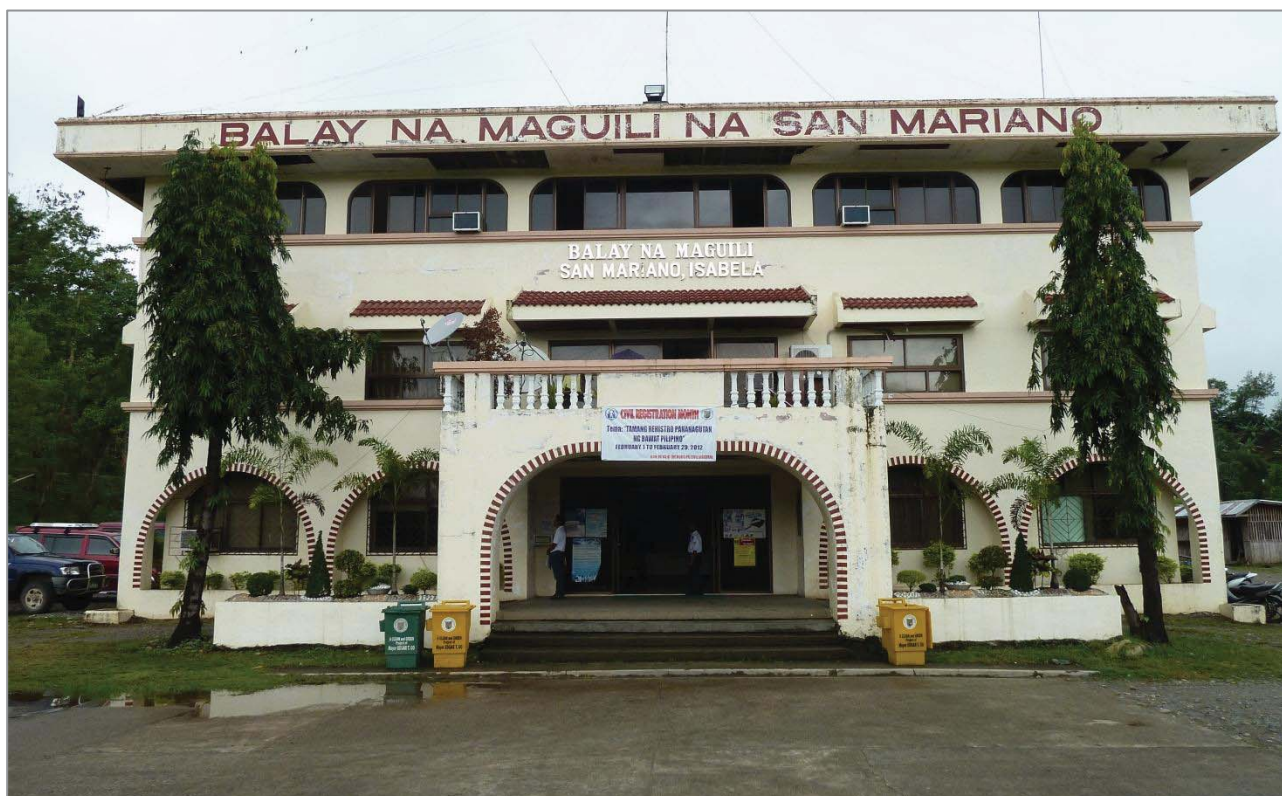
Figure 27. Municipal Hall of San Mariano, Isabela Province.