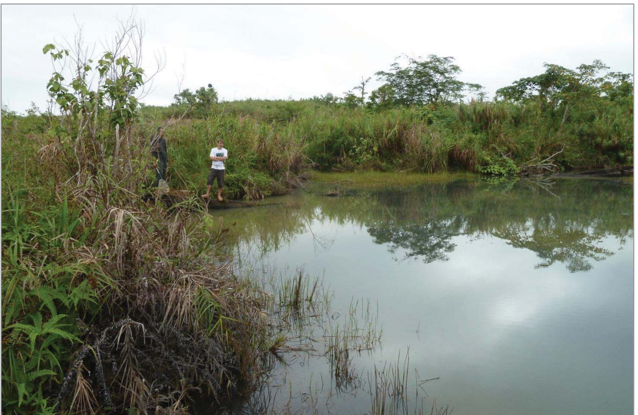
Figure 40. Habitat of the new Paracercion .