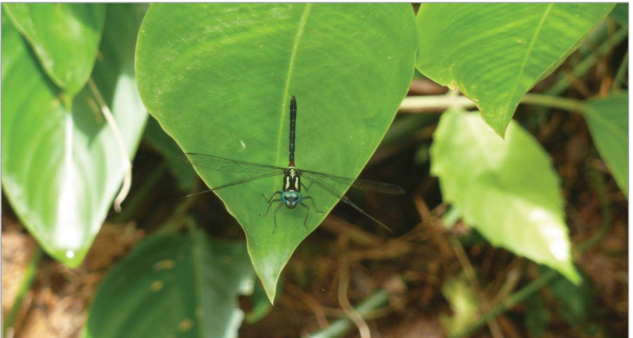
Figure 46. Diplacina holgerhungeri male.

Remark: Two males of this most recently described species of Diplacina (Villanueva 2012) were found. This species was previously mentioned (Villanueva, 2010a; Villanueva, 2010b) under Diplacina bolivari yet present study shows that the material previously labelled as D. bolivari from Polillo belong to two taxa ( D. bolivari and a new species).