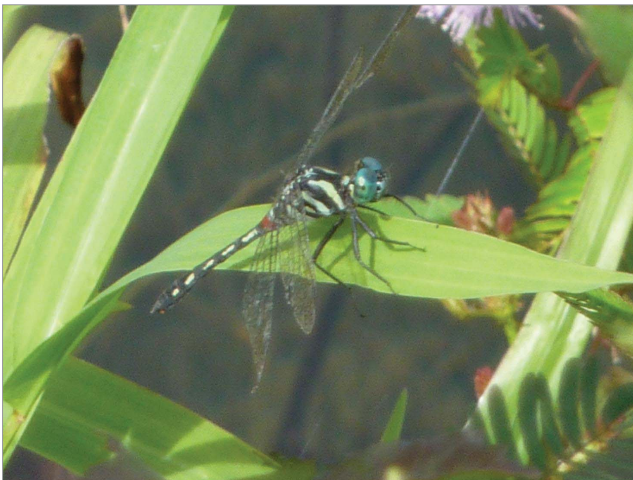
Figure 44. Diplacina braueri male.

Recorded: Malat River, Burdeos, Polillo Is.