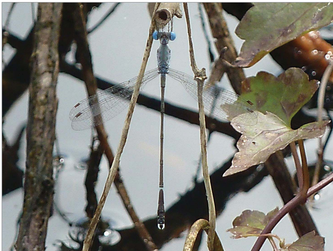
Figure 29. Lestes praemorsus praemorsus male.

Habitat: This species shares the same habitat with Neurobasis luzoniensis .