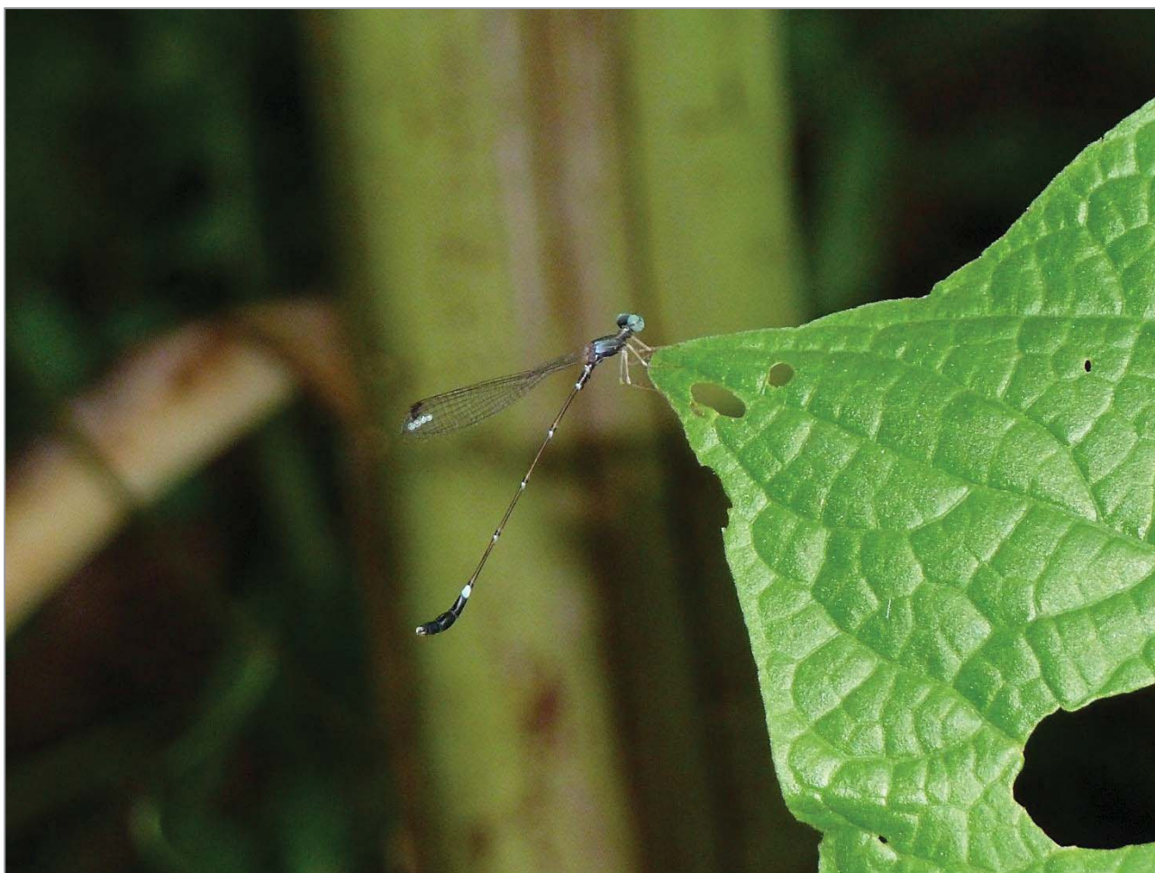
Figure 31. Sulcosticta sp. male.

Remark: A single male was found. The posterior pronotal lobe resembles those of S. pallida van Tol 2005, a species recorded in the nearby province of Nueva Vizcaya. These two species however differ markedly on the structure of the cerci and paraprocts.