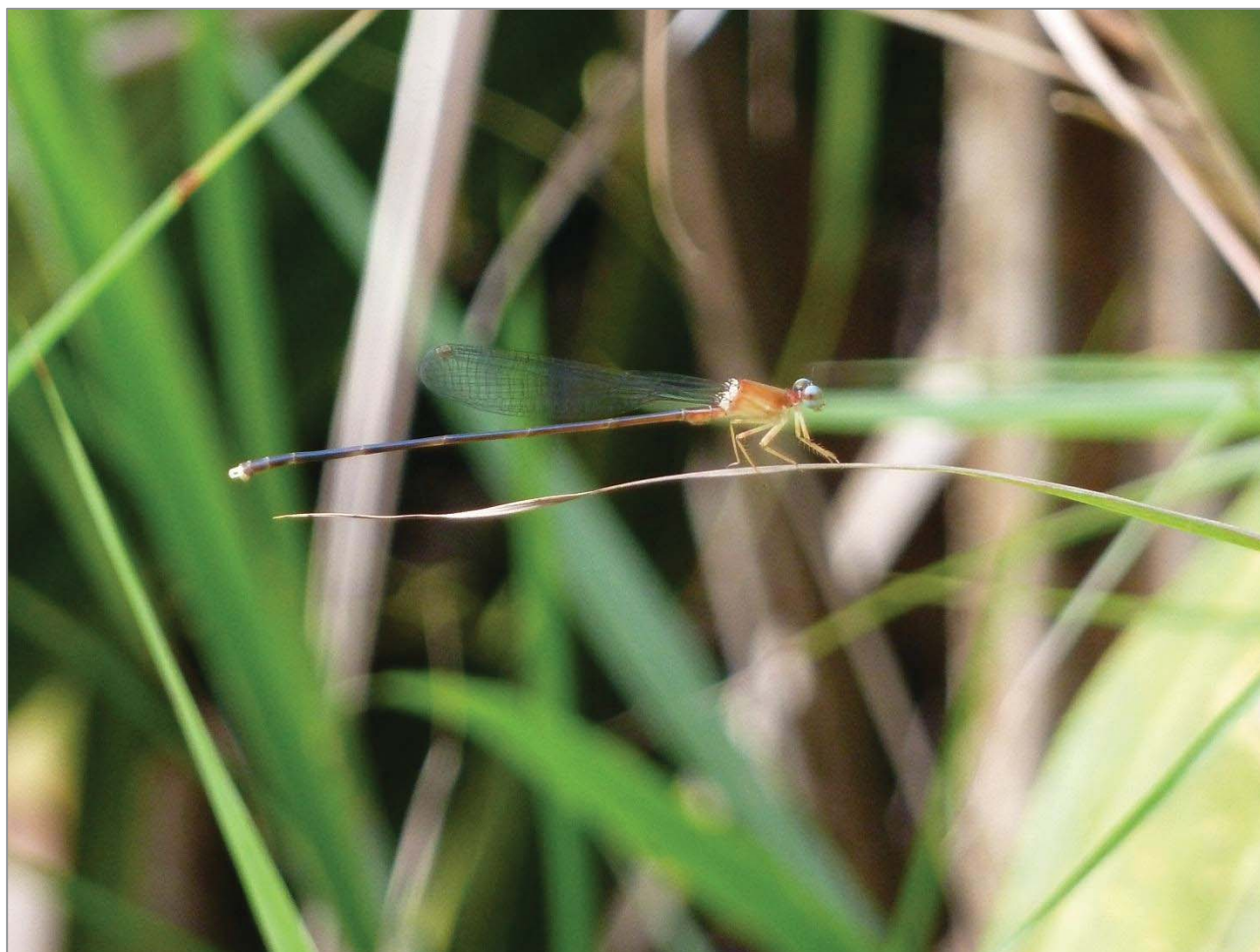
Figure 36. Amphicnemis sp.n. male.

Remark: The present species is close to Amphicnemis mcgregori Needham & Gyger, 1939. However, it is clearly distinct from that species. (Villanueva, in press) treated the genus Amphicnemis , regrettably the new find could not be integrated in this review paper.