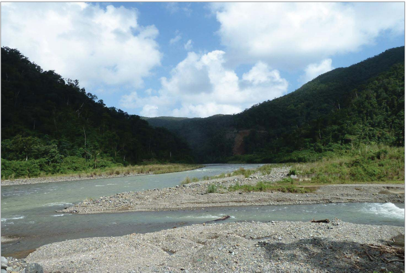
Figure 15 a–b. Sierra Madre Mountain range.