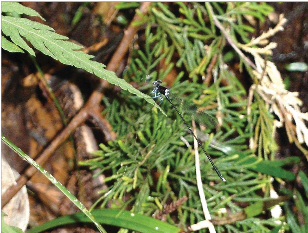
Figure 32. Risiocnemis atropurpurea male.

Recorded: Malat River, Burdeos, Polillo Is.; Mining site, Dimaluad, Dinapigue, Isabela, Luzon Is.; Dibulo creek, Dibulo, Dinapigue, Isabela, Luzon Is.