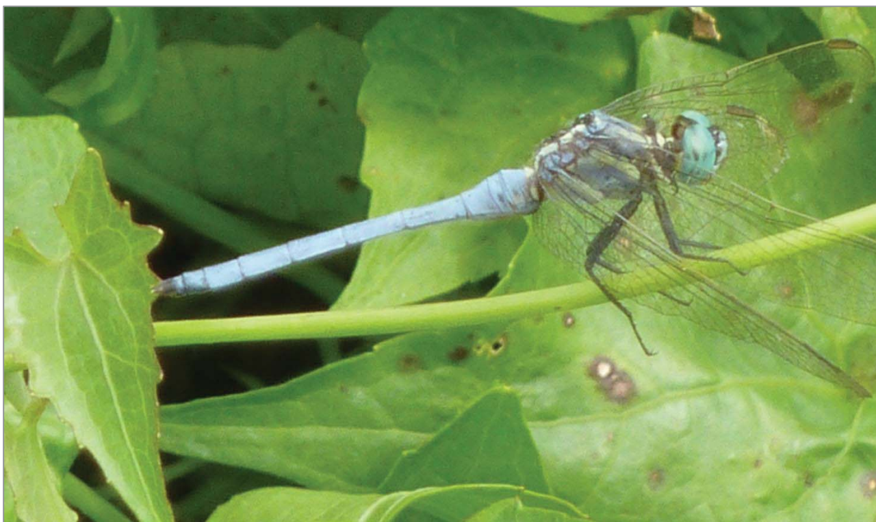
Figure 48. Orthetrum luzonicum male.

Recorded: Dunoy Lake, Brgy. Disulap, San Mariano, Isabela, Luzon Is.