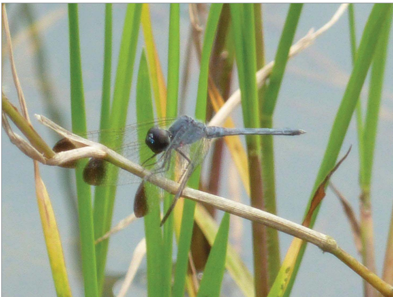
Figure 47. Diplacodes nebulosa male.

Remark: The present material represents the latest documentation of this species in Luzon after 70 years. This species is relatively rare in the site. However, given a good weather and more field hours more specimens can be secured.