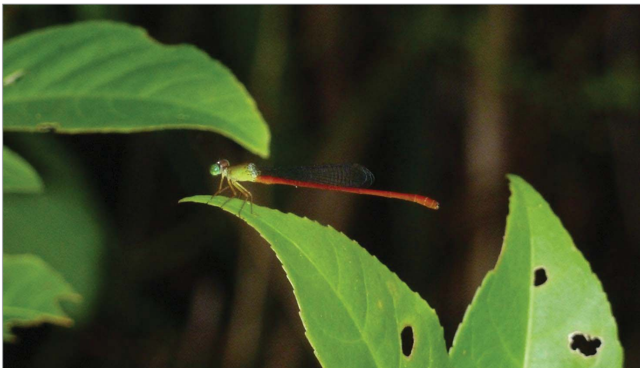
Figure 37. Ceriagrion lieftincki male.

Recorded: Narra Lake, Brgy. Disulap, San Mariano, Isabela, Luzon Is.; Dunoy Lake, Brgy. Disulap, San Mariano, Isabela, Luzon Is.; Dilasag swamp, Dilasag, Aurora, Luzon Is.