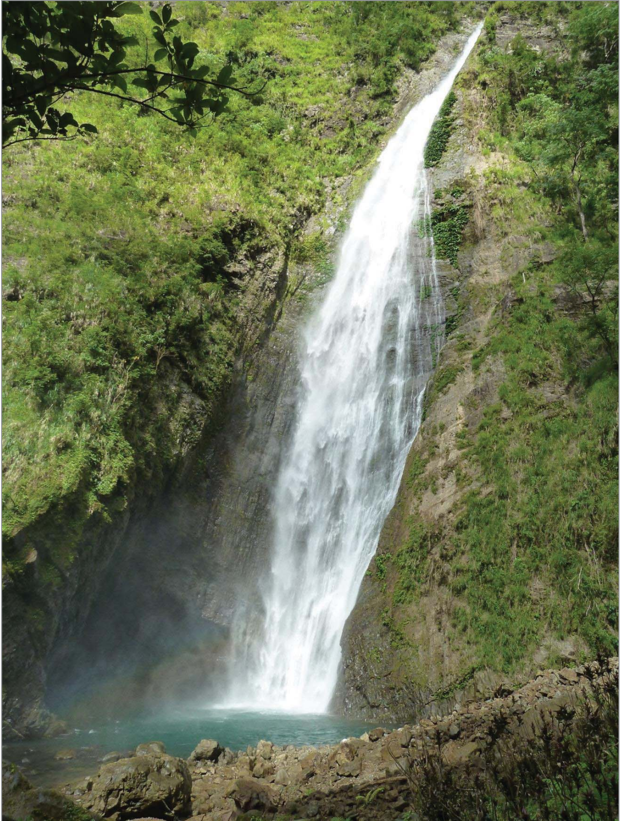
Figure 16. Study site: Dibulo Falls, Dinapigue.

14). In line to this work, surveys (Figures 16 – 25) to various poorly explored or unexplored mountains in Luzon are regularly conducted, and this time we had the opportunity to join that expedition organised by the Institute of Environmental Sciences from the Leiden University.