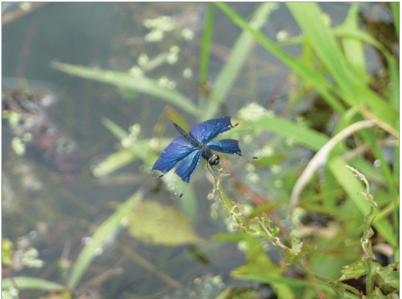
Figure 49. Rhyothemis resplendens male.

Recorded: Dunoy Lake, Brgy. Disulap, San Mariano, Isabela, Luzon Is.; Narra Lake, Brgy. Disulap, San Mariano, Isabela, Luzon Is.