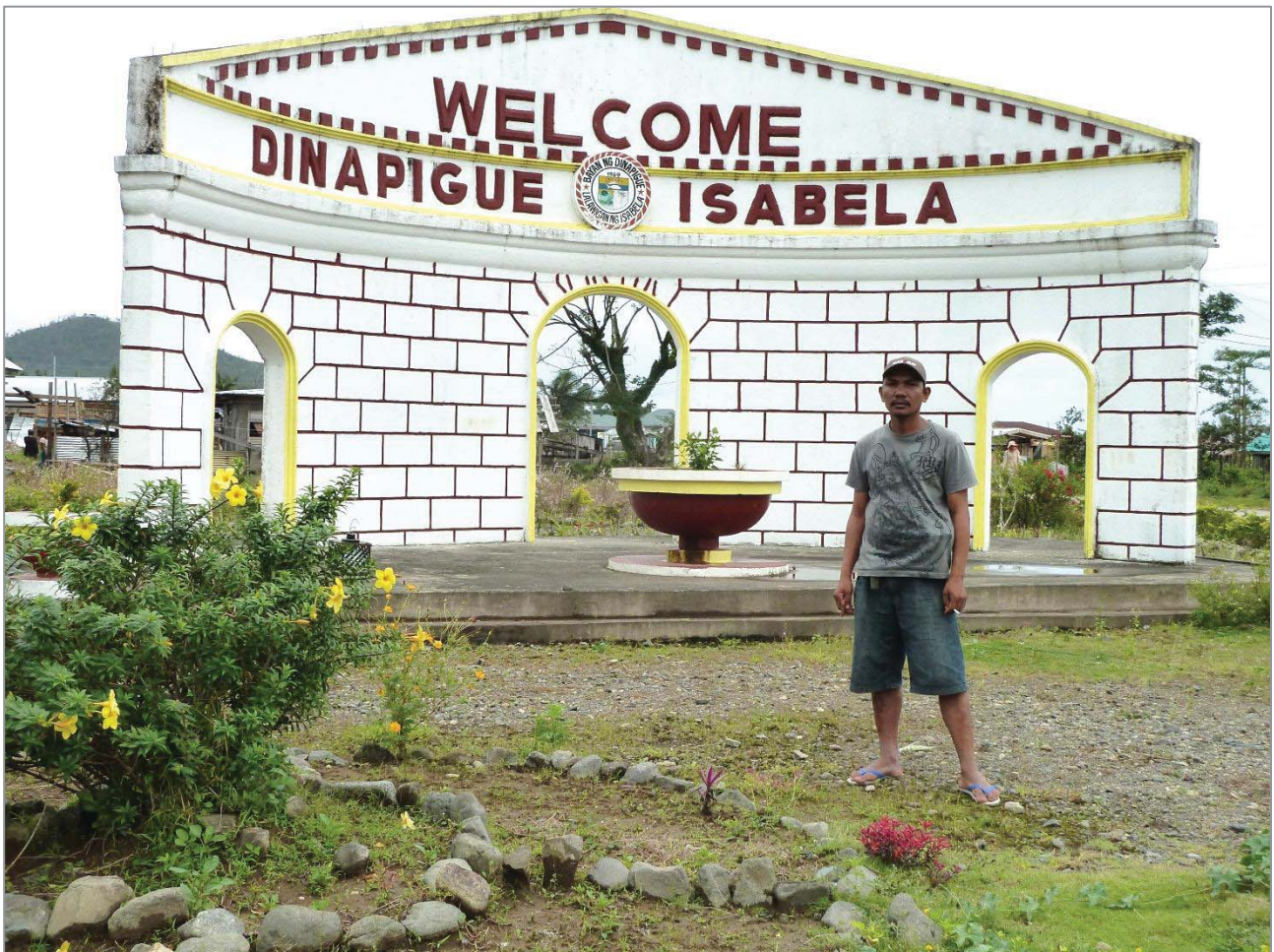
Figure 26. Third author on standing behind the marker of the Municipality of Dinapigue, Isabela Province.

He managed a short trip to visit some interesting sites in Casiguran (16°17'00N 122°02'40"E), Aurora Province. A short trip in Polillo Island (14° 49' N, 121° 54' E) was made from February 21 – 23, 2012.