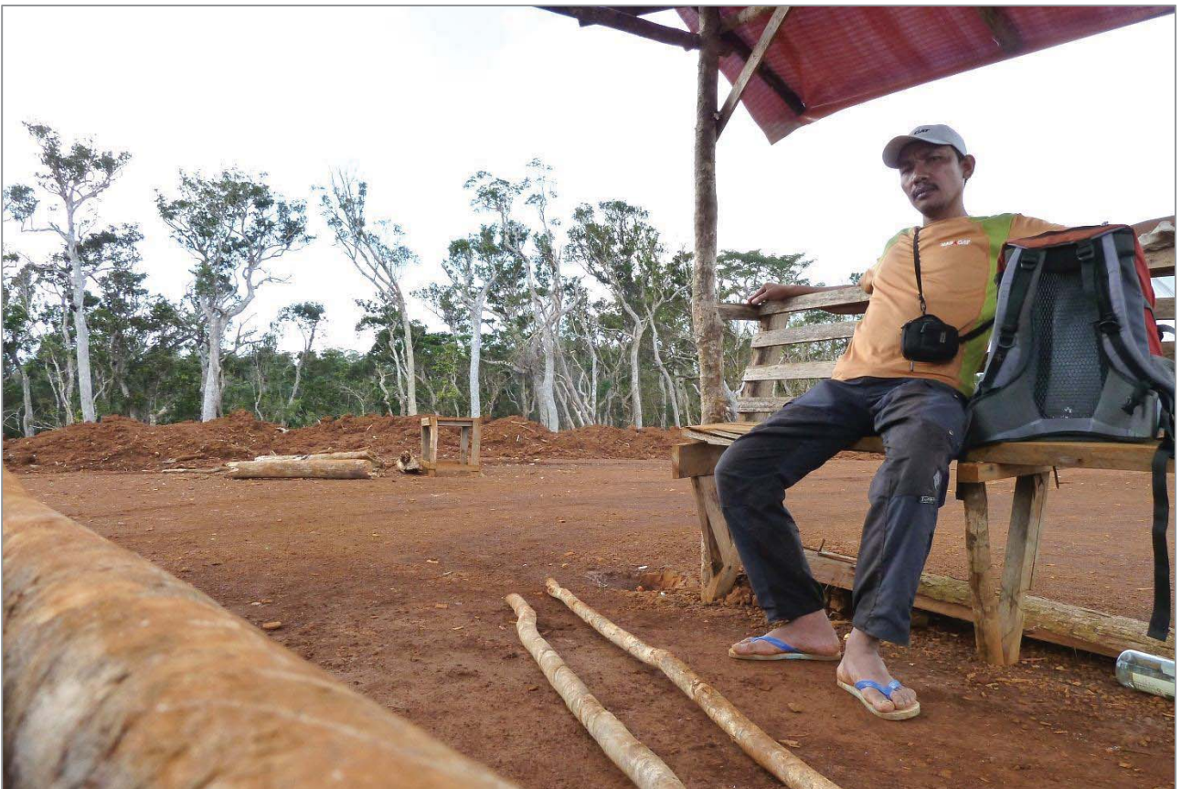
Figure 11. Third author resting on temporary shed made by mining company.