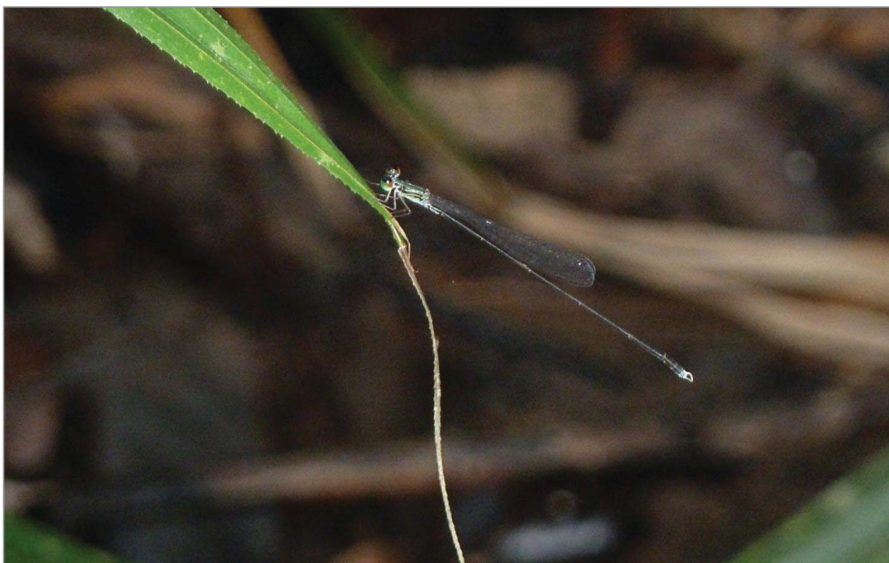
Figure 35. Amphinemesis furcata male.

Recorded: Narra Lake, Brgy. Disulap, San Mariano, Isabela, Luzon Is.; Dilasag swamp, Dilasag, Aurora, Luzon Is. (16° 24' N, 122° 13' E).