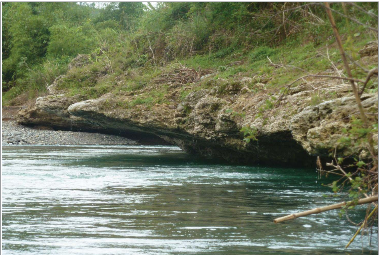
Figure 22: River in San Mariano.