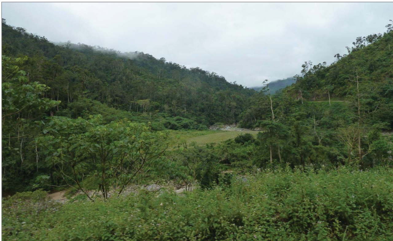
Figure 24: Small stream in Casiguran, Aurora Province.