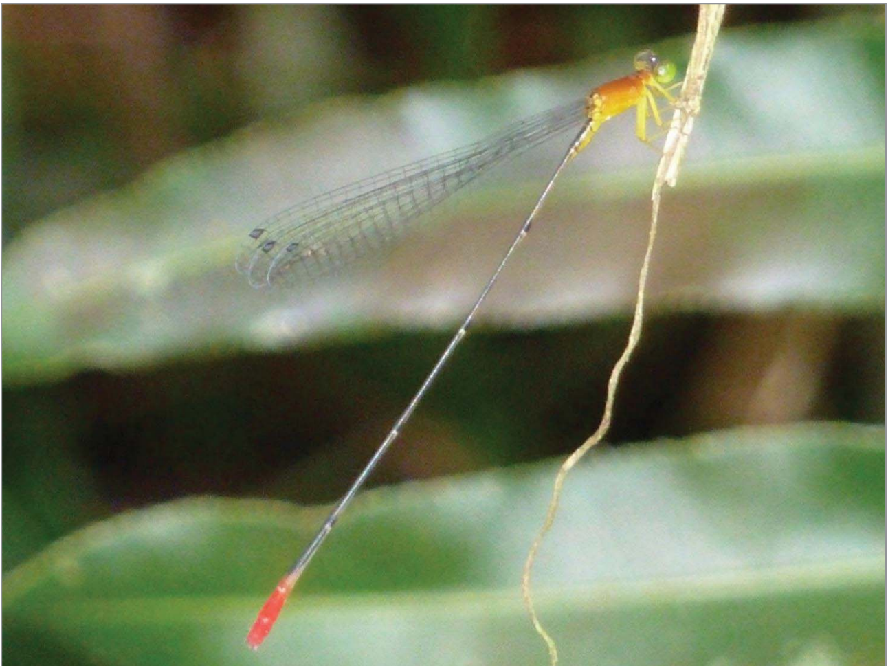
Figure 42. Teinobasis corolla male.