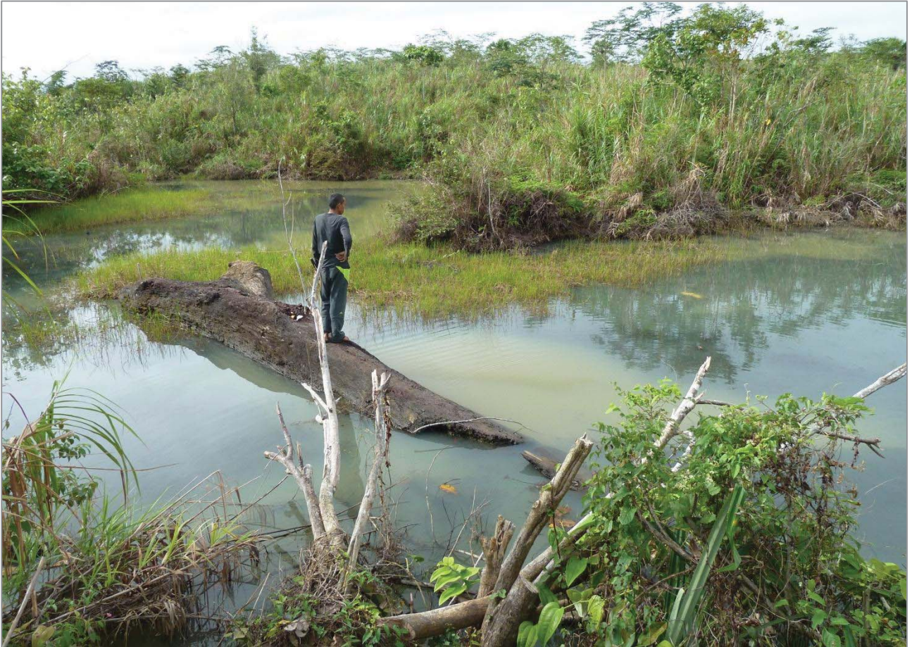
Figure 39. Habitat of the new Paracercion .