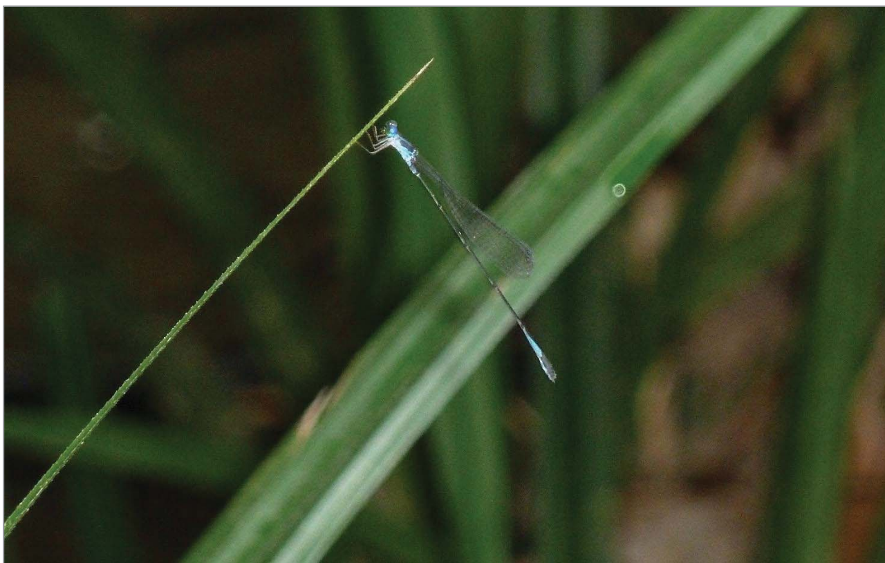
Figure 43. Teinobasis olivacea male.

Recorded: Sitio San Isidro, Brgy. Disulap, San Mariano, Isabela, Luzon Is.; Mining site, Dimaluad, Dinapigue, Isabela, Luzon Is.; Dilasag swamp, Dilasag, Aurora, Luzon Is.