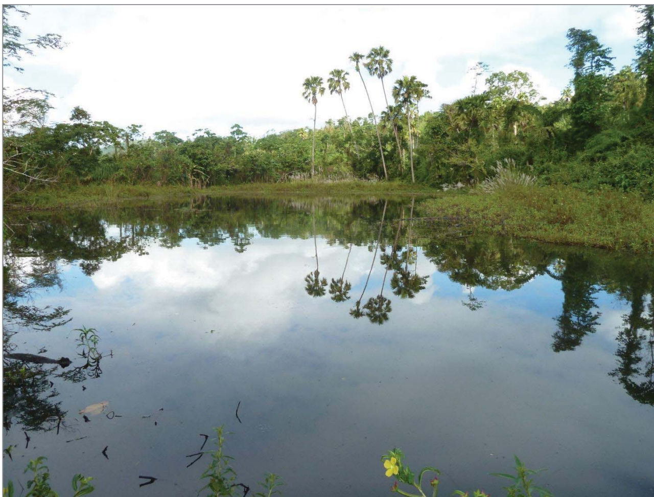
Figure 25: Lake Dunoy, San Mariano, Isabela Province.