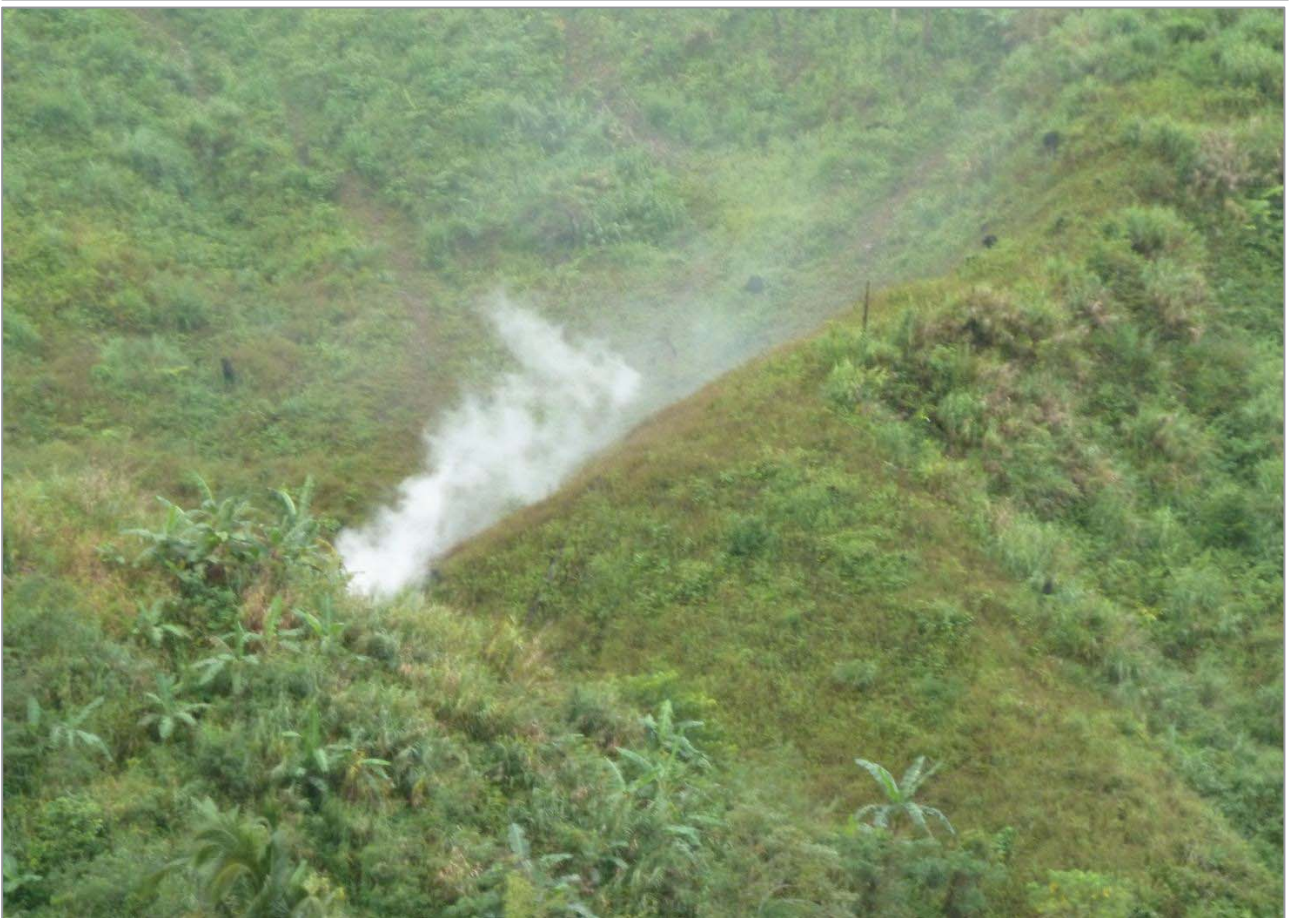
Figure 8. a. Converting land for agricultural purposes, b. burning the forest “kaingin” for agricultural purposes.