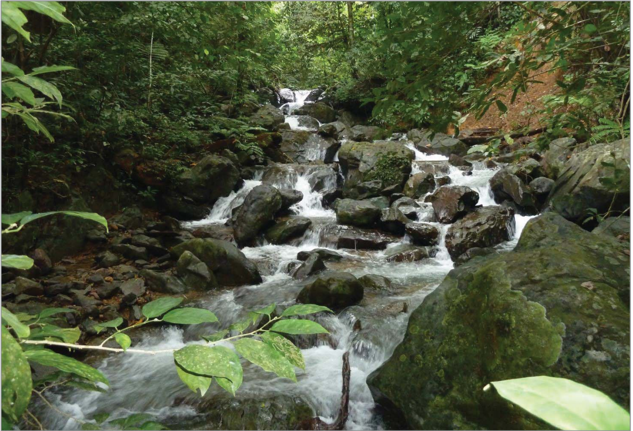
Figure 21: Head waters of Dibulo falls.