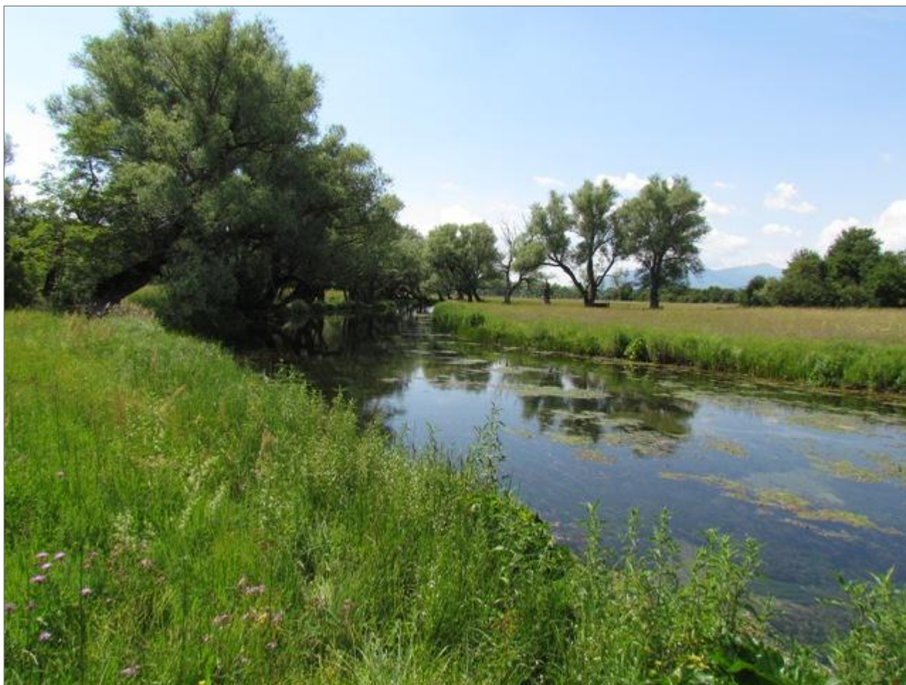
Figure 14. Žabljak river near the village Donji Žabljak