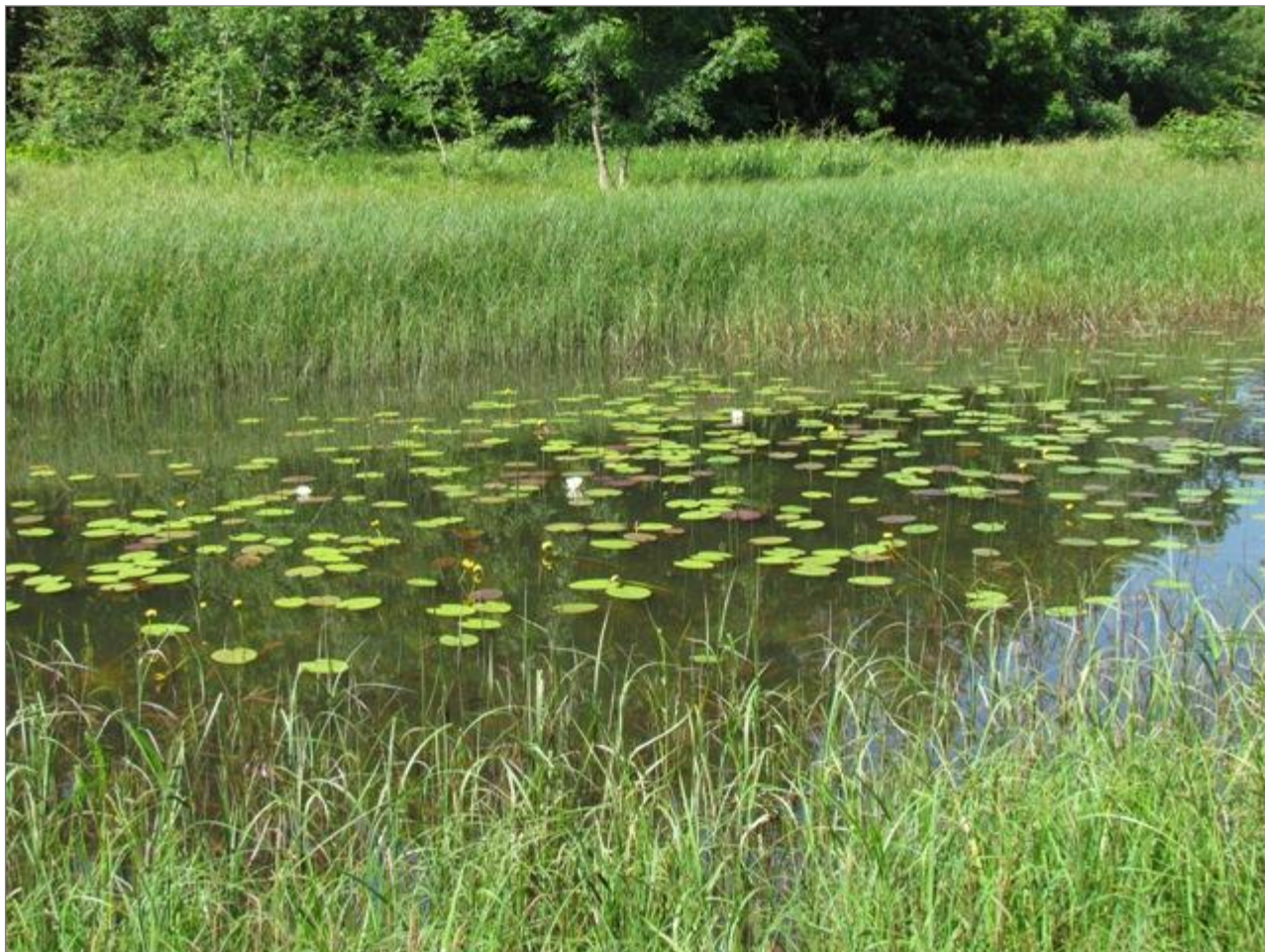
Figure 15. Oxbow of the Jaruga river near the village of Vrbice

Habitat: Stretch of Jaruga, a temporary river that drains water from the Ždralovac peatland during the wet season. It is mostly dry in the summer, but some oxbows, large ponds or small pools with rich water vegetation are still present. By the end of the summer, they are fully overgrown with marsh vegetation. Some parts of these stretches are also overgrown with tall trees.