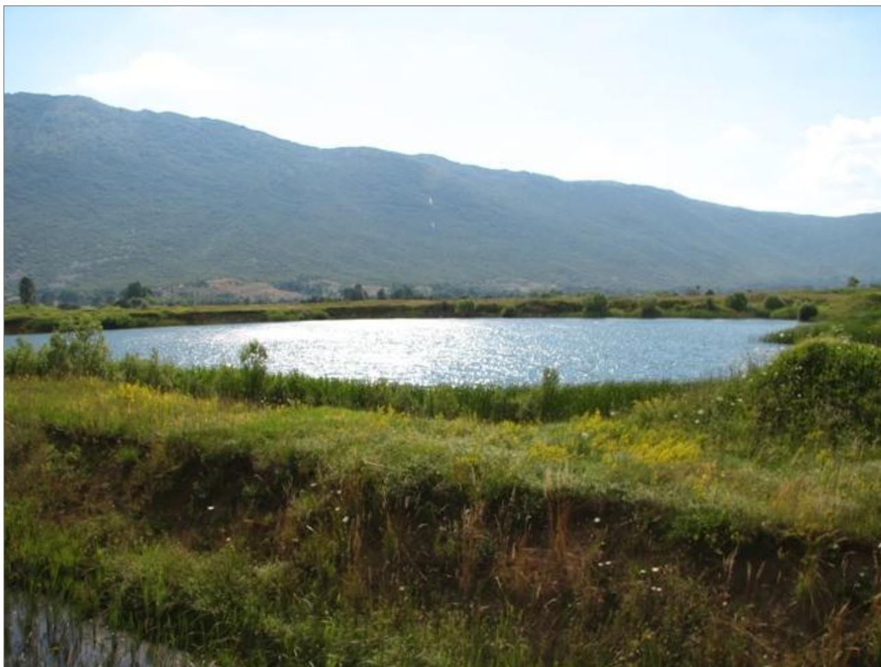
Figure 12. Pond in coal excavation pit north of the village of Orguz