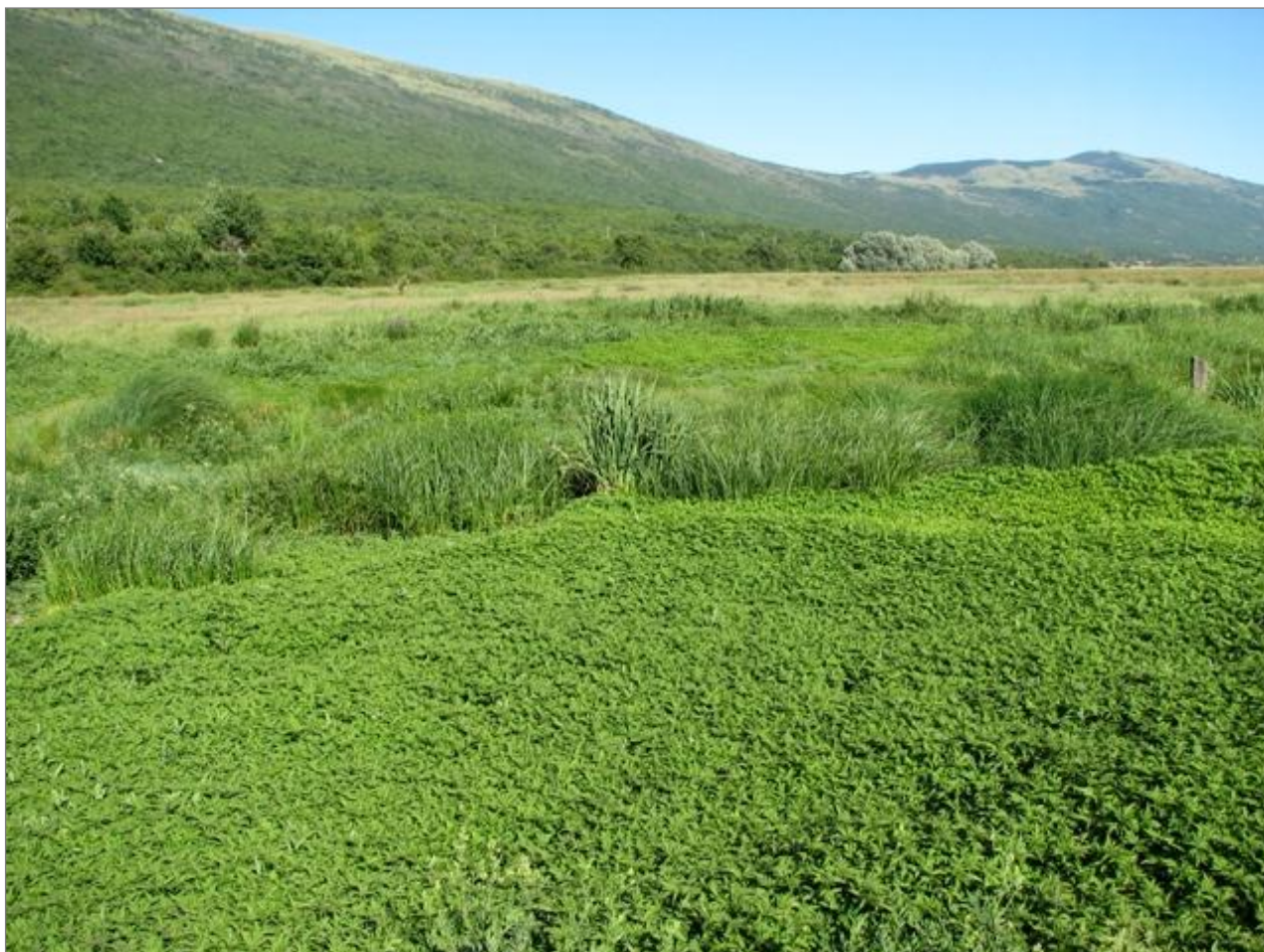
Figure 17. Wet depression near the ponor at Ždralovac peatland