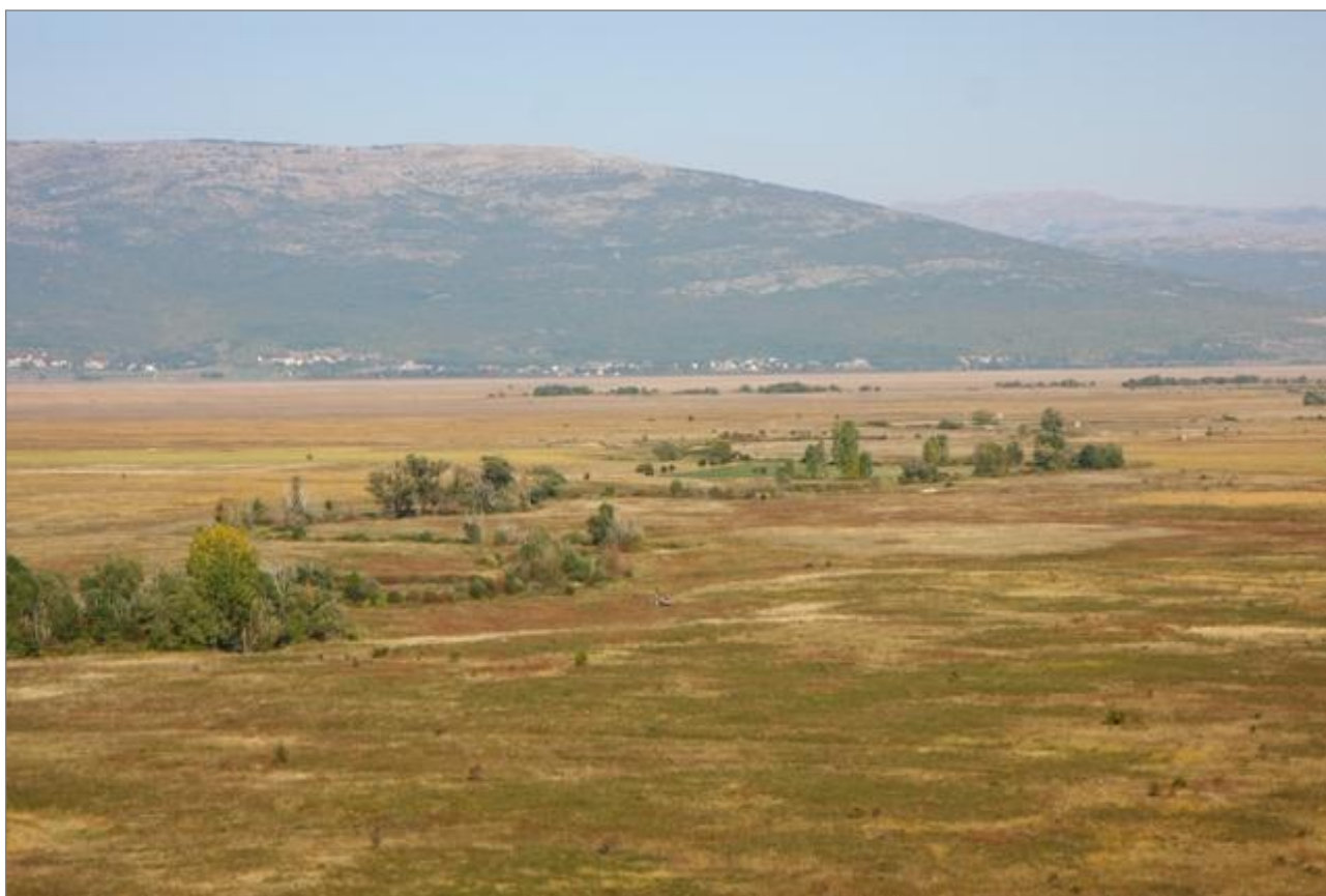
Figure 5. Dry riverbed and grasslands in late summer