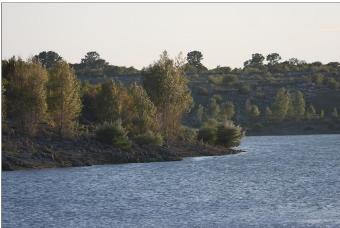
Figure 9. Rocky shore on the east side of the lake.