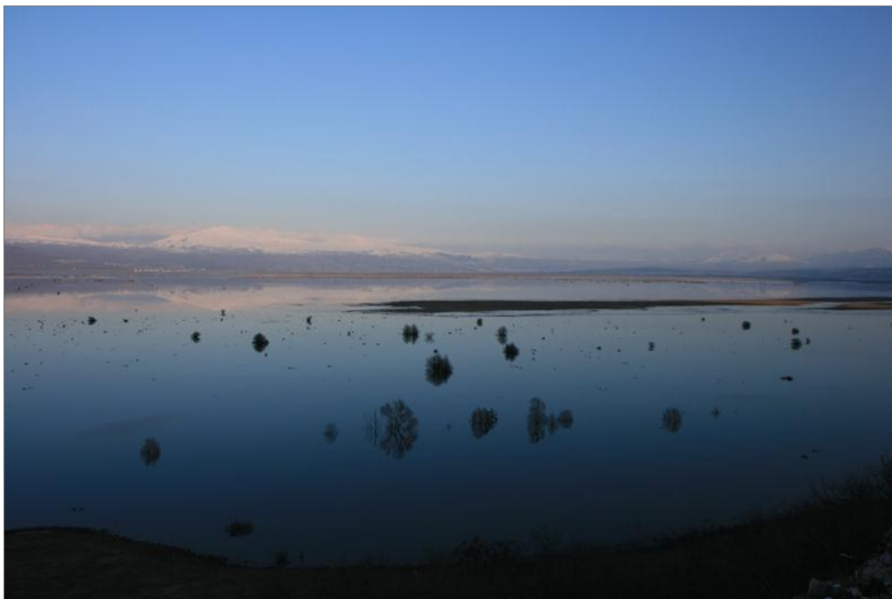
Figure 4. Flooding in central part of Livanjsko polje during the winter season