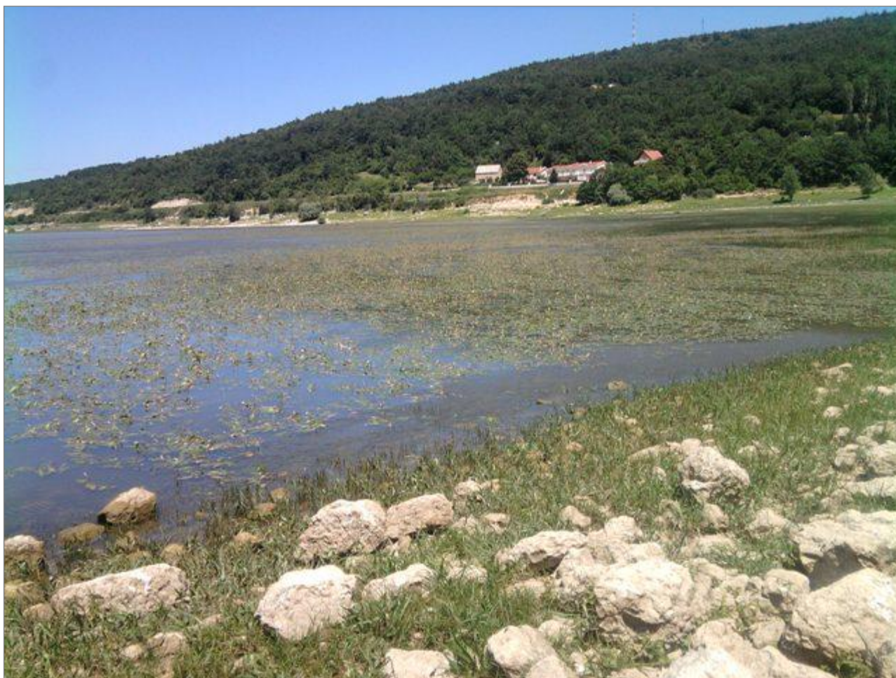
Figure 8. Lake surface covered with Polygonum amphibium at the north-east side of the lake.

Habitat: Lake shore and small pools formed in the holes made by the extraction of sand and gravel. Lake shore similar to Loc. 1. Water level is very variable and most of the pools dry out during the summer. Some shrubs of willow trees and Typha angustifolia grow in and around these pools. In some parts, floating communities of Polygonum amphibium , one of the rare plants that can adapt on highly variable water levels, cover water surface along the lake shore during summer months. Some of the recorded species like C. splendens and O. forcipatus probably don't reproduce in the lake but in the nearby stream.