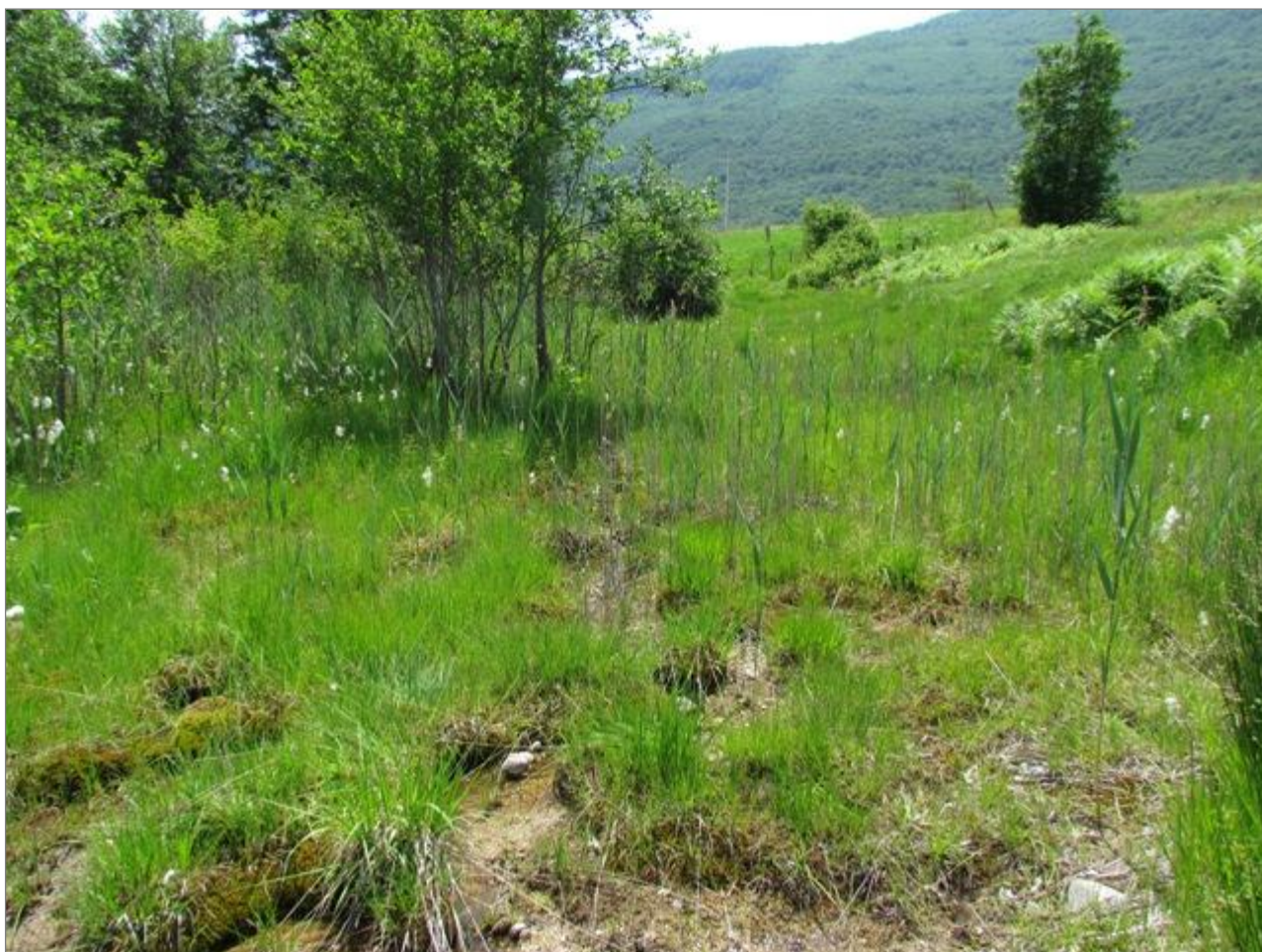
Figure 16. The edge of the wetland area with dense alder woods near Donji Kazanci village in the northwestern part of the polje.