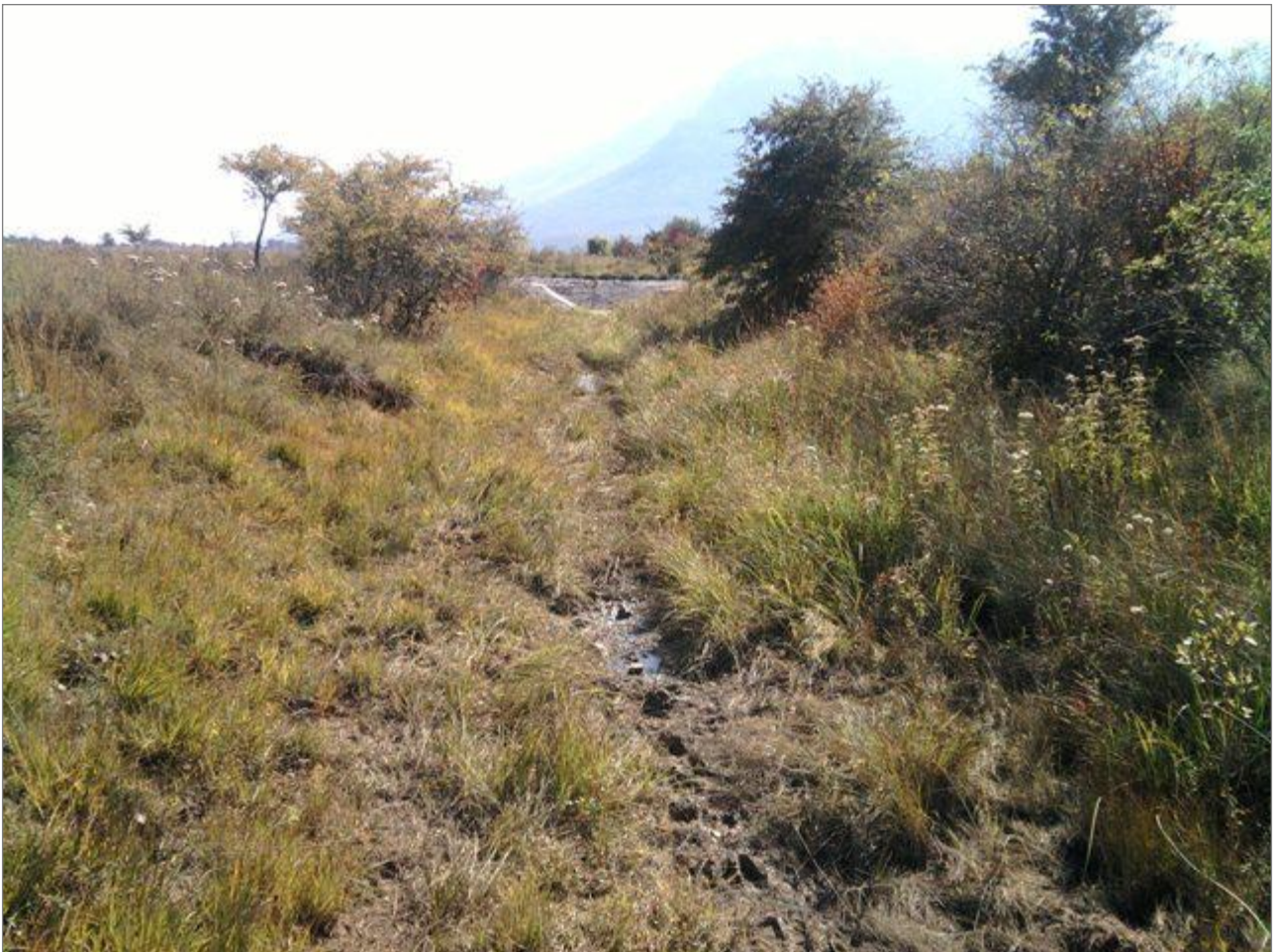
Figure 13. Almost a dry drainage ditch at Opaćica