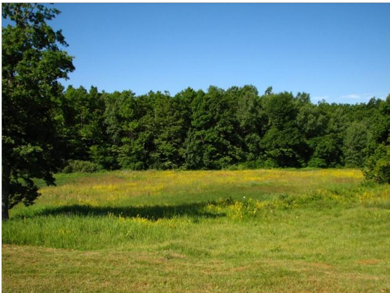
Figure 6. Alluvial forests of pedunculate oak in the northern part of the polje.

rides and the eastern Adriatic. Dry grasslands, peatlands, marshes, wet meadows and alluvial forests are the main habitats with numerous unique and relict plant associations. Their existence is based on seasonal water gradient fluctuations, naturally occurring in the polje. The unique phenomenon of karst fields of the Dinaric Alps are habitats shared by hydrophilous and thermophilous communities throughout the year, depending on variable water levels. The high water level during the spring and autumn influences rich development of hydrophilous communities, but as water level falls down considerably during the summer, the thermophilous communities dominate in the polje (Redžić et al. 2008.) (Fig. 4 & 5). The marsh forests of Livanjsko polje consists of alder, pedunculate oak and ash, and are the largest alluvial forests on karst soil in the Dinarides (Fig. 6). They are mostly found in the central and northern part of the polje.