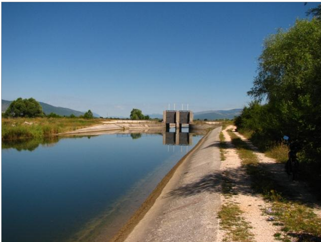
Figure 3. Main drainage canal near the Lipa reservoir

reservoir, called Buško jezero with an adjacent network of canals, as well as with smaller Lipa accumulation in 1973 in the southeastern part of the polje (Šilić & Abadžić 1989; Schneider-Jacoby et al. 2006). The network of drainage systems consists of more than 250 kilometers of large and small canals (Fig. 3).