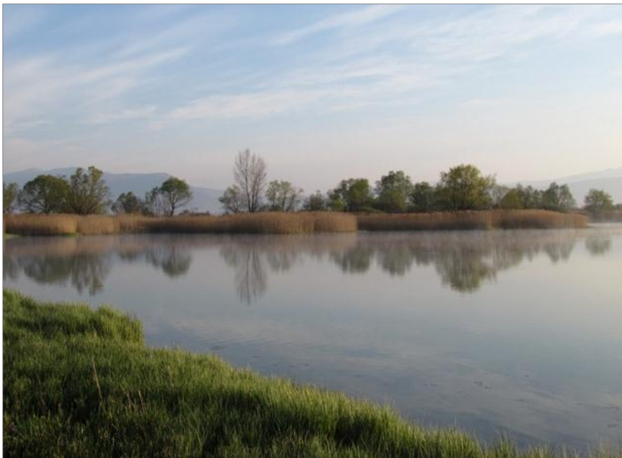
Figure 10. Lipa reservoir in the spring

Survey date: 26.05.2011., 05.06.2011., 17.06.2011.