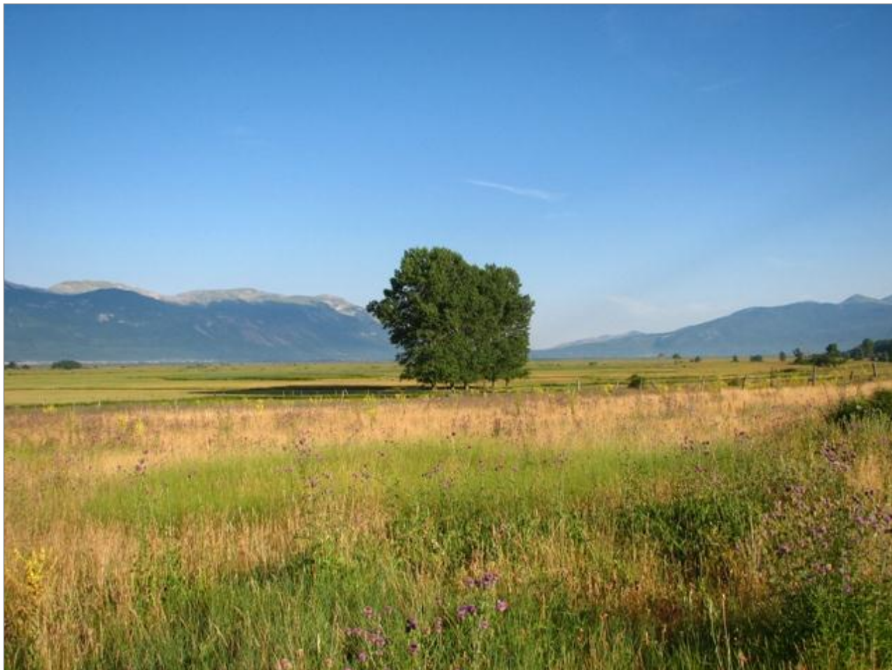
Figure 2. Livanjsko polje, pastures and meadows in the central part of the polje.

A complex network of surface and underground water bodies exist in the polje. A great diversity of different freshwater habitats can be found in the polje, among these are peat bogs, swamps, fens, swamp forests, seasonally flooded forests, artificial lakes, gravel pits, mining pools, seasonal and permanent rivers and streams, drainage channels and ditches. Fast flowing, cold and carbonate rich permanent karst rivers (Sturba, Žabljak, Bistrica) are confined to the southeastern part of the polje. Additionally, several temporary rivers run through the polje, which disappear mainly during the dry season in depressions (ponors) (Schneider-Jacoby et al. 2006; Redžić et al. 2008).