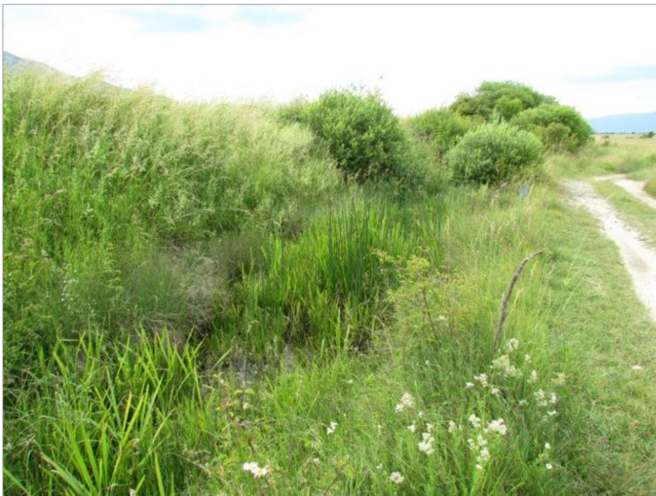
Figure 11. A small ditch along the main drainage canal near the Lipa reservoir