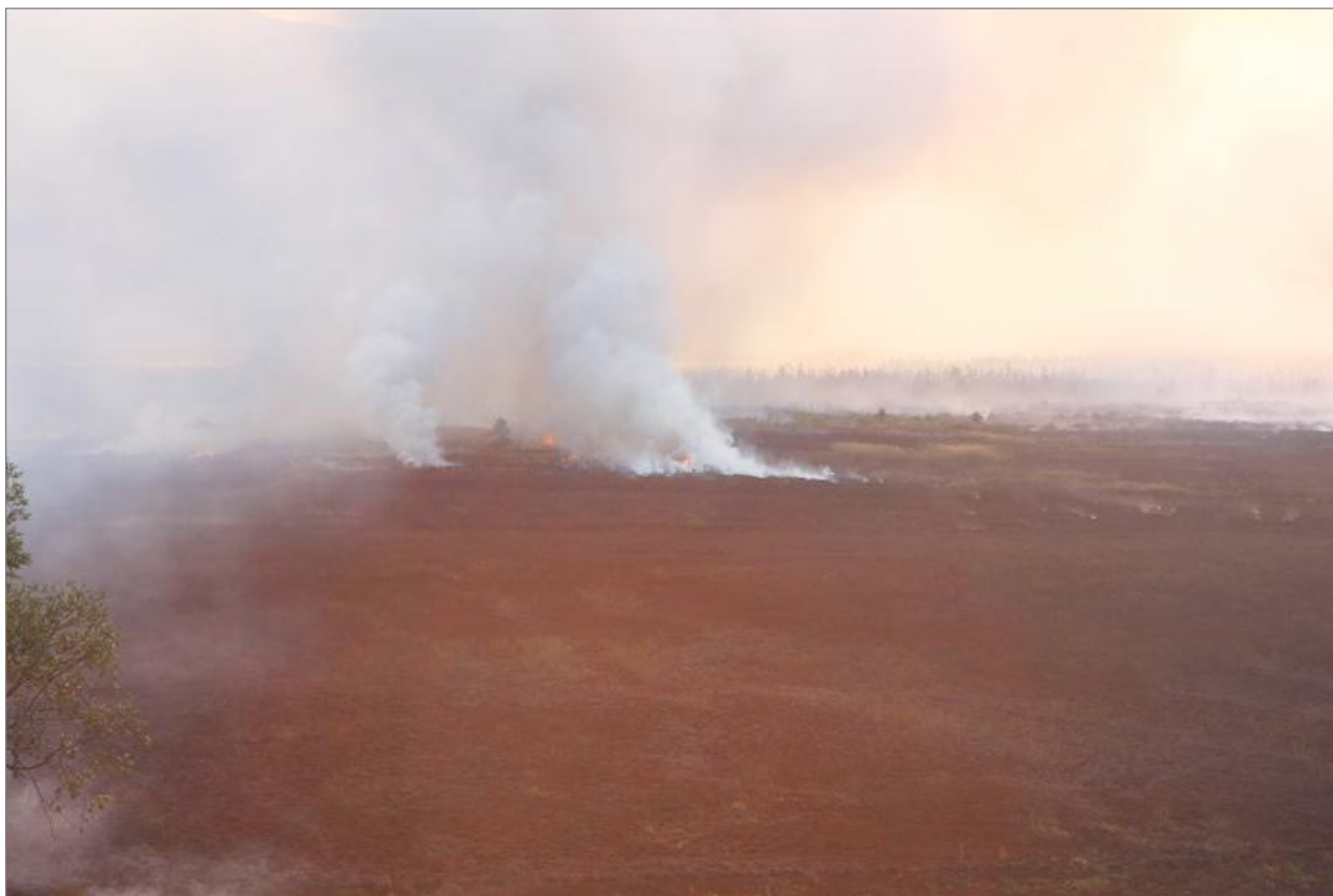
Figure 18. Fire at Veliki Ždralovac peatland in October 2011

Peat excavation and drainage that is currently practiced in Livanjsko polje is unsustainable and threatens to destroy the largest Balkan peatland. Uncontrolled burning of peat, grassland and scrub areas in the spring and autumn at Livanjsko Polje is also a serious problem for the marshland and peat areas (Fig. 18).