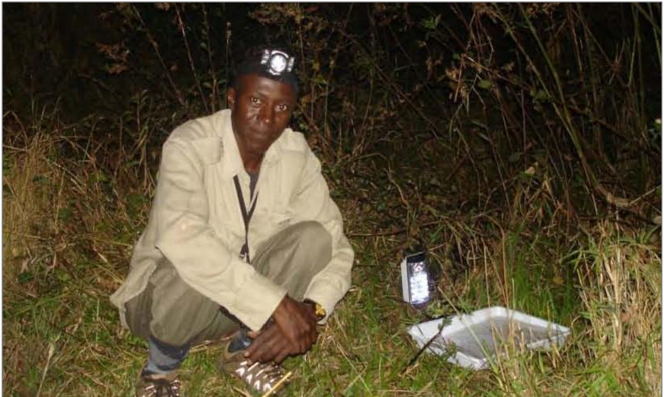
Figure 2. The design of the light traps (picture also shows the primary investigator).

of preservation. Immature specimens were generally identified by the body colour and intensity of the pruinescence on the abdomen, in combination with the hardness of the wing membrane. No detailed discussion was made on these results