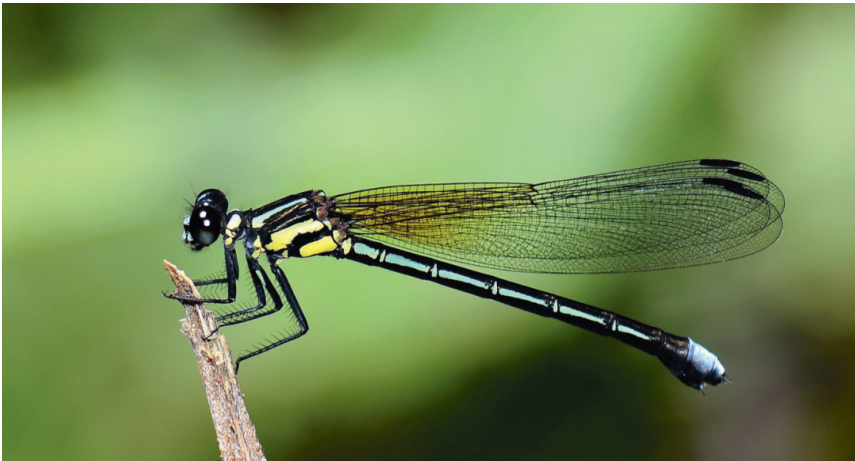
Fig. 26. Anisopleura qingyuanensis female. China, Guizhou prov.; 24-viii-2016.