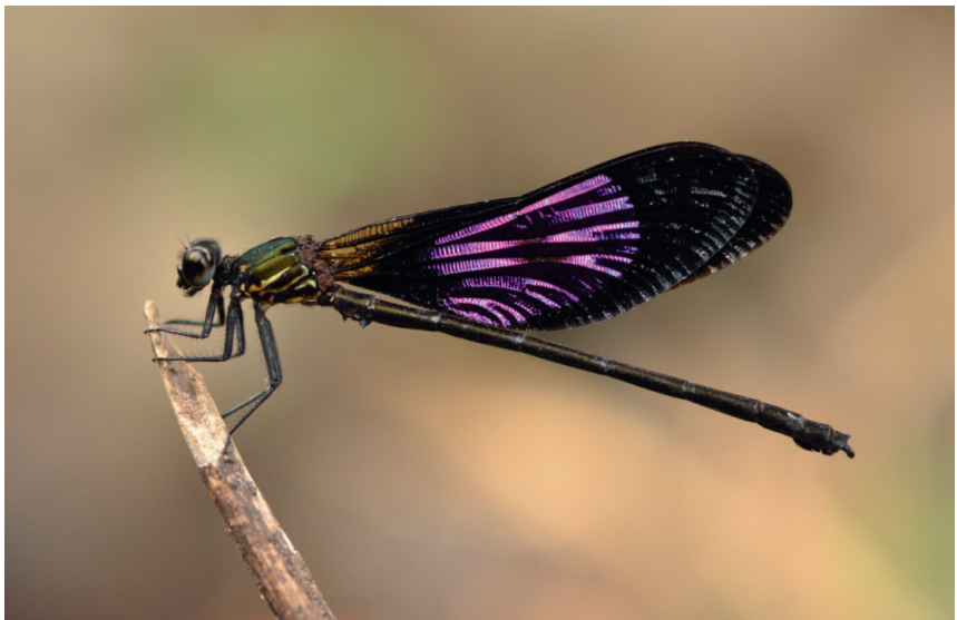
Fig. 8. Euphaea variegata , the type species of the genus Euphaea . Male. Indonesia, Java Island; 19-ix-2013.

Already Rambur (1842: 229) pointed out that Calopteryx holosericea male did not agree with Selys' generic diagnosis, since according to Burmeister's description, the male did