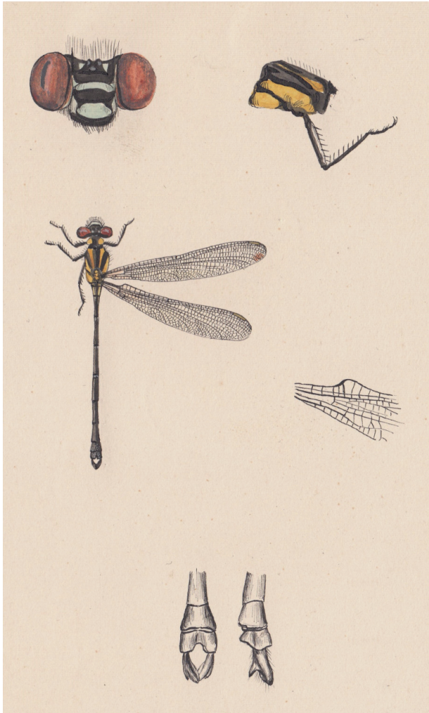
Fig. 3. Illustrations of the holotype male of Anisopleura furcata from Burma in Coll. Selys. Artwork by Guillaume Séverin. (© Royal Belgian Institute of Natural Sciences, Brussels).

By the year 1900, a total of 39 species-group names had been introduced, and of these 25 names are presently ranked as valid species and one name a valid subspecies. Then, during the next four decades the number of valid described species doubled. In the period from 1902 to 1938 a total of 24 new species were described by a total of 11 authors: René