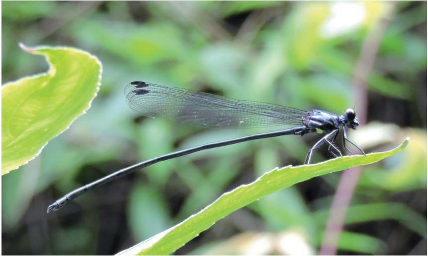
Fig. 27. Schmidtiphaea schmidi male. India, Nagaland state; 25-viii-2016.

The author wrote: “The specific name is dedicated to the collector, Dr. Fernand Schmid.” The description was based on a single male specimen from “Huiahu, 3800-5000ft., Manipur, Assam”, collected by Schmid on 1 July 1960. The holotype is kept in the NSMT (Tokyo). Reference. Asahina (1978: 44).