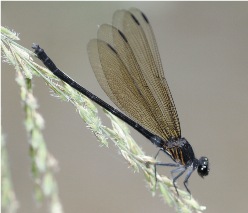
Fig. 25. Euphaea pahyapi male. Thailand, Krabi prov.; 20-xii-2006.