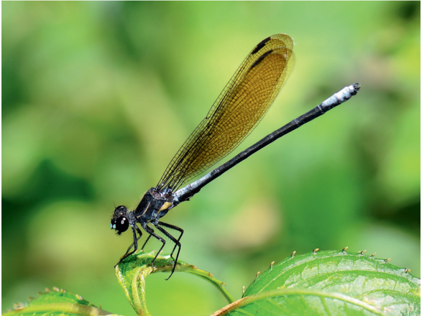
Fig. 12. Bayadera continentalis male. China, Guangxi prov.; 5-vi-2017.

The holotype male was collected in Fujian – “Kuatun, {alt.} 2300 m. Fukien” – by Johann Friedrich Klapperich (1913-1987) on 1 May 1938 [not on 1 May 1946, as stated by Asahina]. Klapperich also collected many (104 ♂, 70 ♀) other specimens from the same location, some of which were listed as paratypes. The holotype is deposited in the NSMT (Tokyo).