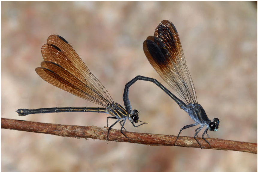
Fig. 23. Baydera melanopteryx tandem pair. China; 12-viii-2012.