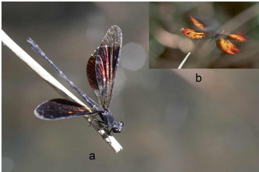
Fig. 21. Euphaea hirta male showing flashes of iridescence on upper (a) and under sides (b) of wings. Vietnam, Lam Dong prov.; 11-xii-2006 (a); 22-xi-2004 (b).

The name refers to the profusion of setae on various parts of the body of the male of this species, which makes it to look more 'hairy' than its congeneres E. guerini and E. masoni . The given etymology reads: " Hirta , "hairy", denoting the excessive hairy appearance, when