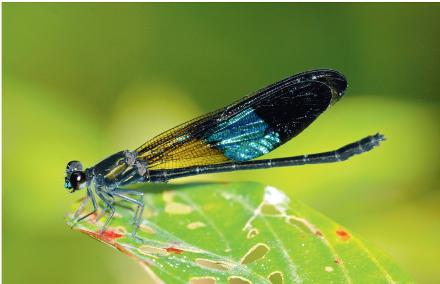
Fig. 30. Euphaea tricolor male. Malaysia, Sarawak; 5-xii-2005.

The name 'three-coloured' refers to the colour pattern of the male hind wing, in which the basal half is amber tinged hyaline and the opaque apical half is sharply divided into brilliant iridescent blue- green and black opaque sections: "Ailes hyalines un peu jaun-