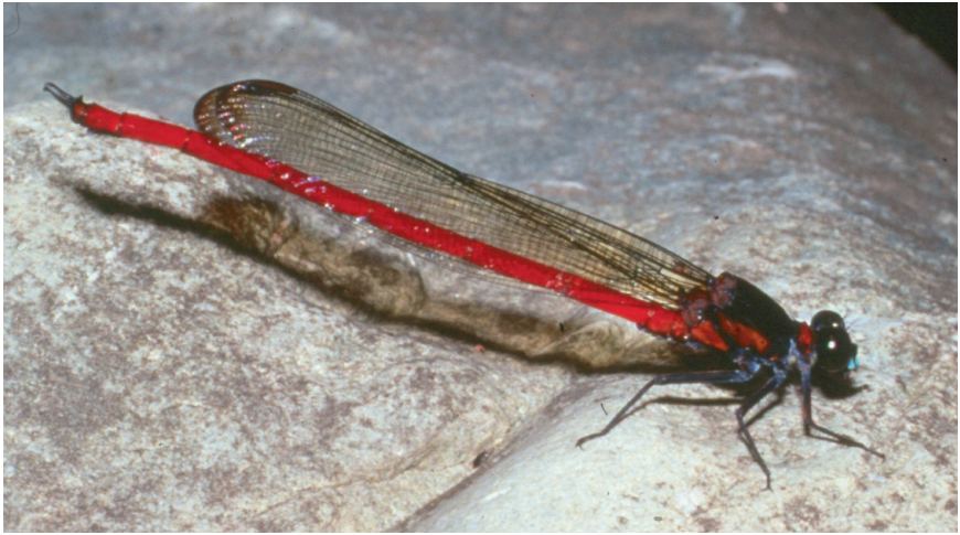
Fig. 10. Heterophaea barbata male. Philippines, Luzon, Aurora prov.; 21-iii-1997.