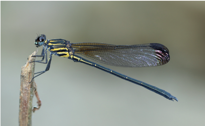
Fig. 20. Bayadera hatvan male. Vietnam, Yen Bai prov.; 11-v-2014.