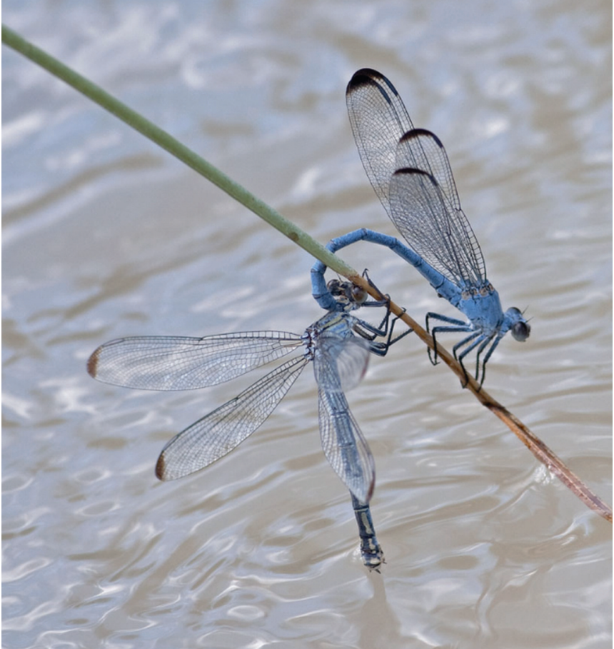
Fig. 15. Epallage fatime tandem pair. Turkey, Adiyaman prov.; 8-vi-2011.