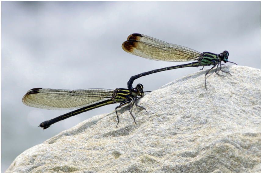
Fig. 22. Bayadera indica tandem pair. Nepal, Bokhara; 11-ix-2013.

A toponym. The species was described from "numerous" male specimens from an unspecified location in India: "Patrie: Inde. Musée britannique; collect. Selys.) (1853)"; "Patrie: