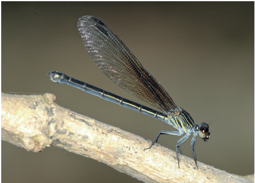
Fig. 24. Euphaea ornata female. China, Hainan Island; 13-viii-2008.

In a paper on Hainanese dragonflies, Kirby (1900: 536) had identified and illustrated a male specimen as ' Pseudophaea decorata (?)', although he suspected that it might be distinct from P. decorata , a species which he had not seen. Campion had studied the same specimen as