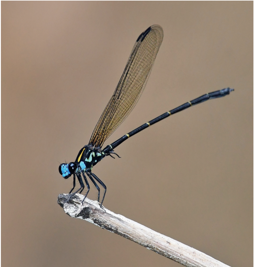
Fig. 14. Cyclophaea cyanifrons male. Philippines, Palawan Island; 25-x-2023.