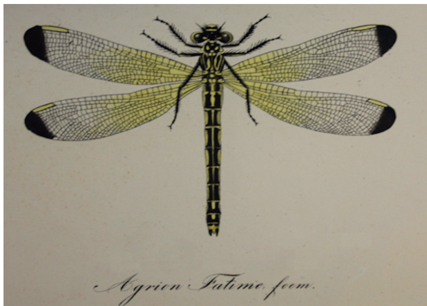
Fig. 2. Illustration of Epallage fatime female, published in Charpentier (1840).