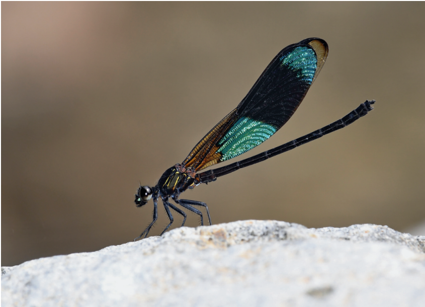
Fig. 9. Euphaea amphicyana male. Philippines, Biliran Island; 13-i-2022.

Ris placed the new species from Mindanao into the ' Euphaea tricolor -group' (including four species from Borneo: tricolor , subcostalis , subnodalis and basalis ). In these species, the darkly coloured areas of the hind wings have zones of blue-green metallic reflections, the arrangement and extent of which varies between the species. For E. amphicyana they were characterized as follows: "Die dunkle Farbe beginnt etwa am distalen Ende des Vierecks, oder subhyalin schon an der Basis. Hyalin oder subhyalin 3,5, dunkel 24,5 mm. Darin auf der U{nter}seite blaumetallisch bis zum Nodus an der Costa, 4-5 Zellen weiter distal am analen Rand, schwarz bis zum Pterostigma, blau die Flügelspitze. Auf der O{ber}seite blau bis zur Mitte Nodus-Pterostigma, distal mit diffusem Abschluss, schwarz der Rest ohne blaue Spitze [The dark colour begins about the distal end of the quadrilateral, or partially hyaline at the base. The hyaline or subhyaline areas are 3.5, dark coloured 24.5 mm. Within that {area} on the underside blue metallic to the nodus, at the costa, 4 to 5 cells farther distally at the anal margin, black up to the pterostigma, the apex blue. On the upper side