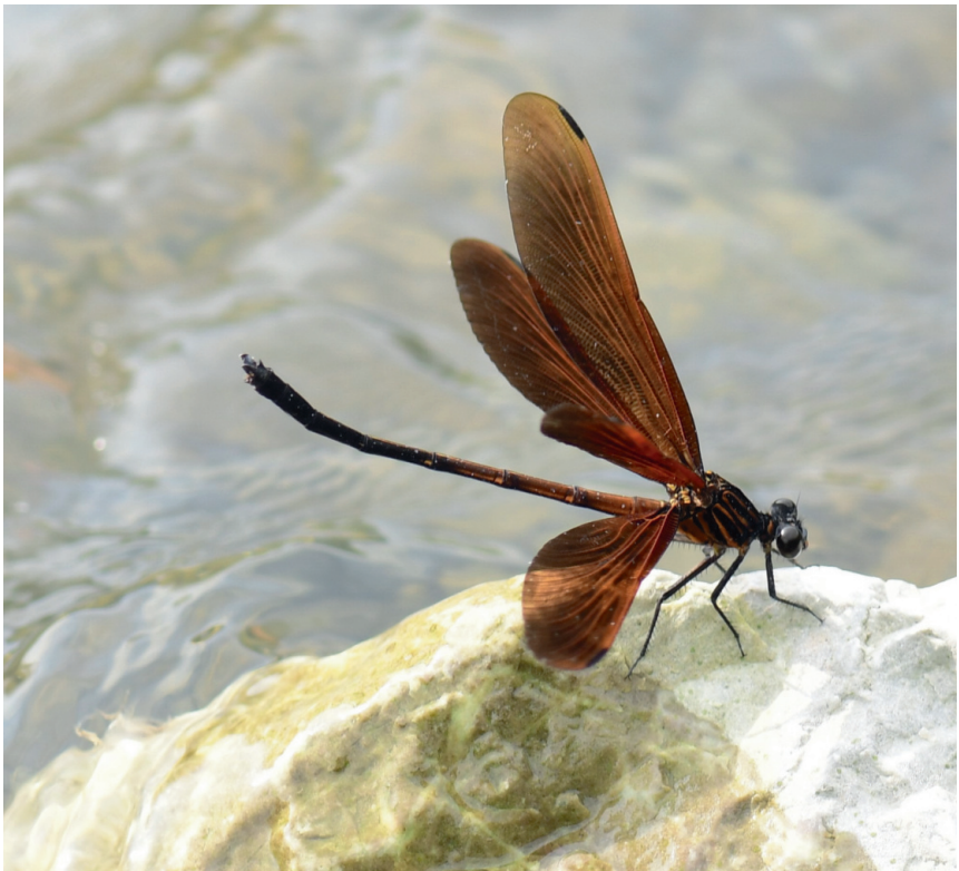
Fig. 29. Euphaea superba male. China, Guizhou prov.; 19-vi-2018.

The name is clearly due to the large size and colourful wings of this damselfly, which Kimmins calls a “handsome species”. In the description of the male it reads: “A large golden-brown-winged species, with obscure brown suffusion at the apices of the wings” and “Wings ... hyaline golden-brown, apices with a brownish suffusion, extending in the anterior to about halfway along the pterostigma and in the posterior to a few cells beyond the pterostigma. The colour of the membrane is stronger in the costal and subcostal areas towards the bases of the wings. ... pterostigma dark reddish brown, other veins and cross-veins, particularly when viewed along the plane of the wings, brick red.” The author states: “This species differs from the other yellow-winged species in its greater size, denser reticulation, brownish markings at the wing-apices and the smooth surface of the vesicle.”