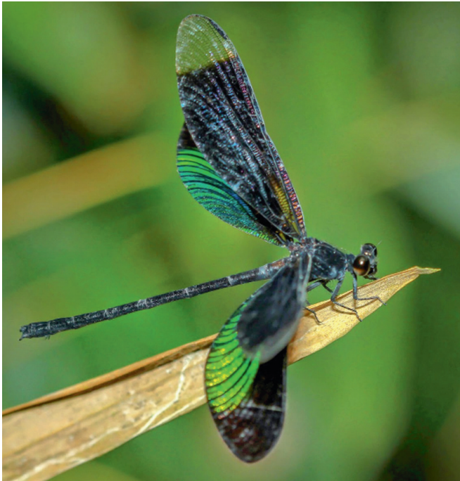
Fig. 19. Euphaea guerini male. Vietnam, Phu To prov.; 12-vii-2014.