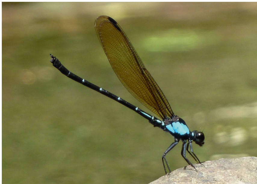
Fig. 13. Euphaea cora male. Philippines, Mindanao, Surigao del Sur prov.; 27-x-2011.