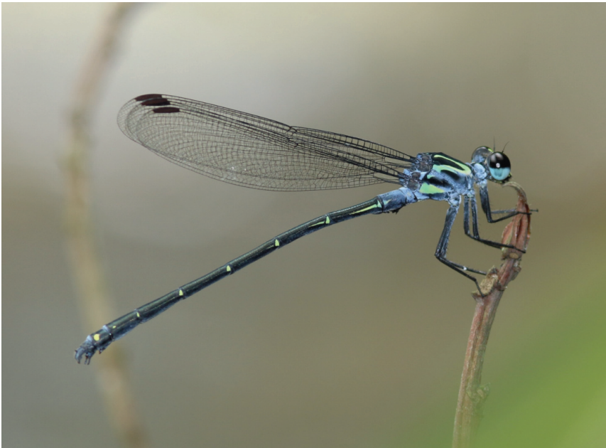
Fig. 28. Bayadera serrata male. Vietnam, Cao Bang prov.; 23-v-2015.

The authors explain their choice of name as follows: "Etymology. – serrata , Latin serrule {sic} = a saw, adjective serrated, referring to the inferior margins of the apices of the superior