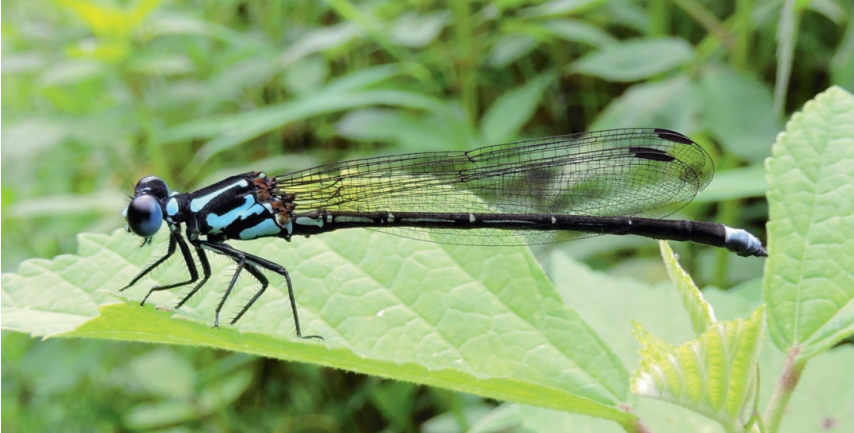
Fig. 31. Anisopleura valleii male. India, Nagaland state; 16-vii-2016.

Described on the basis of 9 male specimens from “Cherapunji, Khasi Hills, Assam. Juni 1935.”[Khasia Hills, Meghalaya, India]. The holotype is deposited in the NHMV (Vienna). Reference. St. Quentin (1937: 86).