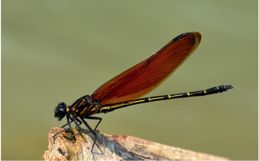
Fig. 18. Dysphaea gloriosa male. China, Yunnan prov.; 29-iv-2010.