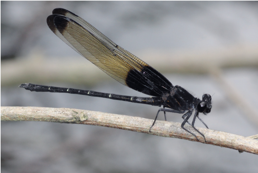
Fig. 11. Dysphaea basitincta male. China, Guangxi prov.; 31-v-2018.