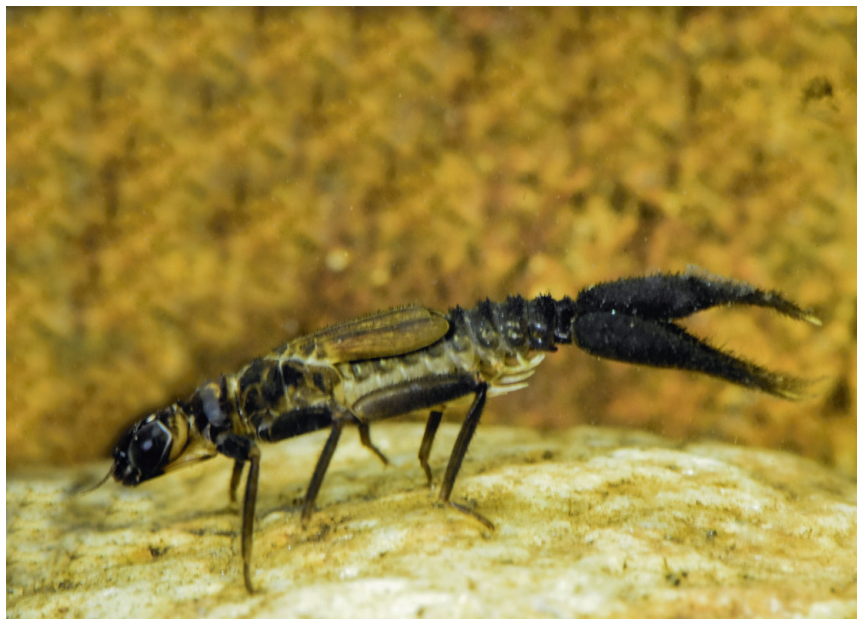
Fig. 17. Anisopleura furcata larva. Thailand, Chiang Mai prov.; 13-6-2023. Photographed in an aquarium.