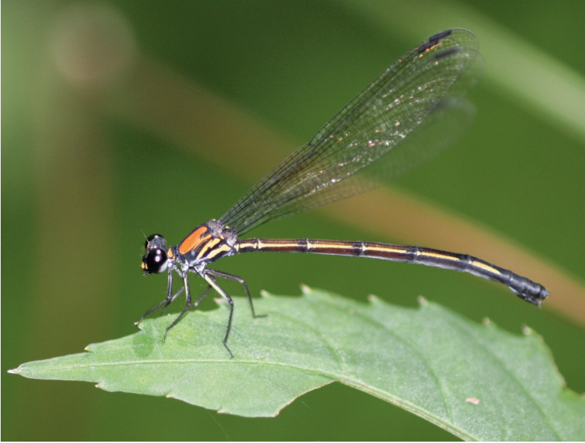
Fig. 33. Cryptophaea vietnamensis female. Vietnam, Vinh Phuc prov.; 26-vi-2005.

be the genitive case of an adjective, but not in connection with a relational noun such as Bayadera in the nominative case, which a genus name always has to be. If the genitive case had been intended it should have been a noun based on the name of the country which would have created the binomial Bayadera vietnamiae .