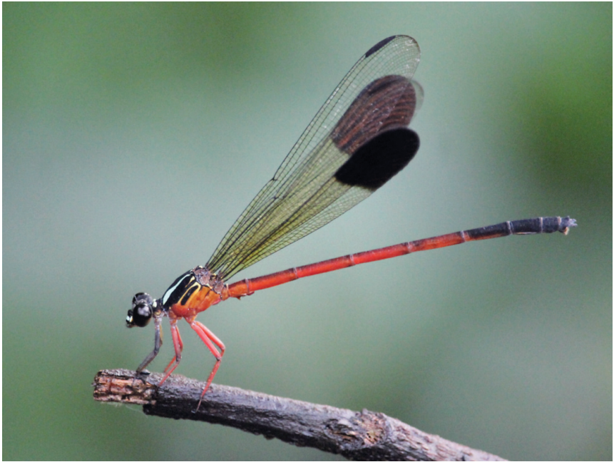
Fig. 16. Euphaea fraseri male. India, Kerala state; 22.vi.2020.

Wells Kemp (1882-1945) in October 1916. The holotype male was deposited in the Indian Museum (Kolkata).