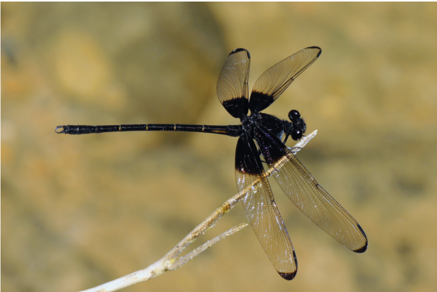
Fig. 32. Dysphaea vanida male. Thailand, Surat Thani prov.; 27-i-2015.