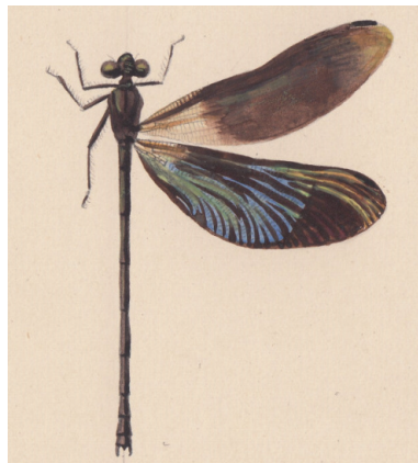
Fig. 6. Illustration of Euphaea splendens [originally as Euphaea carissima ] male from Ceylon in Coll. Selys. Artwork by Guillaume Séverin.