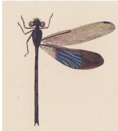
Fig. 5. Illustration of Euphaea subcostalis male from Borneo in Coll. Selys. Artwork by Guillaume Séverin.