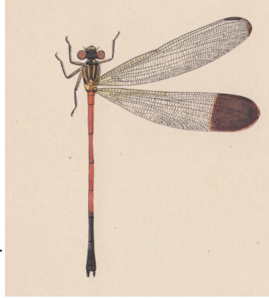
Fig. 4. Illustration of Euphaea dispar male from India in Coll. Selys. Artwork by Guillaume Séverin. (© Royal Belgian Institute of Natural Sciences, Brussels).