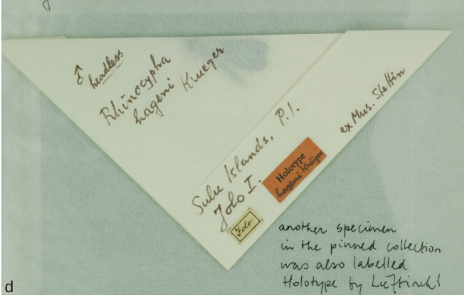
Fig. 7a. Rhinocypha hageni , holotype ♂; b. label c + d.. another headless male with its paper cover, which specimen Lieftinck also referred to as holotype. That problem will have to be clarified in the future