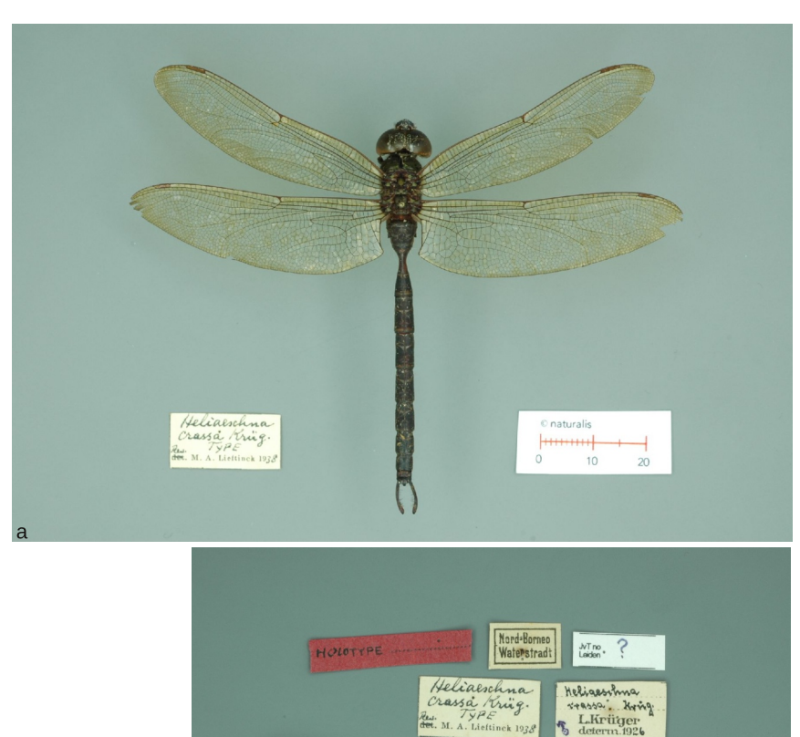
Fig. 5a. Heliaeshna crassa , holotype ♂; b. labels. Two other specimens of Krügers type series are still at MIZPAN