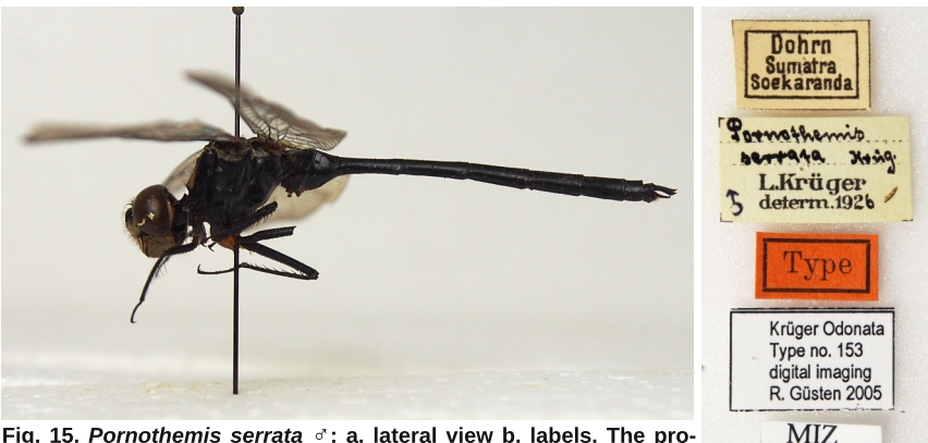
Fig. 15. Pornothemis serrata ♂: a. lateral view b. labels. The protruding genitalia which may have led to the name are well to be seen.

If the name was intended to evoke a charming female being (cf. Copera p. 34; Fliedner 2021: 111) that rather would be a misnomer as the Greek word is somewhat derogatory.