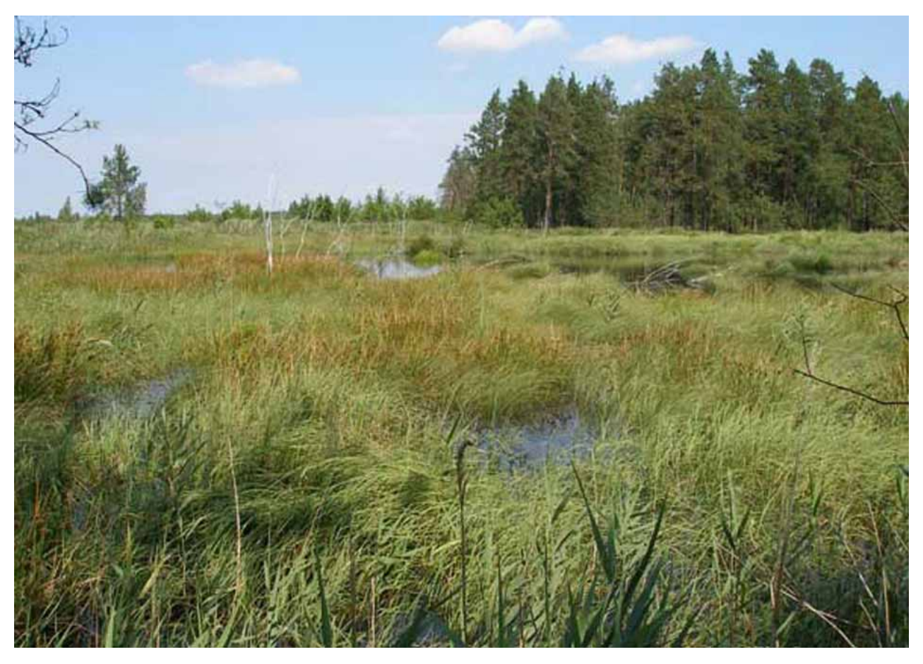
Figure 6: Bog around the river Zholobnytsya: likely breeding site of Nehalennia speciosa.

N. speciosa is a rare and declining species in Europe and in need of strong protection (Bernard & Wildermuth 2005). Old records were known for Ukraine from the beginning of the 20th century, mainly in the north and western parts and one record from the south (Gorb et al. 2000). Since 1950 only individual specimens were found in northern Ukraine (Volynska and Chernihiv oblast') and some data need confirmation (Bernard & Wildermuth 2005).