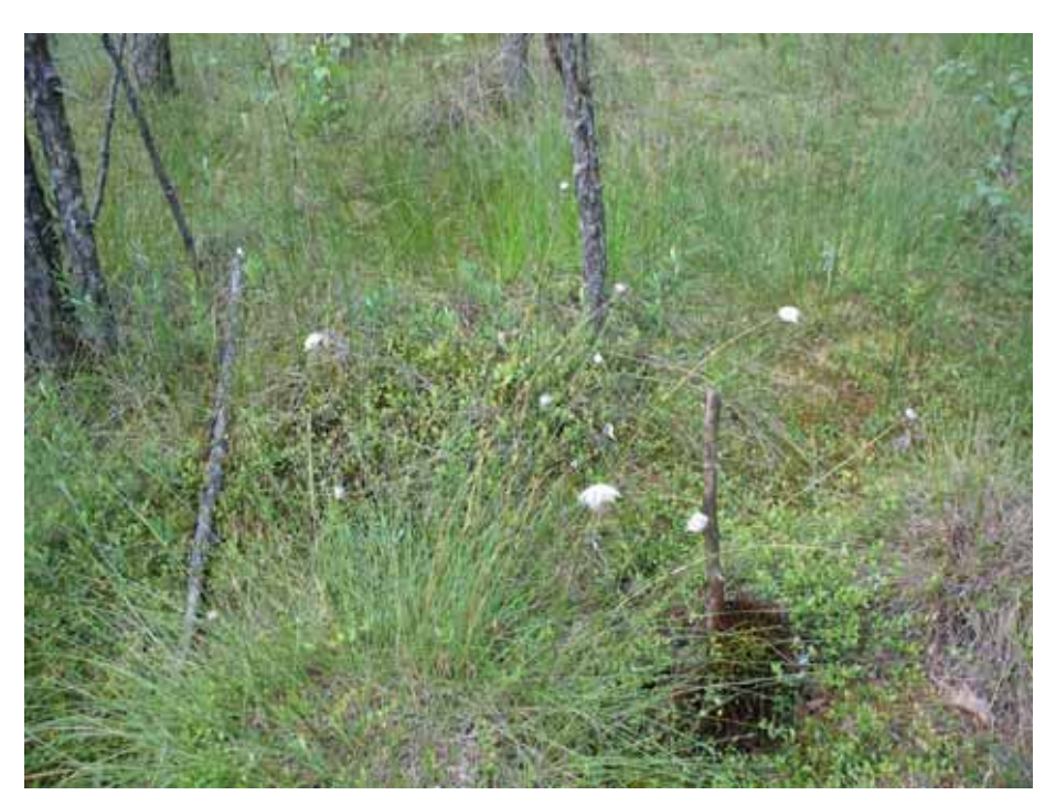
Figure 4: Dwarf shrubs and bog cotton of mires.