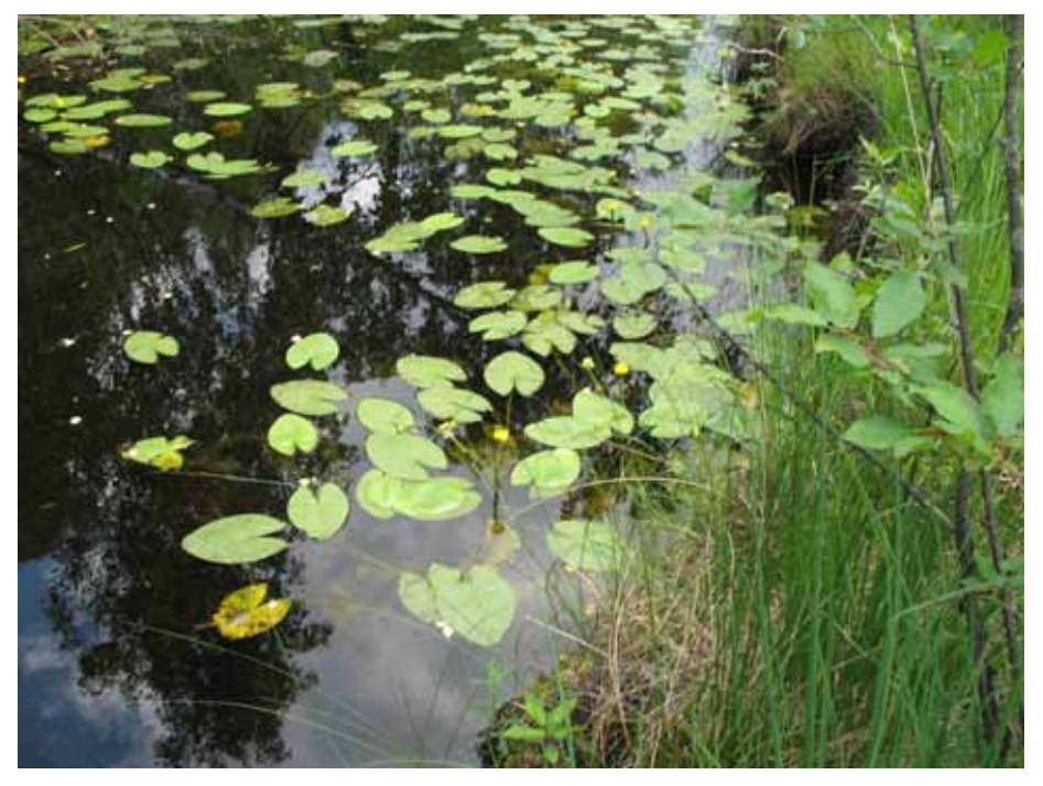
Figure 5: Emergent and floating vegetation in rivers.