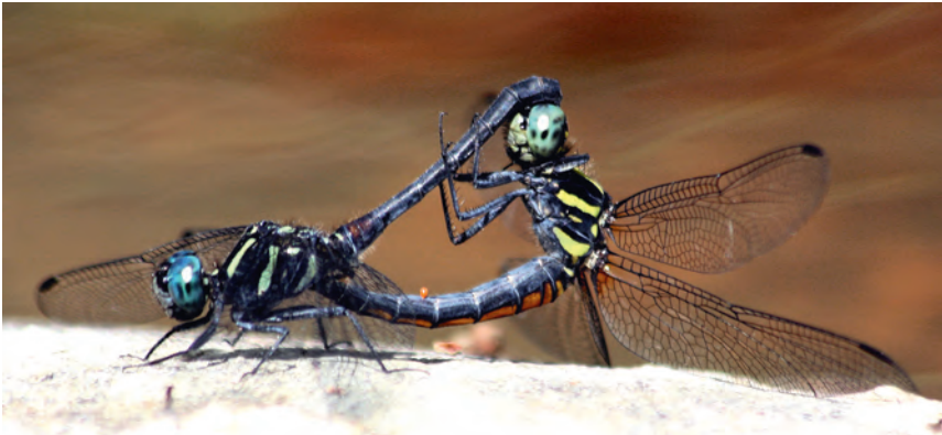
Figure 7: Diplacina paragua .

This species was described from materials collected in eastern central Palawan. Previous trips by the authors in the south and northern part of the island did not reveal this species. Finding of this species in Cleopatra's Needle represents the first record of this species from the northern part of island. There is a need to investigate the phenology of the species considering only two individual were found on this trip while it was so abundant when the type materials were collected.