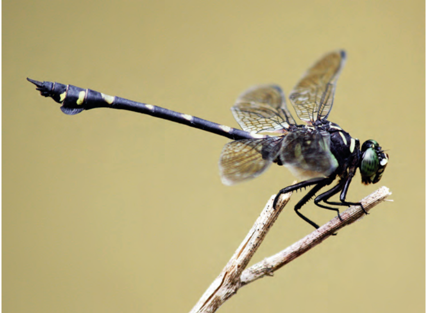
Figure 6: Ictinogomphus decoratus melaenops .

Based on literature (Hämäläinen & Müller, 1997) and the database of the Roland Müller Philippine Odonata collection (provided by Matti Hämäläinen to the first author), there are only three specimens of this species known from the Philippines, one from northern Palawan and two from Dumaran Island.