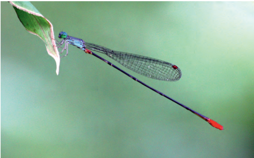
Figure 5: Teinobasis rubricauda .

Teinobasis rubricauda Lieftinck, 1974 [P2] (Figure 5)