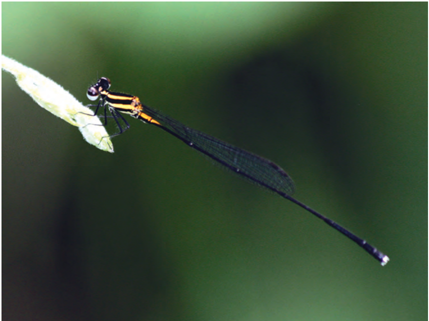
Figure 4: Prodasineura palawana .

This species is the most abundant Prodasineura in the Palawan region. It can be found in partly disturbed partly pristine flowing fluvial systems. However, this species is rarely encountered in swampy areas unlike the undescribed species mentioned below.