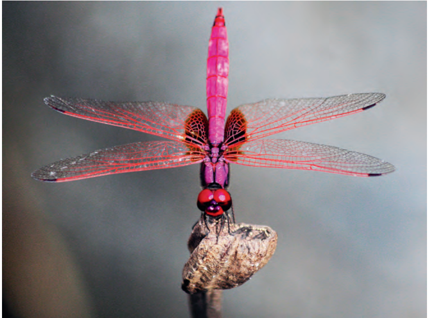
Figure 8: Trithemis aurora .