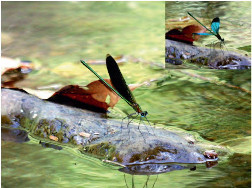
Figure 2: Neurobasis daviesi .

The species was found on both Nagmatong and Magbabaw rivers (yellow circle), both part of headwater of Layongan River. However, the species is likely to be