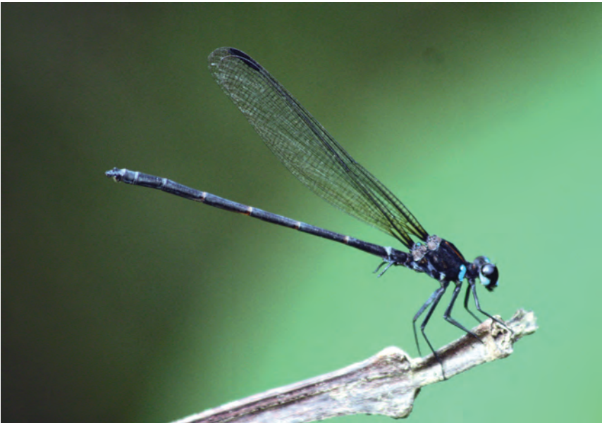
Figure 3: Cyclophaea cyanifrons .

Cyclophaea cyanifrons Ris, 1930 [P2] (Figure 3)