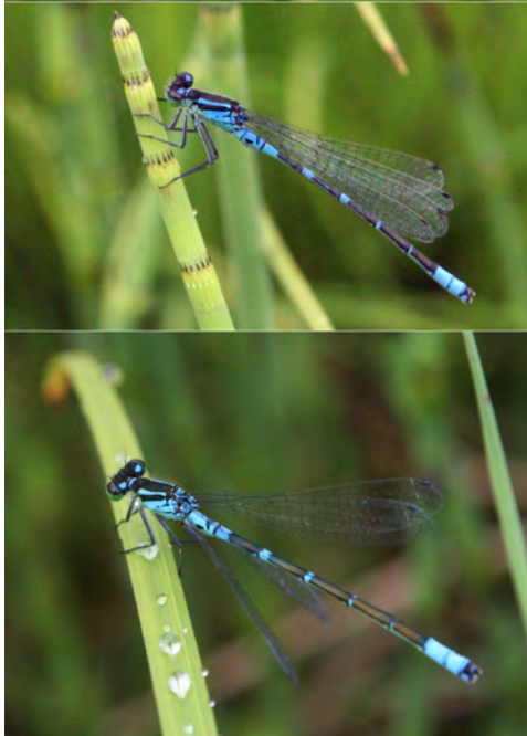
Figure 17. A male of Coenagrion lunulatum at a shallow grassy pool at the Uyuk River right bank near the broken bridge at Uyuk village, 1.07.2017.