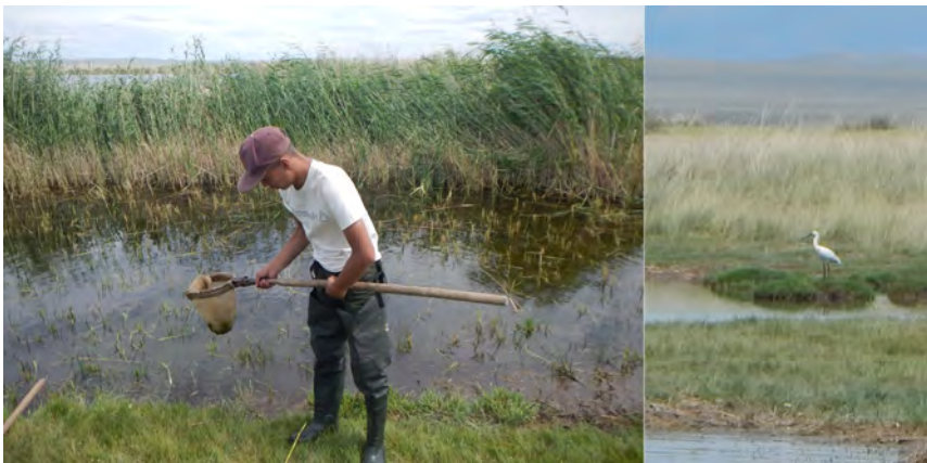
Figure 1. “1st lake” at small lake at the SW bank of the large Lake Shara-Nur in the Ubsu-Nur Depression, loc. 6 in Fig. 2, 6.07.2017.