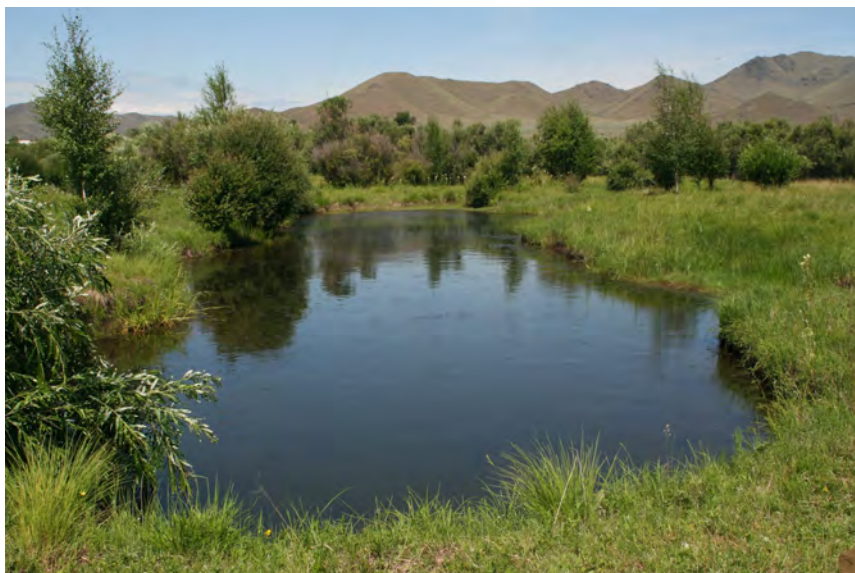
Figure 5. An Uyuk River oxbow lake at Uyuk village, a habitat of Coenagrion hylas , C. armatum , C. lunulatum , Aeshna juncea , Somatochlora graeseri , Leucorrhinia rubicunda , Libellula quadrimaculata , 5.07.2017.