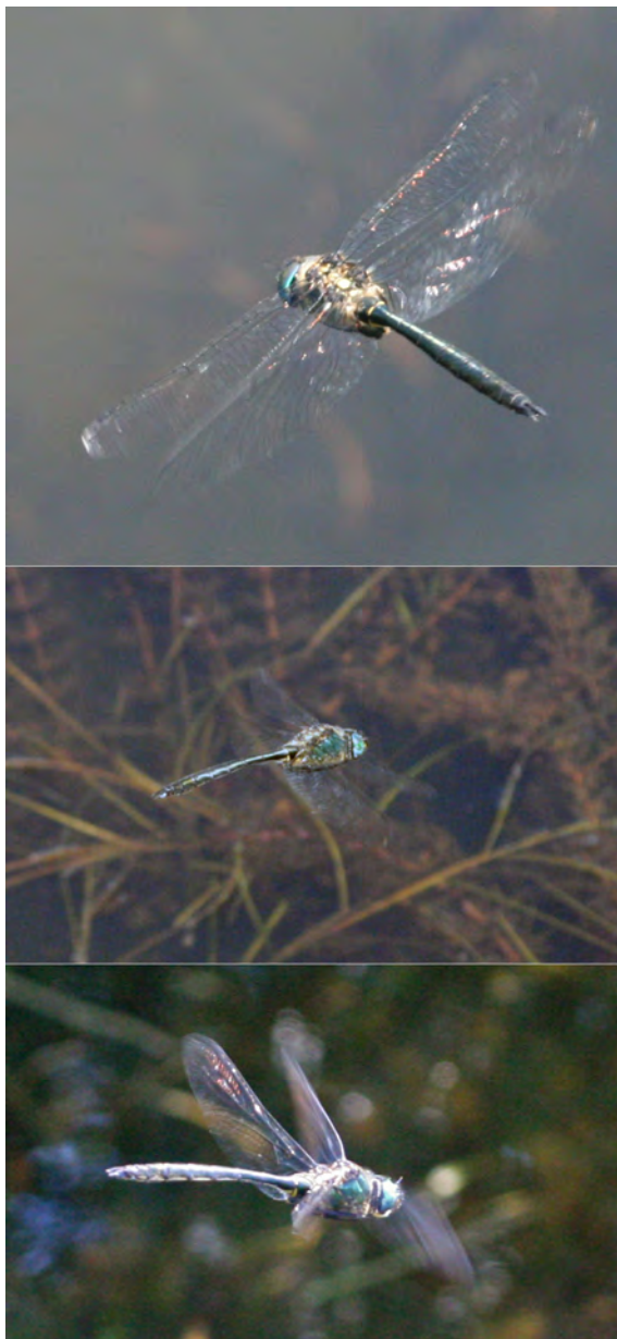
Figure 14. A male of Somatochlora graeseri hovering over a right oxbow lake of the Uyuk River at Uyuk village, 5.07.2017.