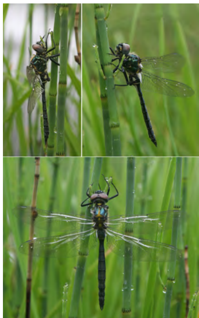
Figure 9. A just hatched male of Somatochlora exuberata at the bank of an arm of the Uyuk River at Uyuk village. 1.07.2017