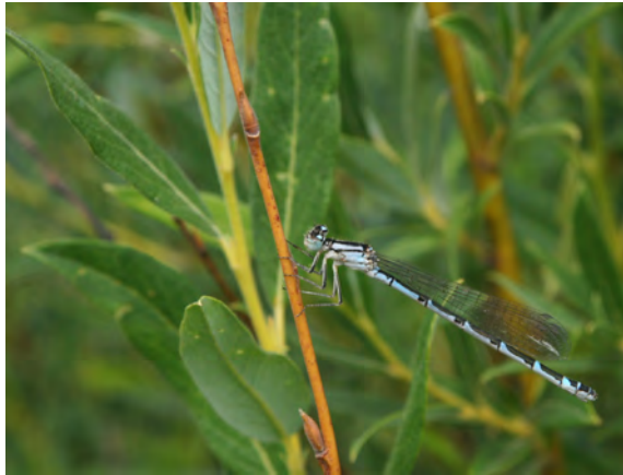
Figure 12. A female of Enallagma cyathigerum at the Uyak River bank at Uyak village, 30.06.2017.