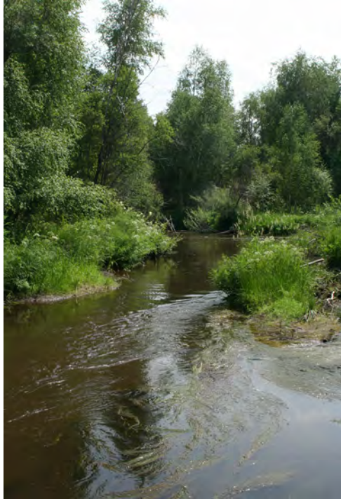
Figure 7. A riffle at the Uyuk River at Uyuk village, a preferred habitat of Ophiomphus spinicornis , 30.06.2017.

(Fig. 8a), mostly at riffles (as in Fig. 7), ranged nearby over the water and chased each other; on 30.06.2017 a teneral male was seen, proving reproduction in this river section. On 5.07.2017 both species were encountered also at small openings between the dry and inundated parts of spruce forest nearby (some dozens of metres from the river); three females of O. spinicornis and two males of S. exuberata . One of those males ranged between trees; the second appeared and started to range at the same place after 20 min since I had collected the first. The collected one was obviously teneral. On the rainy 1.07.2017, just hatched male