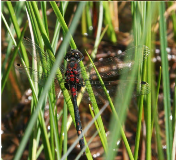
Figure 27. A male of Leucorrhinia dubia at the small peat-moss bog at the SW bank of Lake Oyskoe, 29.06.2017.