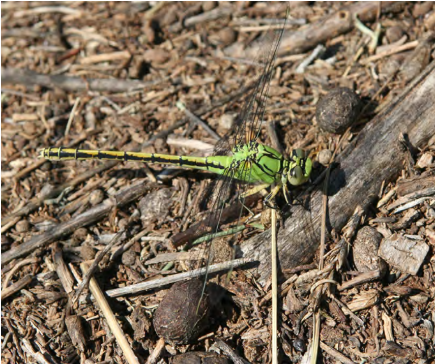
Figure 20. A female of Ophiogomphus spinicornis near the Tes Khem River right bank 16 km SW of Samagaltay village, 4.07.2017.