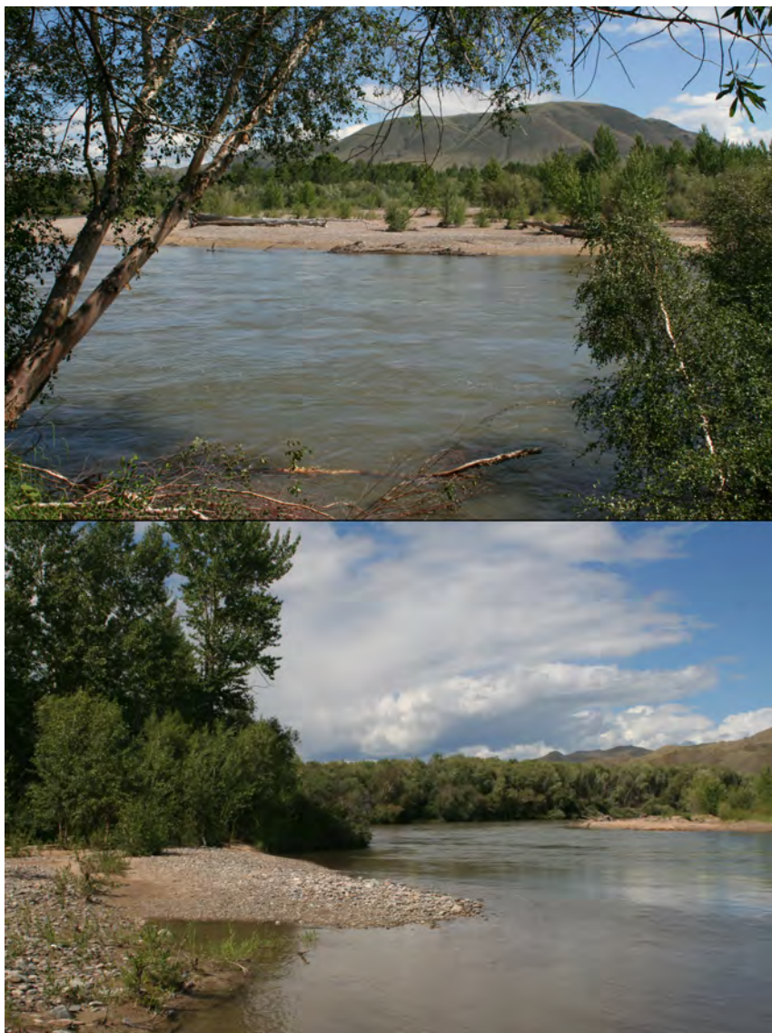
Figure 19. The Tes-Khem River 16 km SW of Samagaltay village, 4.07.2017.