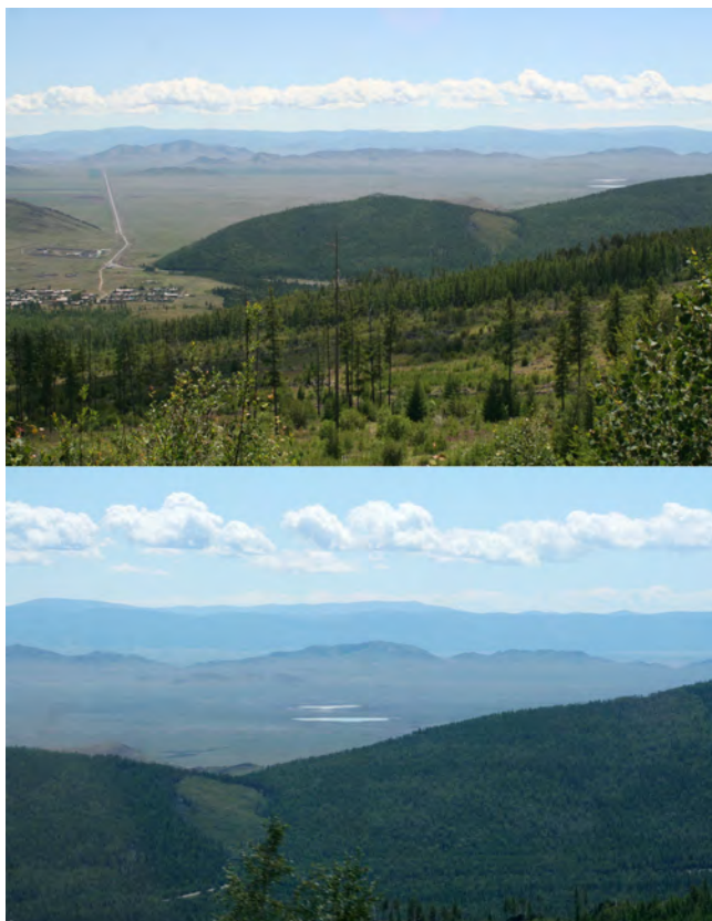
Figure 3. The Turan Depression as viewed from the Kurtushibinskiy Mountain Range in the north, 7.07.2017. Shivilig village and the Kislye Lakes are seen.

species were reported: S. paedisca , C. hylas , C. lunulatum and S. flaveolum . The first author examined this valley between the two functional bridges (there is another broken one in between), that is for the length of Uyuk village stretched along its northern board, on 30.06.2017 (12:30 – 14:40), 1.07.2017 (11:30 – 14:30) and 5.07.2017 (10:20 – 16:45). The second visit was after a strong night thunderstorm, the day was overcast with several weaker rains, on the two other visits the weather was fine.