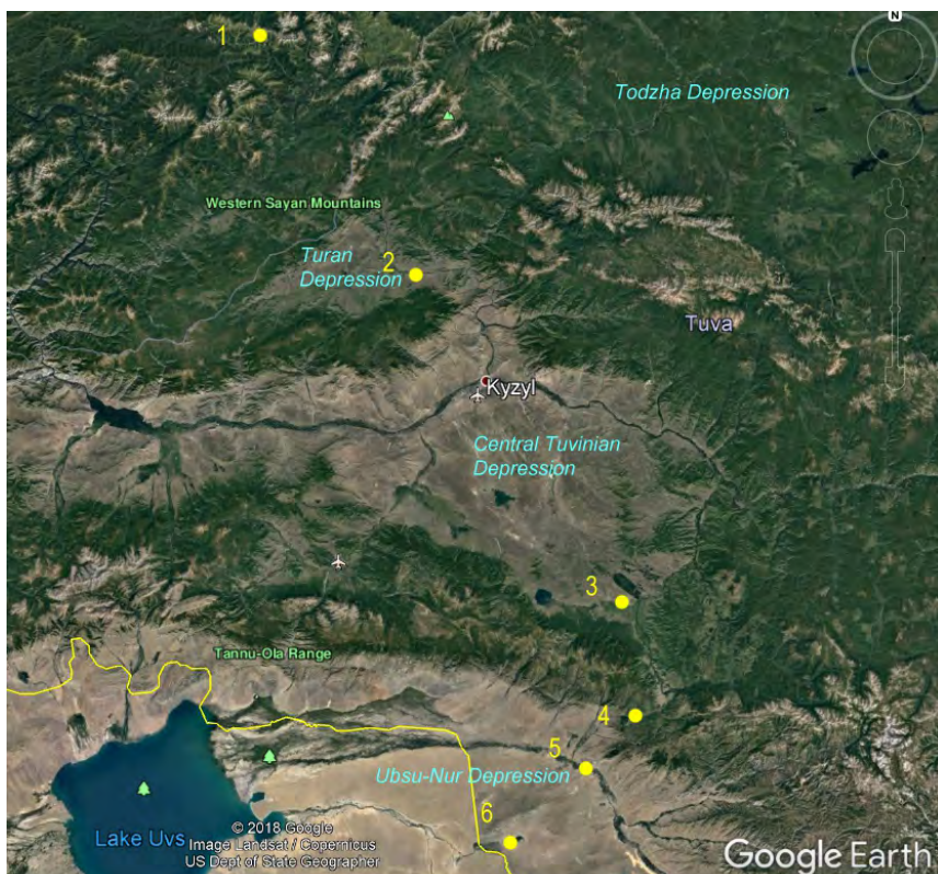
Figure 2. Localities mentioned in the text; in Krasnoyarskiy Kray: 1 – Lake Oyskoe; in Tyva Republic or Tuva: 2 – the Uyuk River at Uyuk village; 3 – the Mazhalyk River; 4 – the Shurmakskiy Pass through the East Tannu-Ola Mts'; 5 – the Tes Khem River; 6 – “1st lake” at Lake Shara-Nur.

Along with S. fonscolombii , the collection from the same site included 16 males and 7 females (some teneral) of Enallagma cyathigerum risi Schmidt, 1971 and a female of Libellula quadrimaculata Linnaeus, 1758.