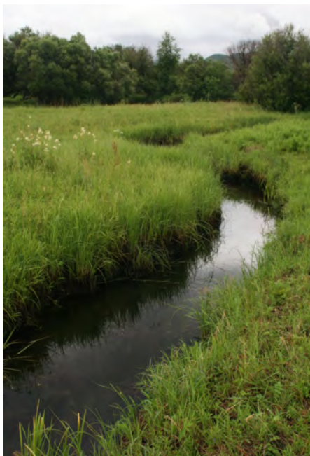
Figure 10. The right narrow arm the Uyuk River at the broken bridge at Uyuk village where just hatched male and female of Somatochlora exuberata were found, 1.07.2017.