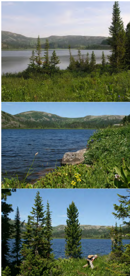
Figure 22. Lake Oyskoe, 1414 m a.s.l., at the junction of the Kulumys and Ergaki Ranges of the West Sayan Mountains, loc. 1 in Fig. 2, a habitat of Enallagma cyathigerum risi , 29.06.2017.

On 29-30.06.2017 the first author had an opportunity to examine Lake Oyskoe and its vicinities, situated to the north from Tuva over the West Sayan (loc. 1 in Fig. 2) and representing typical landscapes of the humid, taigaous northern principle slope of the Sayans. This is a large (1,46 × 0.57 km; area of 52-57 ha) and deep (to 25 m) lake (Fig. 22) from where the large Oya River, a right tributary of the Yenisey, starts. It is situated at 1414 m a.s.l. on the plateau at the junction of Kulumys and Ergaki Mountain Ranges and surrounded by lush flowery subalpine meadows and open fir ( Abies sibirica Ledeb.) forests with participation of Siberian stone pine ( Pinus sibirica Ledeb.) (Fig. 22). From this lake the famous picturesque peaks of Ergaki are seen (shown in Fig. 23 as viewed from the opposite side from the lake) and there is a large tourist base at