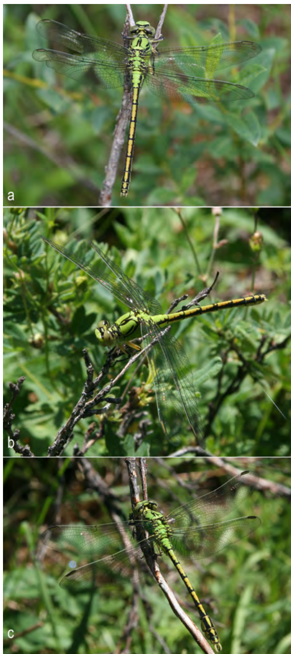
Figure 18. A female (a, b) and male (c) of Ophiogomphus spinicornis at a large glade at the pass of the Federal Road M54 'Yenisey' through the East Tannu Ola Mountain Range, ~1440 m a.s.l., 13 km WSW of Samagaltay village, 4.07.2017.