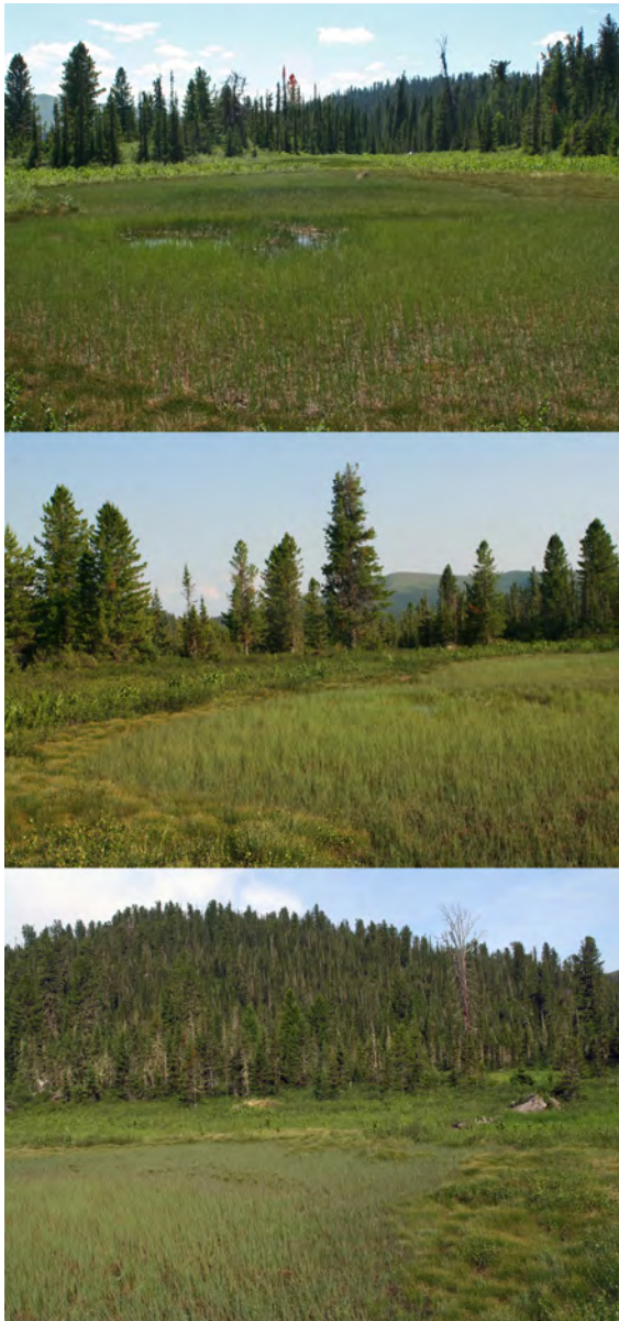
Figure 25. A small peat-moss bog at the SW bank of Lake Oyskoe, on the right bank of the nascent Oya River, a habitat of Coenagrion johanssoni , C. hastulatum , Aeshna caerulea , Somatochlora alpestris , Leucorrhinia dubia , Sympetrum flaveolum , 29-30.06.2017.

At the southern end of the lake, at the right bank of the nascent Oya River at its very outflow of the lake, there is an open peat-moss bog ca 130 × 50 m, with sedge and sundew, soaking with water but allowing walking. It has two small water “windows” margined with floating bog not holding a human, with sparse emerging Carex spp., surrounded by spruce/fir/Siberian stone pine forest (Fig. 25). This bog was examined at 13:20-14:00 and 18:20-19:50 and 20:40-21:00 on 29.06.2017 and at 8:00-8:42 on 30.06.2017. There were many males and tandems of C. johanssoni (Fig. 26), one female of C. hastulatum and quite a few males (including tenebrals) and few copulae of Leucorrhinia dubia dubia (Fig. 27) and one male of S. flaveolum .