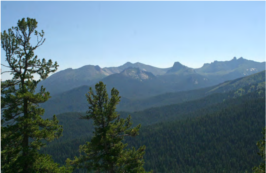
Figure 23. The Ergaki Mountain Range as viewed from the northern side, opposite to Lake Oyskoe (Fig. 22), 29.06.2017.

its bank. The water edge is formed by stones but the banks are entirely covered with tall meadows, with sparse young fir and Siberian stone pine trees, somewhere with peat-moss patches. During our visit the water unexpectedly was not cold.