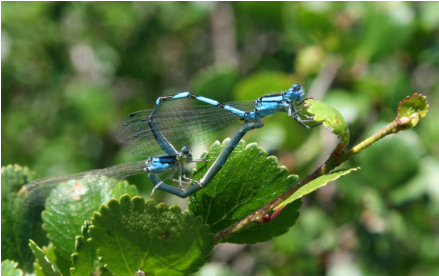
Figure 24. A copula of Enallagma cyathigerum risi at the SE bank of Lake Oyskoe, 29.06.2017.