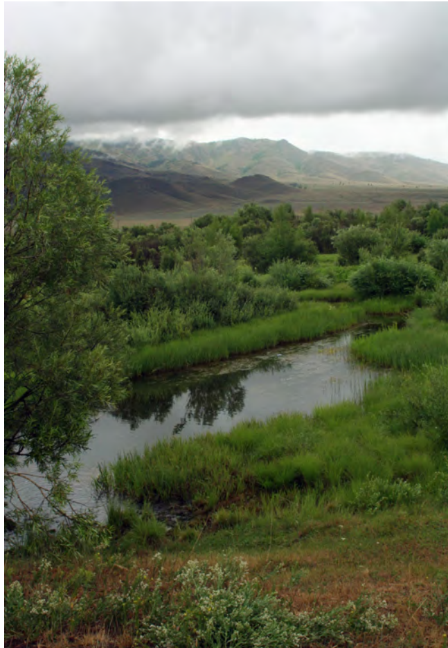
Figure 4. The Uyuk River valley and an oxbow lake at Uyuk village, 1.07.2017.

with huge tussocks of Carex caespitosa L. under spruces and willows and pools of open cold water of various size and depth with Carex spp. (mostly C. limosa L., C. rostrata L. etc.), Menyanthes trifoliata L. and Calla palustris L. A larger deep swamp, surrounded by willow bushes and huge tussocks, is adjacent to this forest from the east. On 1.07.2017, after the strong rain, the water between the tussocks rose up to knee- to waist-deep, became ice-cold (as groundwater fed), and some current appeared along certain routes through pools and among tussocks.