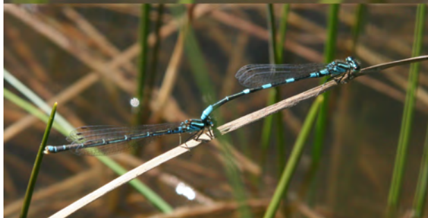
Figure 26. A female in cobweb (a) and a tandem (b) of Coenagrion johanssoni at the small peat-moss bog at the SW bank of Lake Oyskoe, 29.06.2017.