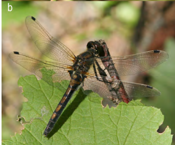
Figure 13. A male (a) and female (b) of Leucorrhinia rubicunda at a shallow pool and a glade in a spruce forest, respectively, at the right floodland of the Uyak River at Uyak village, 5.07.2017.