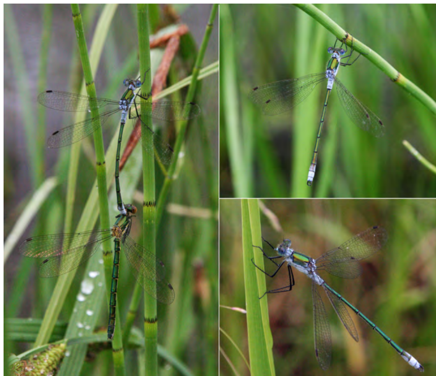
Figure 15. A tandem and male of Lestes sponsa at a shallow grassy pool at the Uyuk River right bank near the broken bridge at Uyuk village, 1.07.2017.