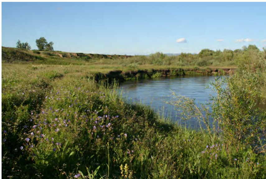
Figure 21. The Mazhalyk River valley where it is crossed by Federal Road M54 'Yenisey', loc. 3 in Fig. 2, a habitat of Erythromma najas humerale and Sympetrum flaveolum , as observed on 4.07.2017.