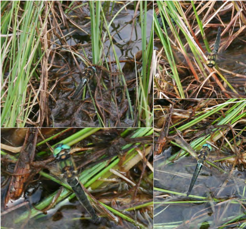
Figure 28. A female of Somatochlora alpestris ovipositing among sedge at a pool at the small peat-moss bog at the SW bank of Lake Oyskoe at 8:30-8:34, 30.06.2017.

A male of larger Aeshna sp. ( juncea or subarctica Walker, 1908 judging by the size) repeatedly appeared at ca period 17:00-18:00 on 29.06.2017 and twice at 8:00-8:40 next day to widely range with irregular trajectories ca 1.5 m over the bog for short period of time; a female ovipositing among sedge was found just after the sunset at ca 19:00. All these larger darners were missed.