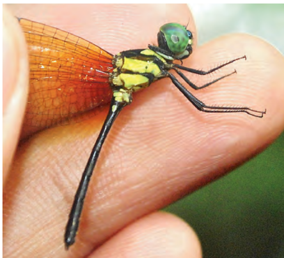
Figure 23. Tetrathemis flavescens Kirby, 1889.