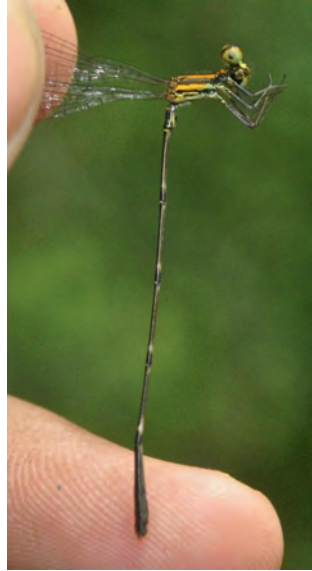
Figure 16. " Elatoneura " longispina Liefinck, 1937.