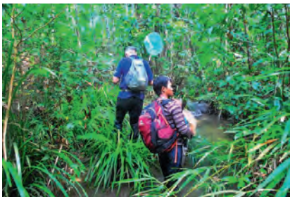
Figure 6. Forest stream at Tungkusan (location 6).