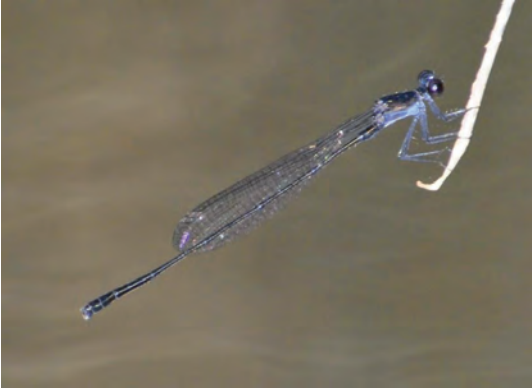
Figure 15. " Elatoneura " coomansi Liefinck, 1937.