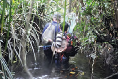
Figure 3. Habitat at Air Pute, a black water stream and surrounded by Pandanus species, located at Mempiu Village (location 1) (Photo: J. F. Bilitoni).