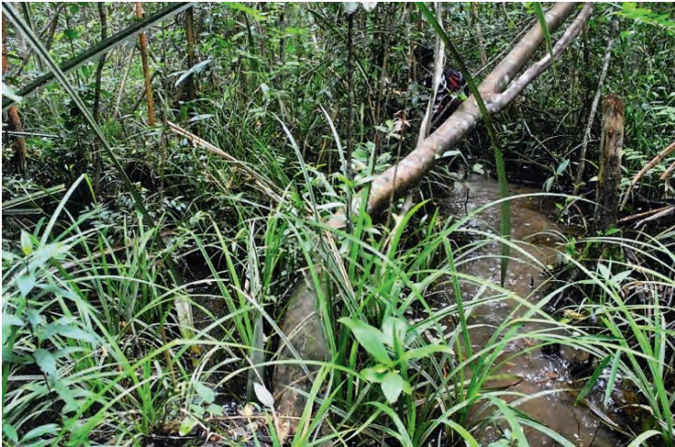
Figure 4. Swamp habitat at location 2.