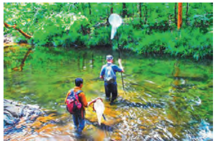
Figure 7. Stream below Gurok Beraye Waterfall on Gunung Tajam (location 8).