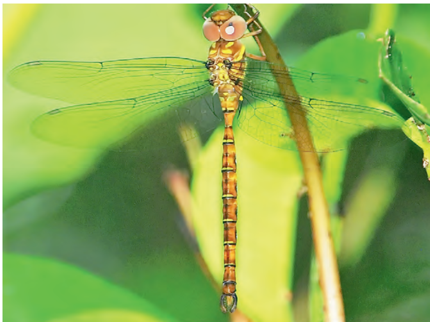
Figure 21. Oligoaeschna buehri (Förster, 1903).