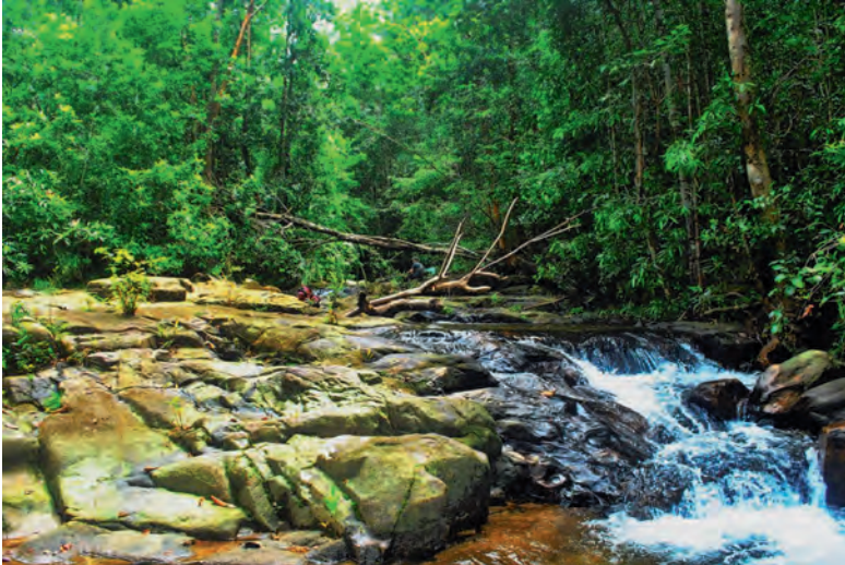
Figure 8. Large stream in the forest at Batu Mentas Tarsier Sanctuary (location 11).