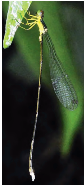
Figure 18. Amphicnemis kuiperi Liefinck, 1937.