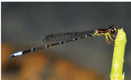
Figure 19. Mortonagrion appendiculatum Lieftinck, 1937.