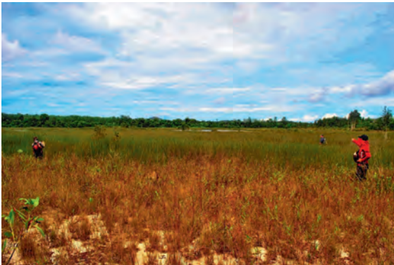
Figure 10. The authors at the lake near Air Seruk Village (location 15); the lake is surrounded by Water Chesnut " Eliocharis dulcis ".