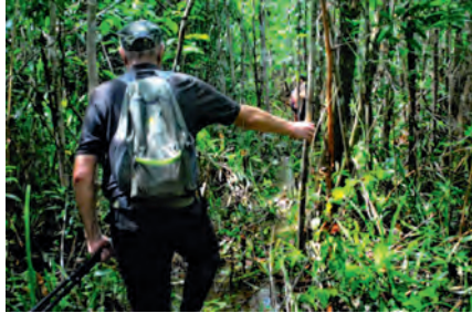
Figure 5. Swampy forest at Buluh Tumbang Village (location 4).