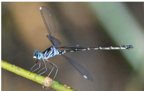
Figure 14. Podolestes orientalis Selys, 1862.