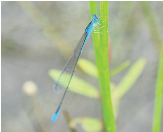
Figure 17. Aciagrion hisopa (Selys, 1876).