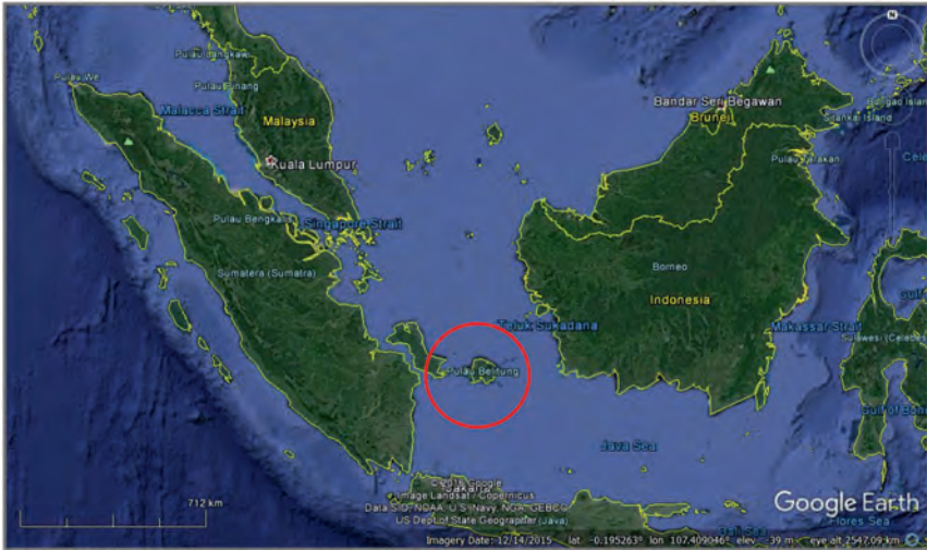
Figure 1. Belitung Island and small surrounding islands.