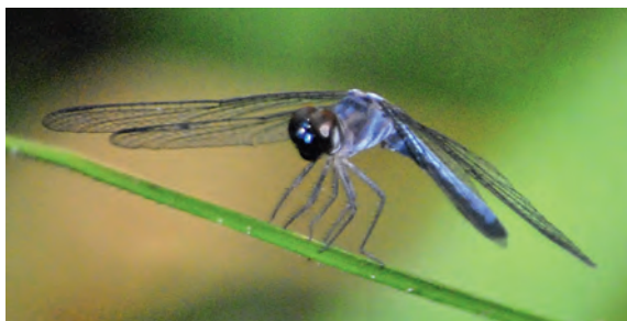
Figure 24. Tyriobapta laidlawi Ris, 1919.