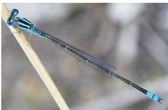
Figure 20. Pseudagrion coomansi Lieftinck, 1937.