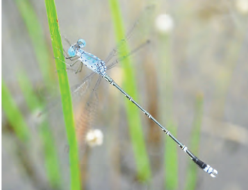
Figure 13. Lestes praemorsus decipiens Kirby, 1894.