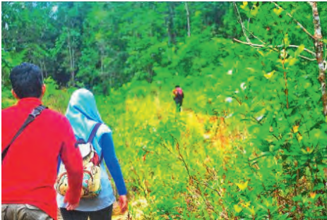
Figure 9. On a trail at Batu Mentas (location 12).