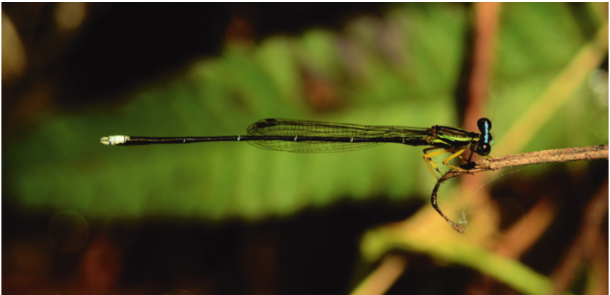
Figure 28: Coper marginipes (Rambur, 1842) male.