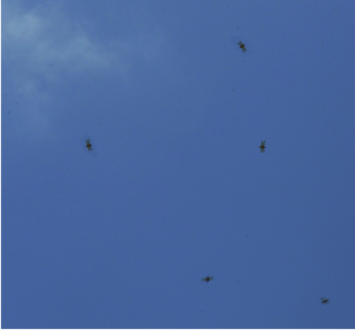
Figure 19: More than 50 Hydrobasi-leus croceus were found to swarm together at a height of about 20-25m.