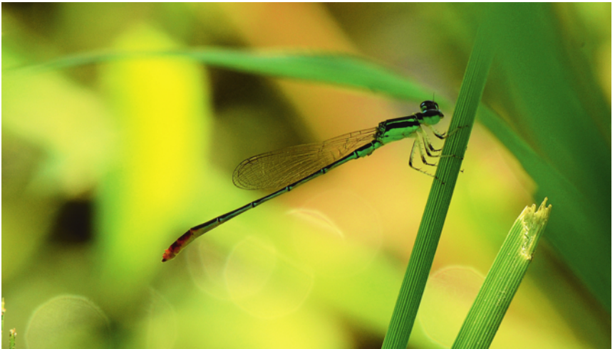
Figure 24: Agriocnemis femina (Brauer, 1868) male.