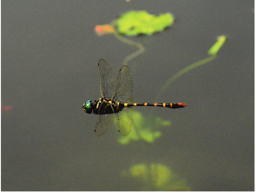
Figure 32: Epophthalmia vittata Burmeister, 1839 male.