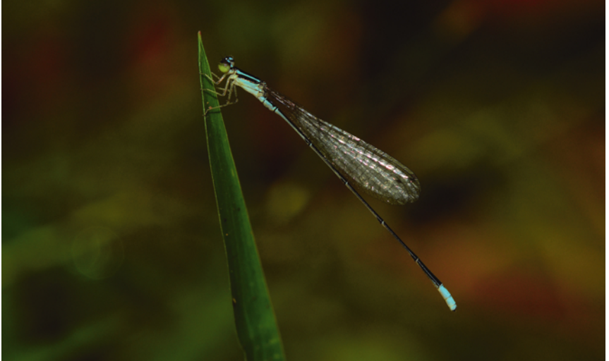
Figure 23: Aciagrion sp. male.