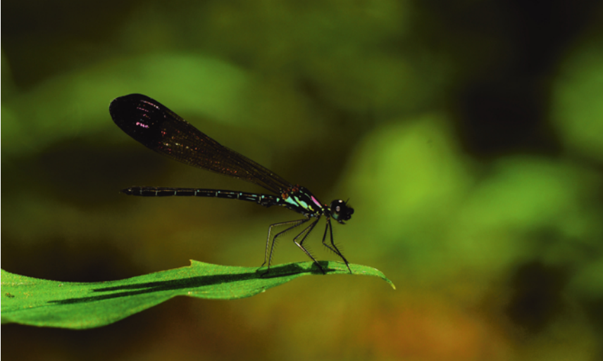
Figure 21: Heliocypha biforata Selys, 1859 male.