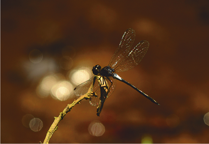
Figure 10: Amphithemis vacillans Selys, 1891 mature male.