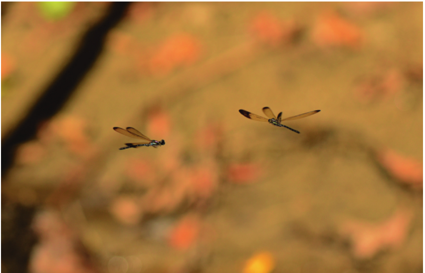
Figure 20: Two male individuals of Heliocypha biforata exhibiting the territorial display in flight.