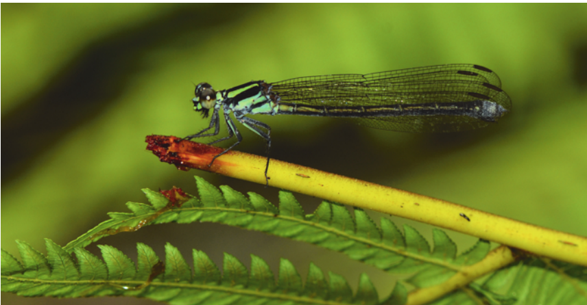
Figure 22: Anisopleura sp. female.