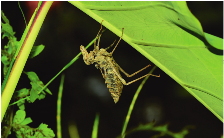
Figure 18: Exuvia of Epophthalmia vittata Burmeister, 1839.

Diagnosis: Strong backwardly directed dorsal spines, lateral spines of 9th and 10th segment very long. Eyes protruding backwards and distinctly pointed (Fig.17).