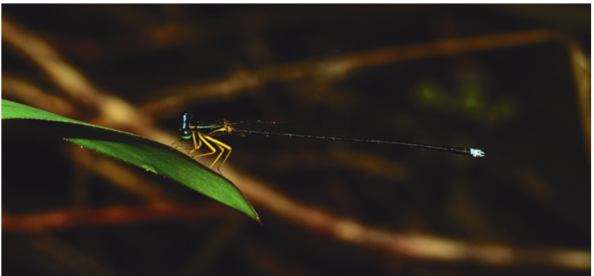
Figure 29: Coper vittata Selys, 1863 male.