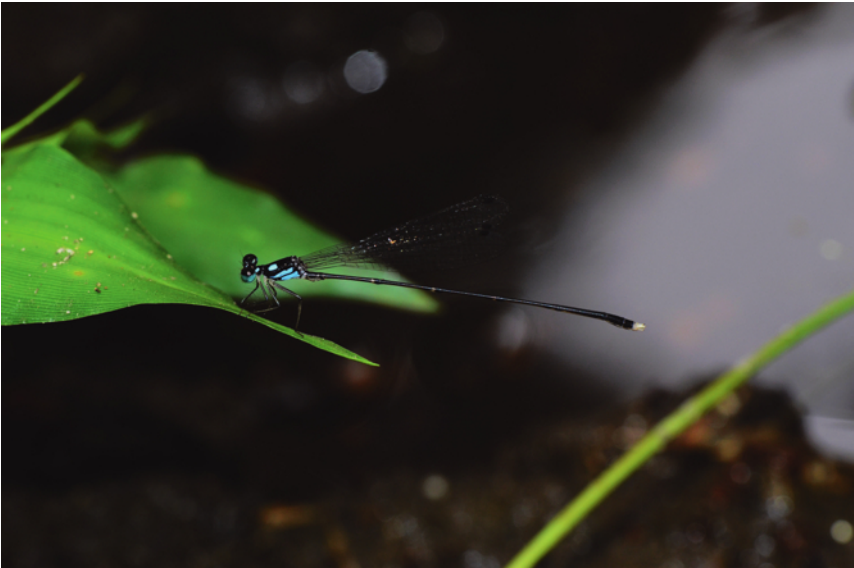
Figure 11: Coeliccia bimaculata Laidlaw, 1914 male.