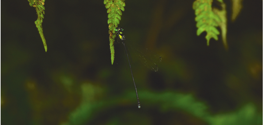
Figure 12: Coeliccia renifera (Selys, 1886) male.