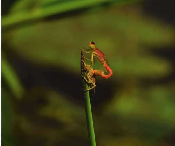
Figure 16: Emerging individual of Agriocnemis femina (Brauer, 1868) female.