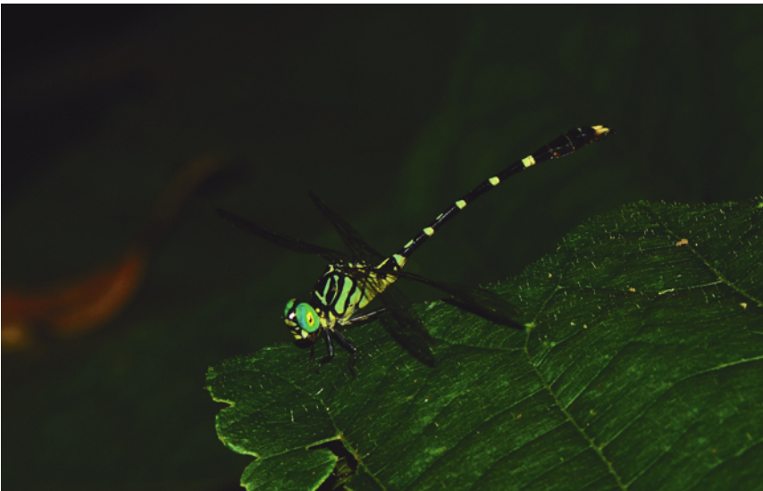
Figure 31: Nychogomphus cf. duaricus (Fraser, 1924) male.