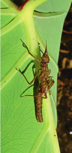
Figure 15: Exuvia of Vestalis sp.