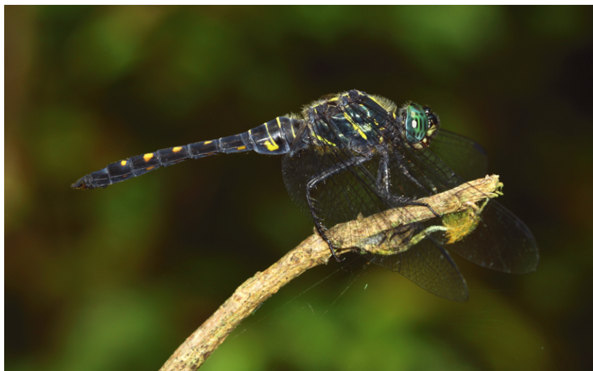
Figure 12. Onychothemis testacea male, photograph by C.Y. Choong.