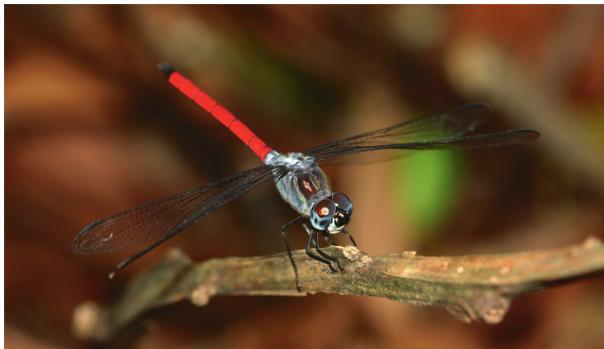
Figure 11. Lathrecista asiatica male, photograph by C.Y. Choong.