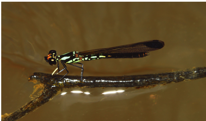
Figure 4. Libellago stigmatizans male, photograph by C.Y. Choong.