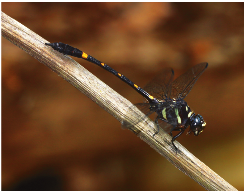
Figure 8. Gomphidia abbotti male, photograph by C.Y. Choong.

9 – ♂, 29.viii, CYC; ♂, 29.viii, RAD. 11 – ♂, 28.viii, RAD.