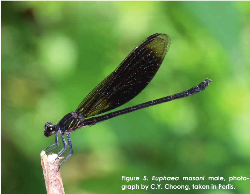
Figure 5. Euphaea masoni male, photograph by C.Y. Choong, taken in Perlis.