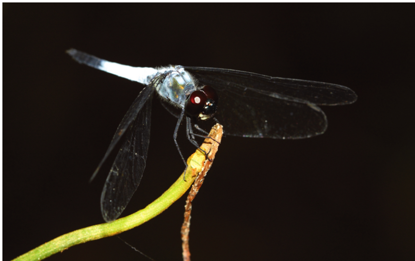
Figure 10. Brachydiplax farinosa B male, photograph by C.Y. Choong.

5 – ♂, 25.viii, CYC; 3 ♂♂, ♀, 25.viii, RAD.