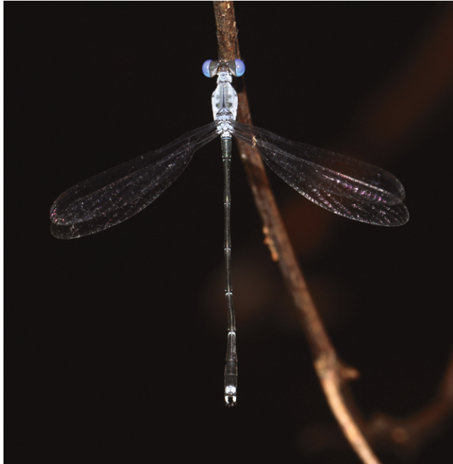
Figure 3. Lestes praecellens male, photograph by C. Y. Choong, taken at location 3.

2 – ♂, 26.viii, RAD. 3 – 2 ♂♂, 25.viii, CYC; 3 ♂♂, 25.viii, RAD; ♂, 26.viii, RAD.