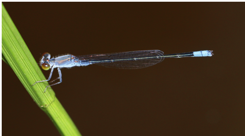
Figure 7. Paracercion calamorum male, photograph by C.Y. Choong, taken at location 5.