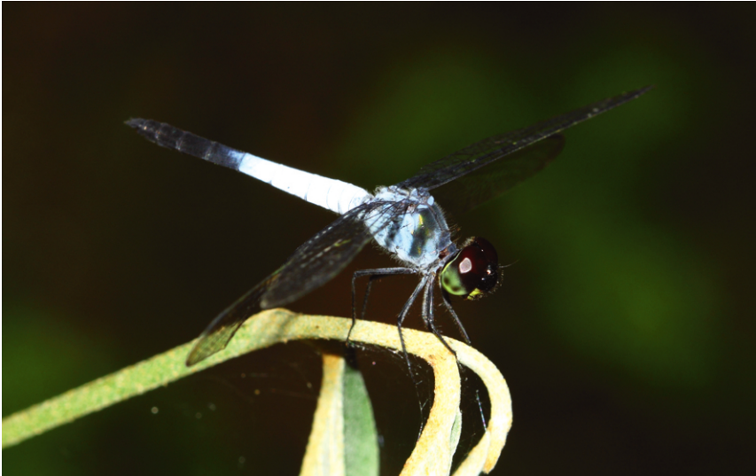
Figure 9. Brachydiplax farinosa A male, photograph by C.Y. Choong.