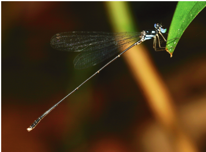
Figure 6. Coelliccia albicauda male, photograph by C.Y. Chong.

7 – 3 ♂♂, ♀, 27.viii, CYC; 2 ♂♂, 27.viii, RAD. 9 – ♂, 29.viii, CYC; ♂, 29.viii, RAD. 11 – ♂, 28.viii, CYC; 3 ♂♂, 28.viii, RAD.