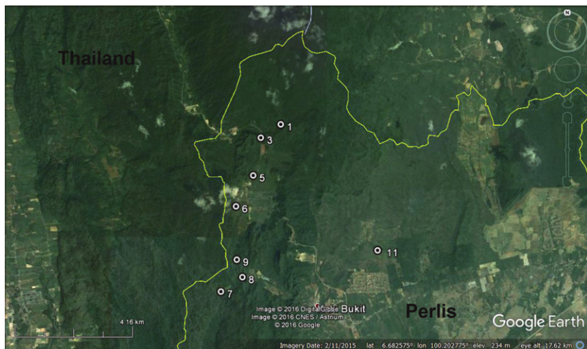
Figure 2: Sampling sites in Perlis.

In August 2015 we made a short trip to Perlis, staying in Perlis State Park at Wang Kelian, near to the border with Thailand in the extreme north of the state. Collecting was carried out on 25-29 August. At the time of our visit it was unsafe to go far into