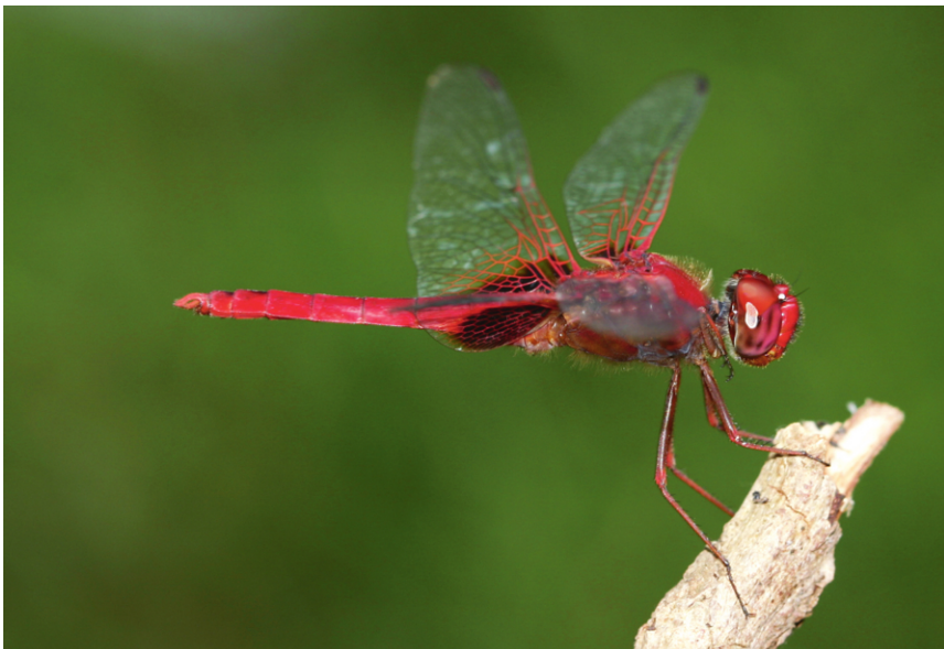
Figure 13. Urothemis signata insignata male, photograph by C.Y. Choong.