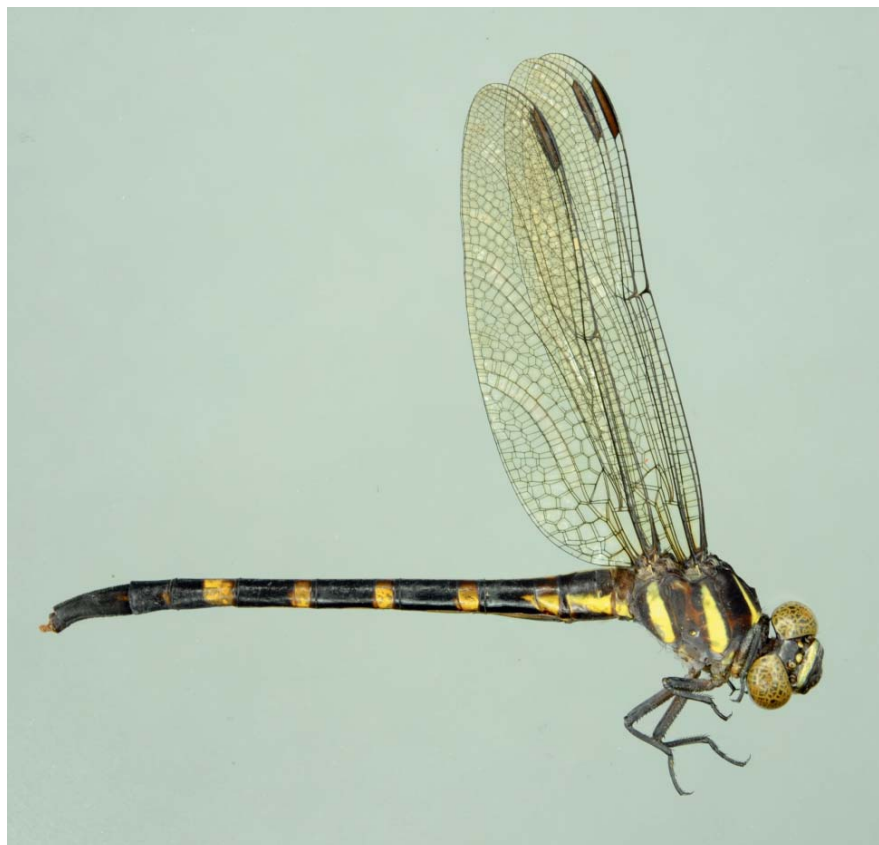
Figure 3. Macrogomphus phalantus female; specimen collected at Samunsam Wildlife Sanctuary.

Material to be listed elsewhere. Location 5.