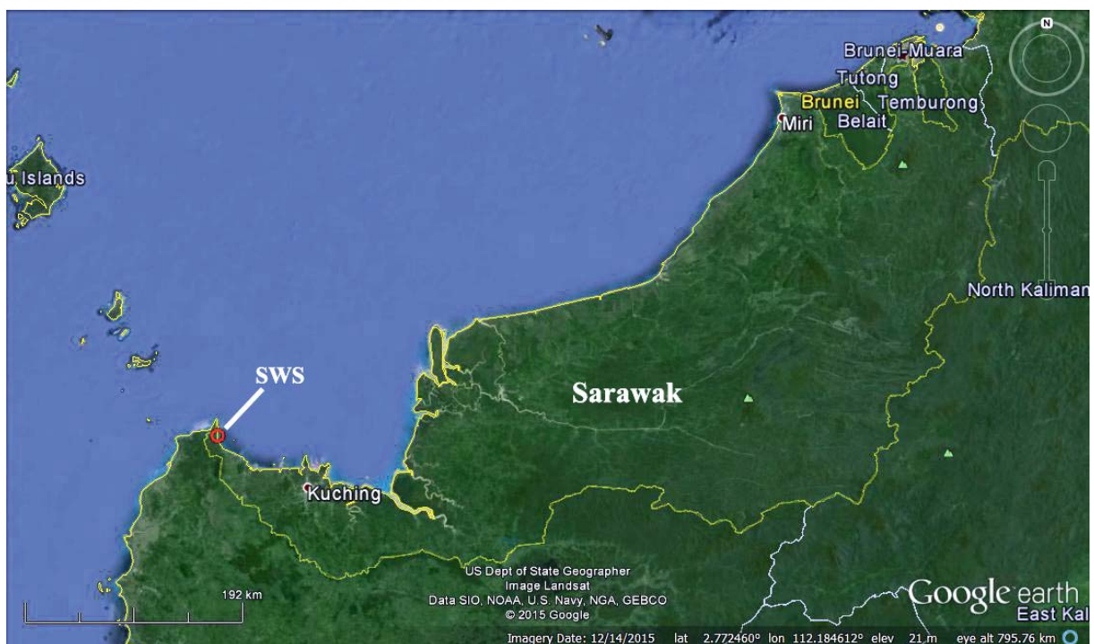
Figure 1. Location of the Samunsam Wildlife Sanctuary in Sarawak.

Samunsam Wildlife Sanctuary (SWS) is a an area of lowland rain forest in the extreme west of Sarawak (Fig. 1), in Sematan district of Kuching division. It was declared a wildlife sanctuary in 1979; the original area covers 61 km 2 . The original area is located