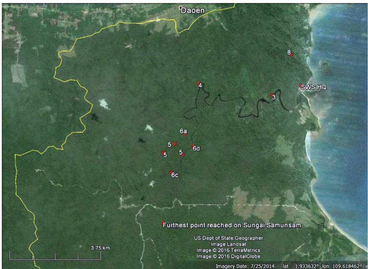
Figure 2. Locations of sampling sites in the Samunsam Wildlife Sanctuary.

At present SWS is reached by boat from the coastal town of Sematan. However an extension of the so-called Pan Borneo Highway will be built through the wildlife sanctuary, to connect to the communities at the south west tip of Sarawak; the exact route that the highway will take through the sanctuary is not yet known to me. Judging from satellite images there have been illegal encroachments and land clearing into the wildlife sanctuary along the Indonesian border (Fig. 2).