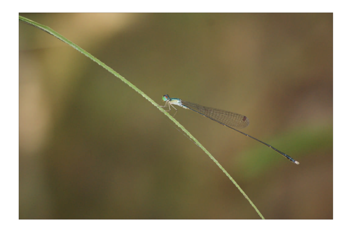
Figure 5: Amphicnemis sp.n.

This species belong to Amphicnemis furcata- group presently with four described species. It was found on a small Nipa swamp along with Teinobasis olivacea .