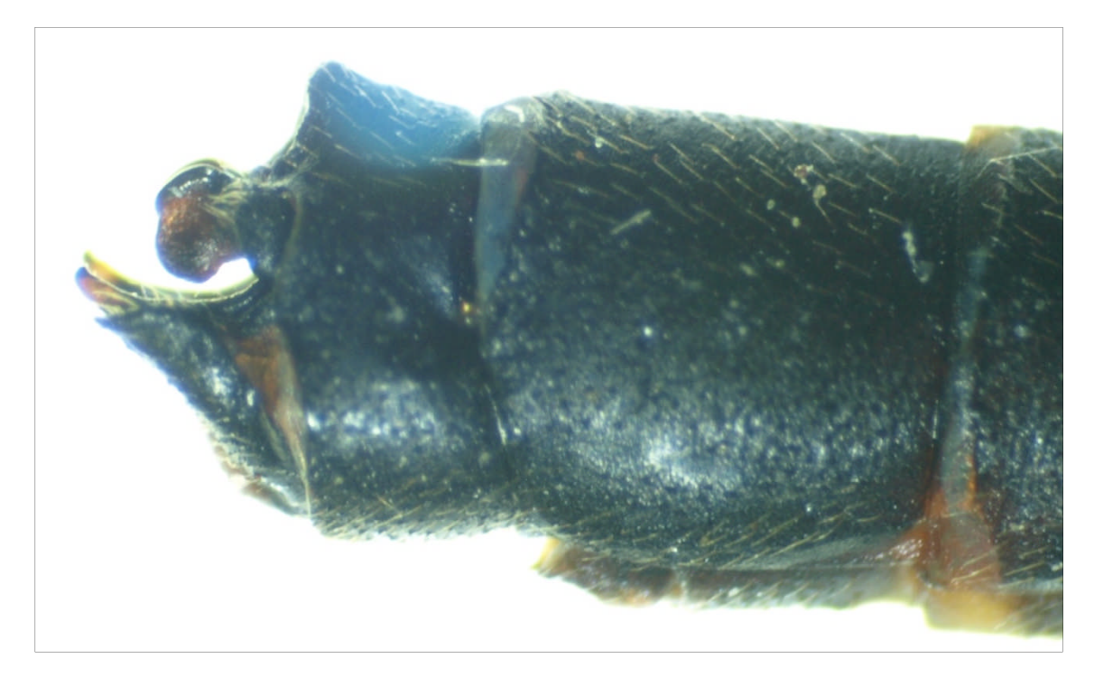
Figure 6: Teinobasis martinschorri sp.n., dorsal view photograph of superior anal appendage