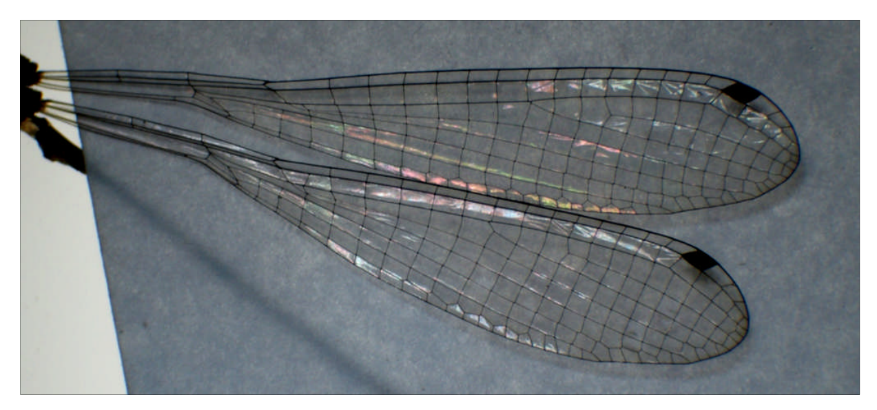
Figure 9: Teinobasis martinschorri sp.n., photograph of wing