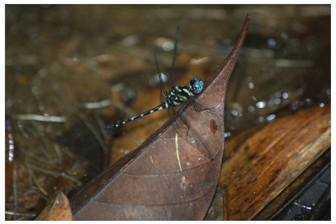
Figure 12: Diplacina lisa

51. Diplacina nana Brauer, 1868 (A, B, C)