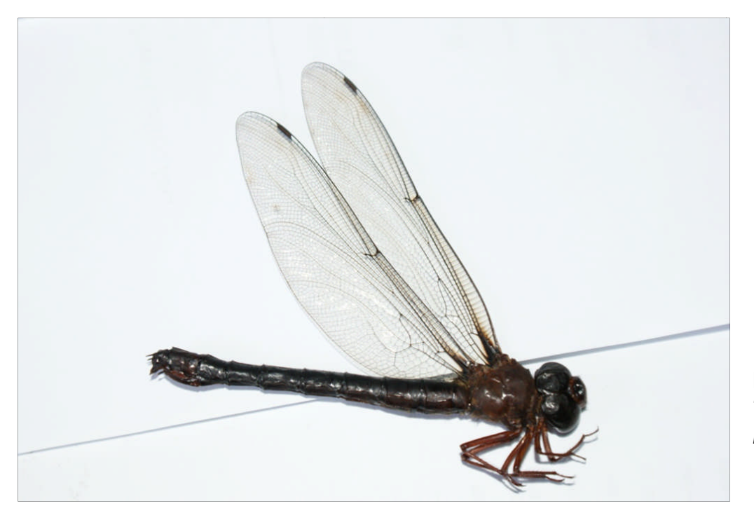
Figure 11: Tetracanthagyna bakeri