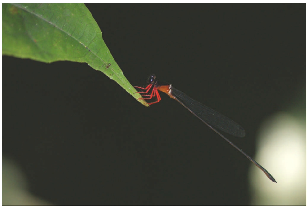
Figure 4: Risiocnemis haematopus

This damselfly was frequented in shady moist vertical surfaces of boulder and cliff where females were noted ovipositing. Sometimes it was found perching on twig or leaf blade of nearby vegetations but always near vertical surfaces.