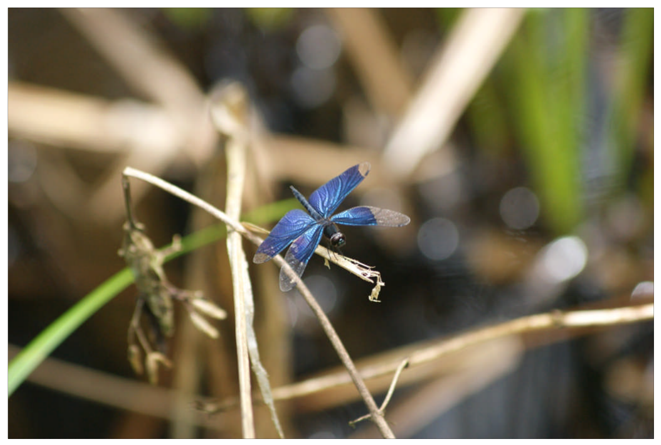
Figure 13: Rhyothemis cf. resplendens

The species closely resembles R. resplendens from Papua New Guinea and northern Australia. However, the hamulus and ventral spines of the cerci of Polillo population differs from those of the Papuan members. The ventral surface of the wings also differs being black instead of brownish.