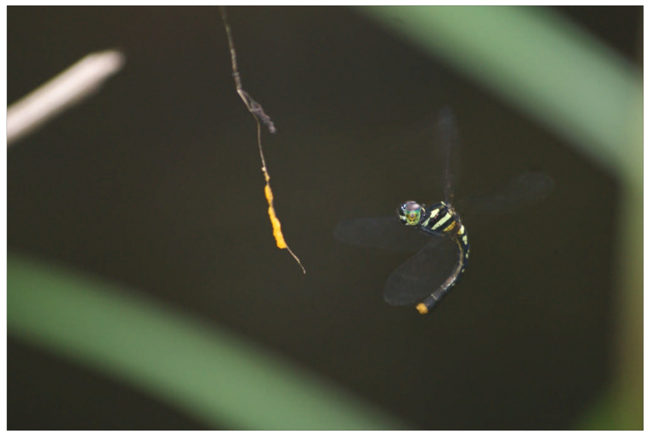
Figure 14: Tetrathemis i. irregularis