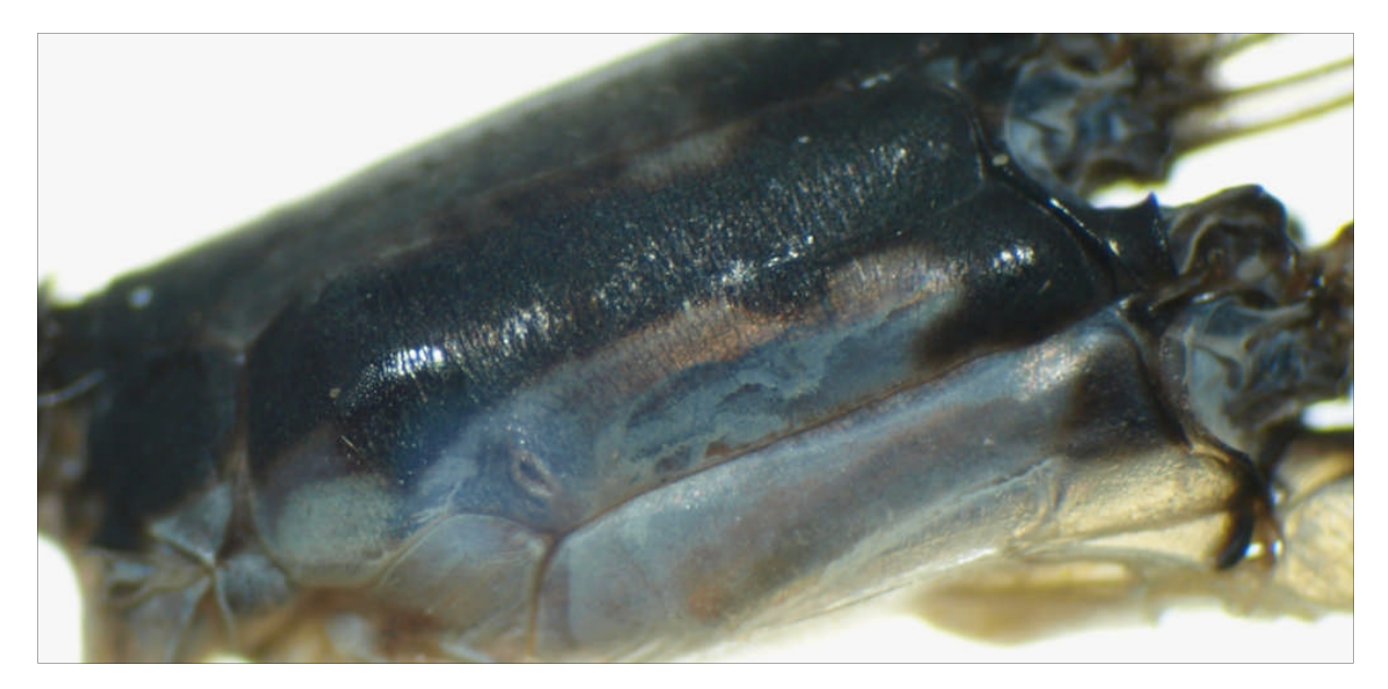
Figure 8: Teinobasis martinschorri sp.n., lateral view photograph of synthorax