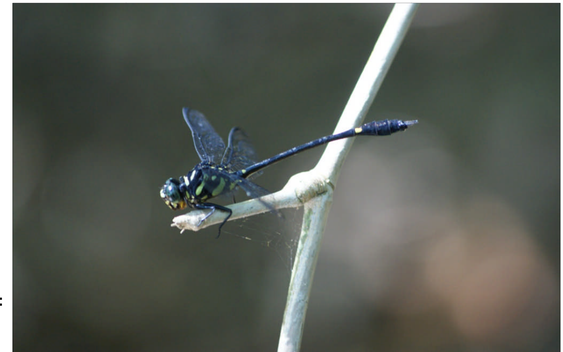
Figure 10: Gomphidia kirschii

The most abundant Anisoptera in the forested habitat explored. This was my first encounter with high density of this species. It is relatively rare in other Philippine islands.