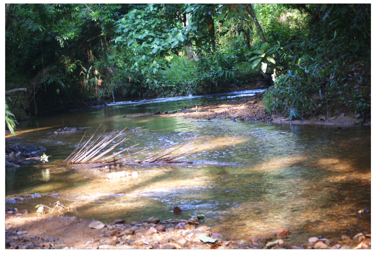
Figure 15: Forest stream

It is interesting to note that Vestalis melania a widely distributed species is absent in sites explored. This large damselfly is always associated in open clear forest streams (Figure 15) and small rivers. The sites explored included areas that are very suitable for the species and can hold a good population. Its absence from these sites suggests possible failure of species radiation to Polillo, a similar situation for Prodasineura integra in Babuyan and Batanes group of island (Villanueva, 2009a). Local extinction due to heavy deforestation from logging concessions during the middle of 20<sup>th</sup> century is also a possibility.