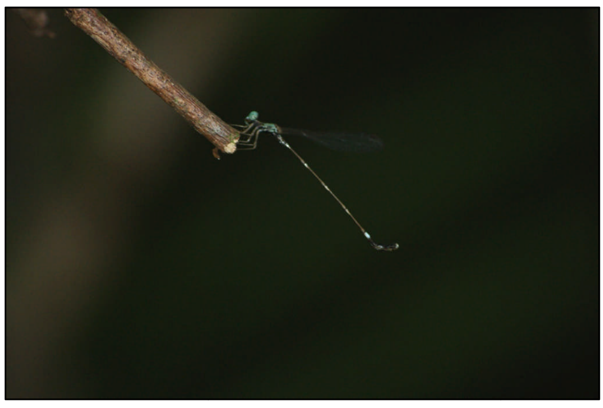
Figure 3: Sulcosticta sp.n.

Presently I refrain from naming and formally describing the species until more material is available.