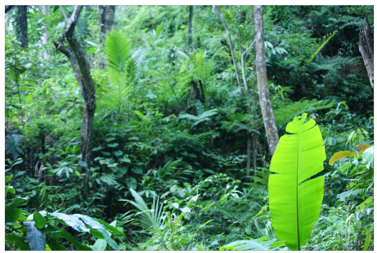
Figure 16: Reforestation using coconut