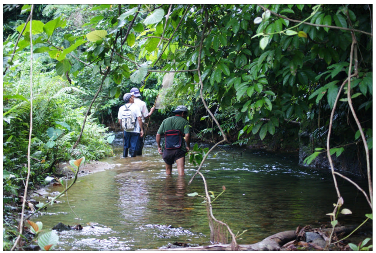
Figure 2: Assistant and field guides exploring forested stream in Salipsip area

The money granted by the IDF was used for the wages of local workers and transportations. Local workers served mainly as field guides and also help in locating and collecting Odonata (Figure 2). Most of the expenses incurred during the assessment came from IDF grant.